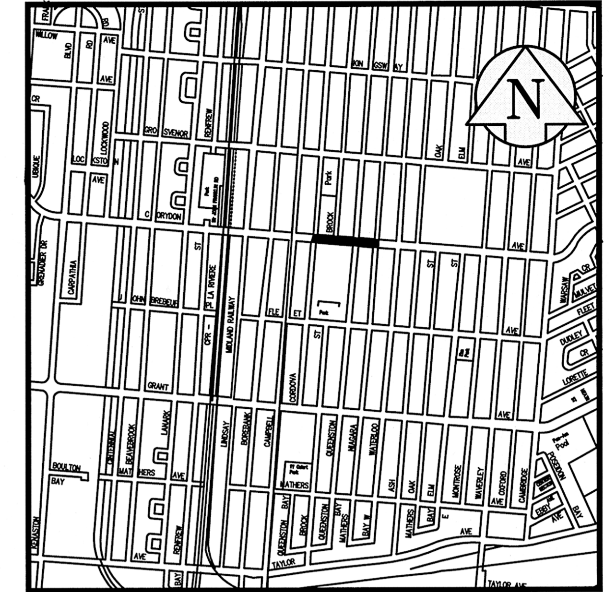
LOCATION PLAN CORYDON