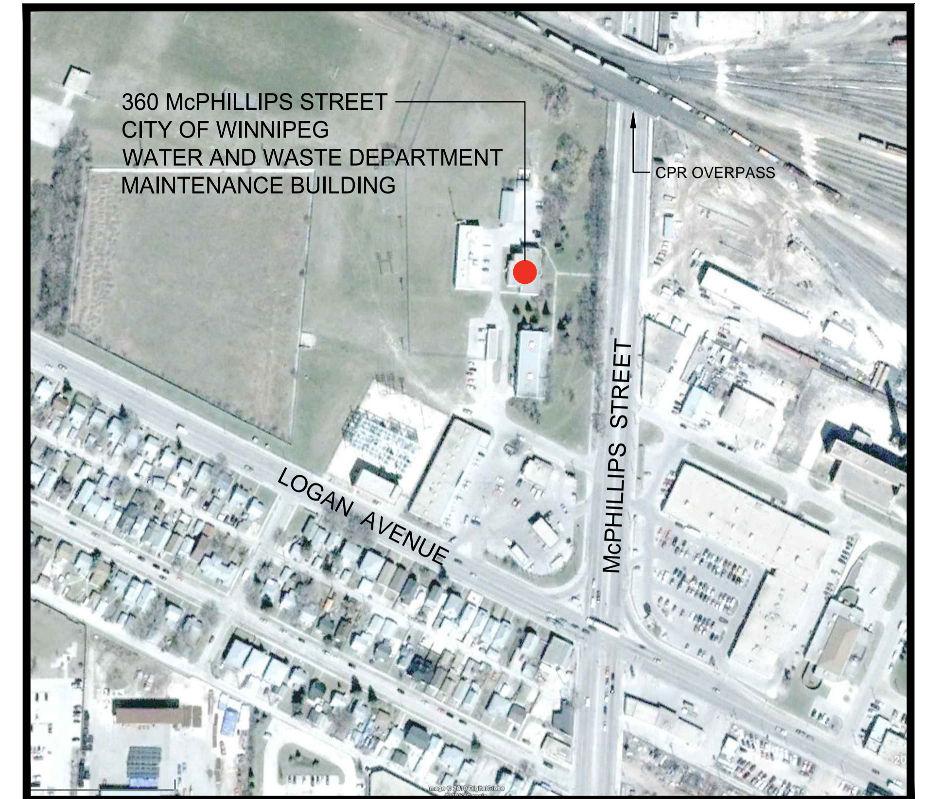
LOCATION PLAN N.T.S.