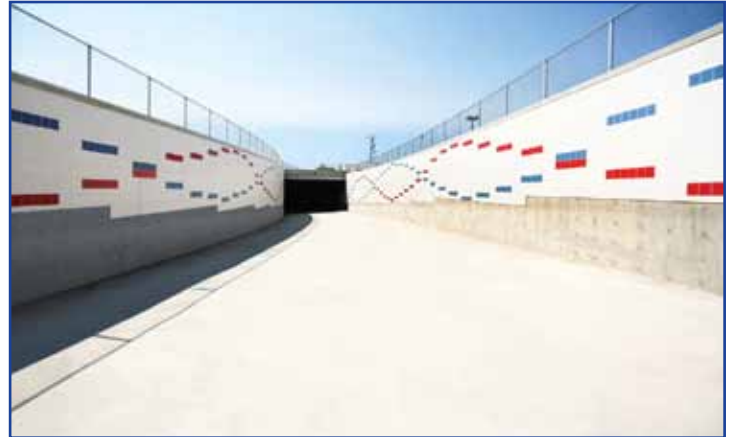
Transitway Tunnel under construction (looking south)