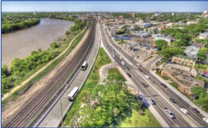
Aerial photo of new transitway alignment adjacent to Donald Street (looking southwest)