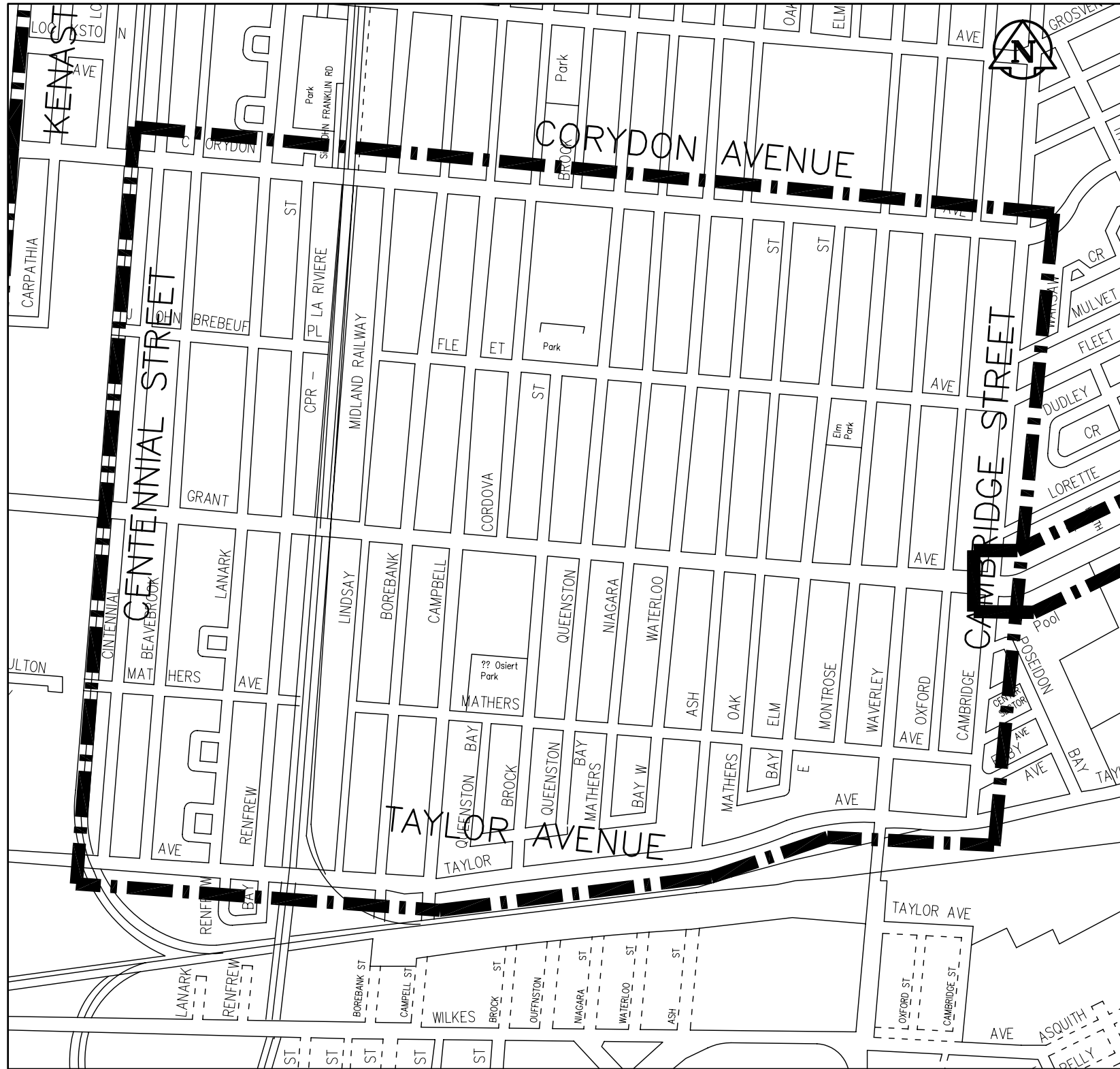
SOUTH AREA – AREA 1 CORYDON AVENUE TO TAYLOR AVENUE CENTENNIAL STREET TO CAMBRIDGE STREET