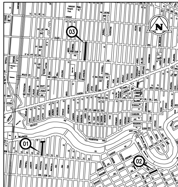
SITE LOCATIONS 01, 02 & 03