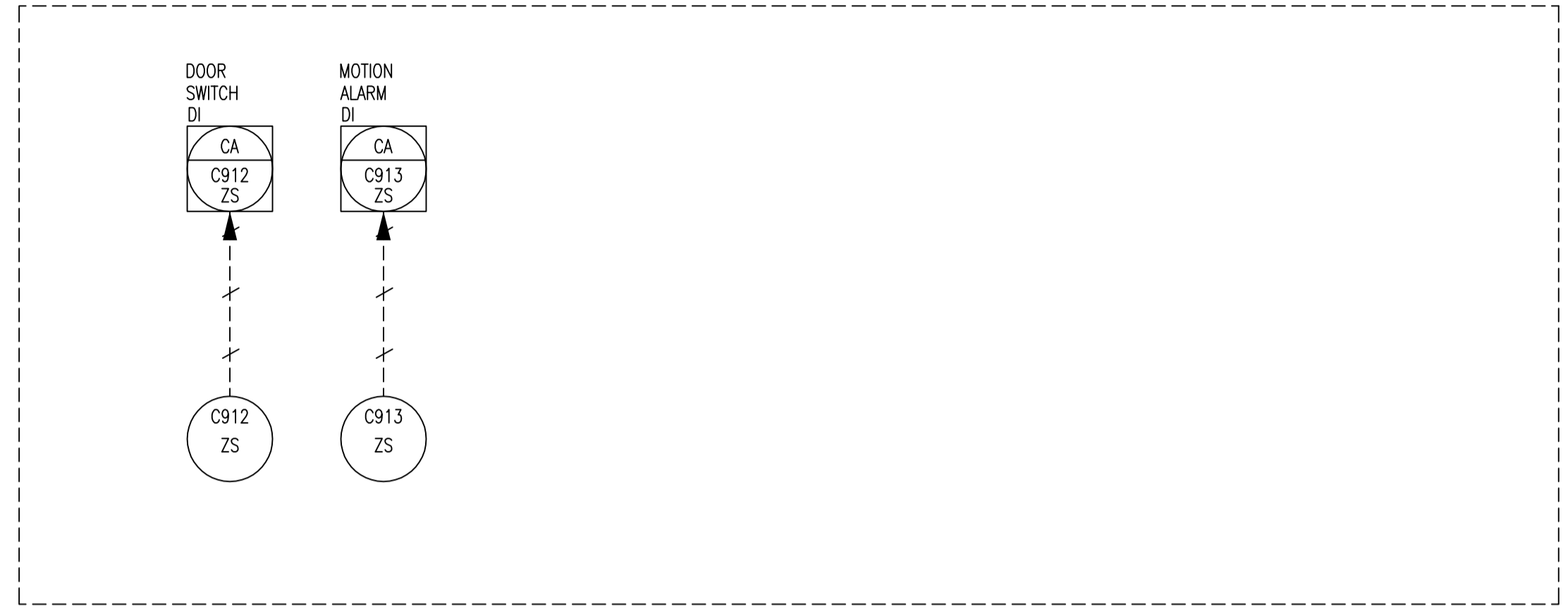
BLOWER BUILDING CONTROL ROOM