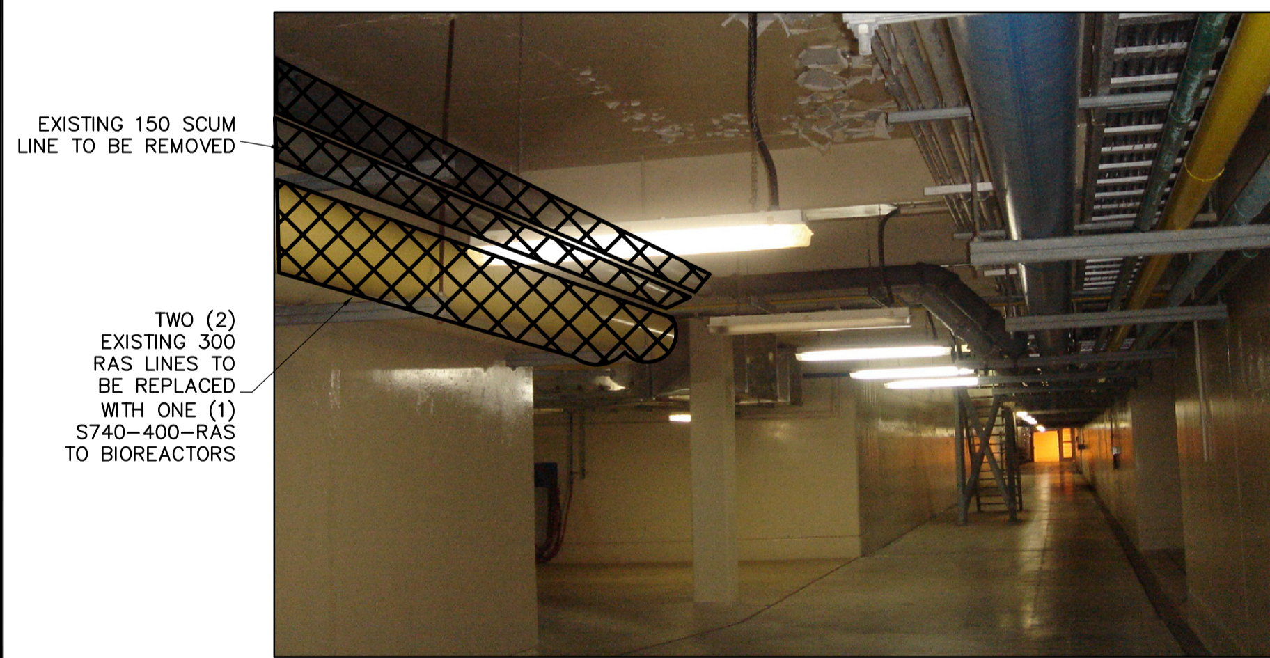
A FIGURE NTS