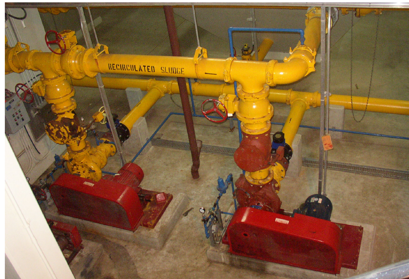
FIGURE - EXISTING SLUDGE TRANSFER PUMPS NTS