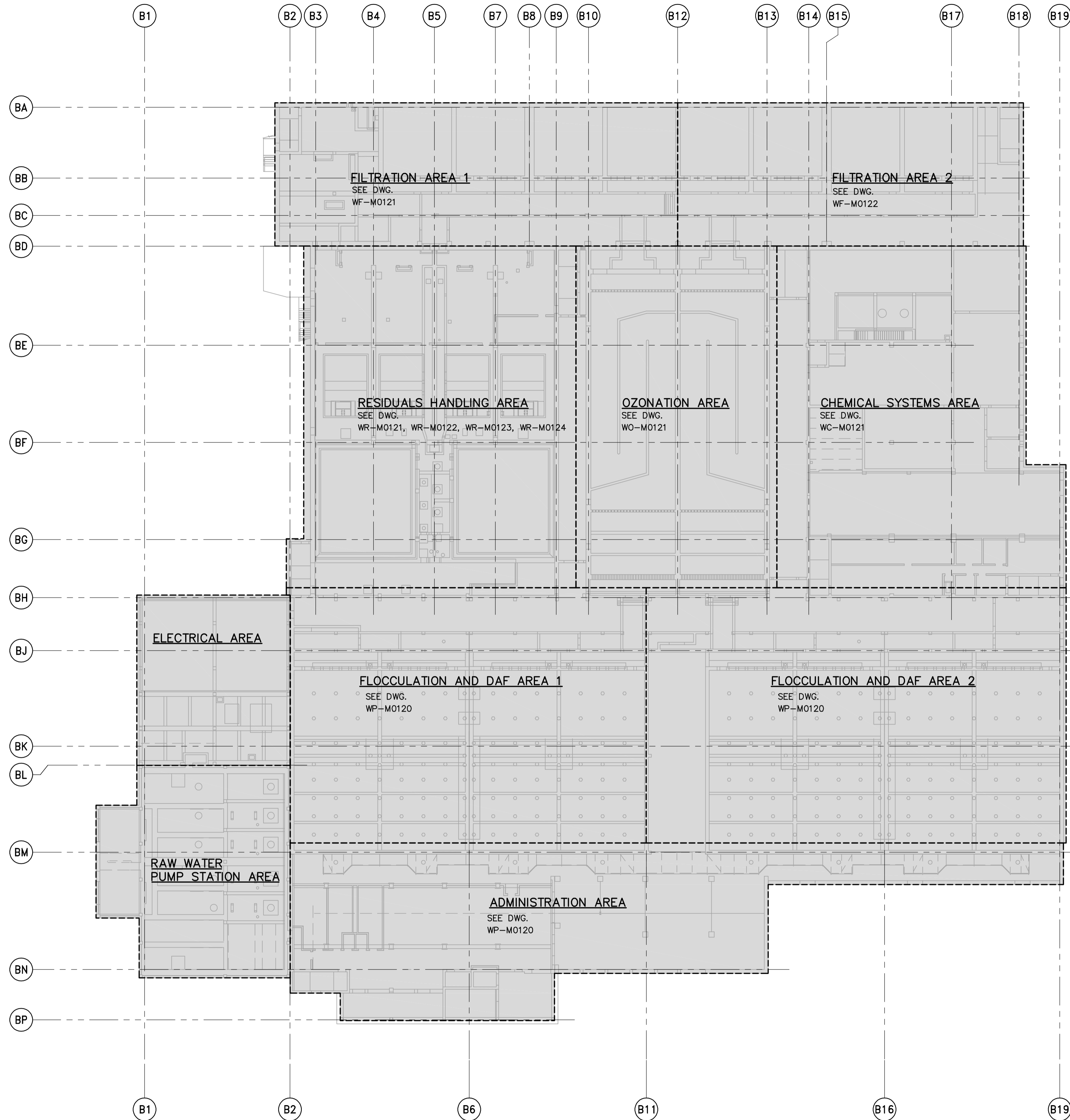
SECOND FLOOR KEY PLAN 1:300

--- LIMIT OF MECHANICAL AND ELECTRICAL CONTRACT 742-2005