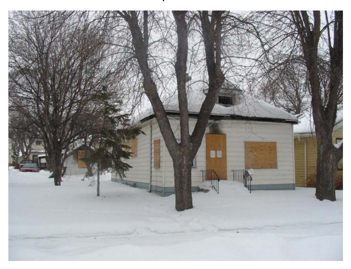
229 Semple Ave – Rear