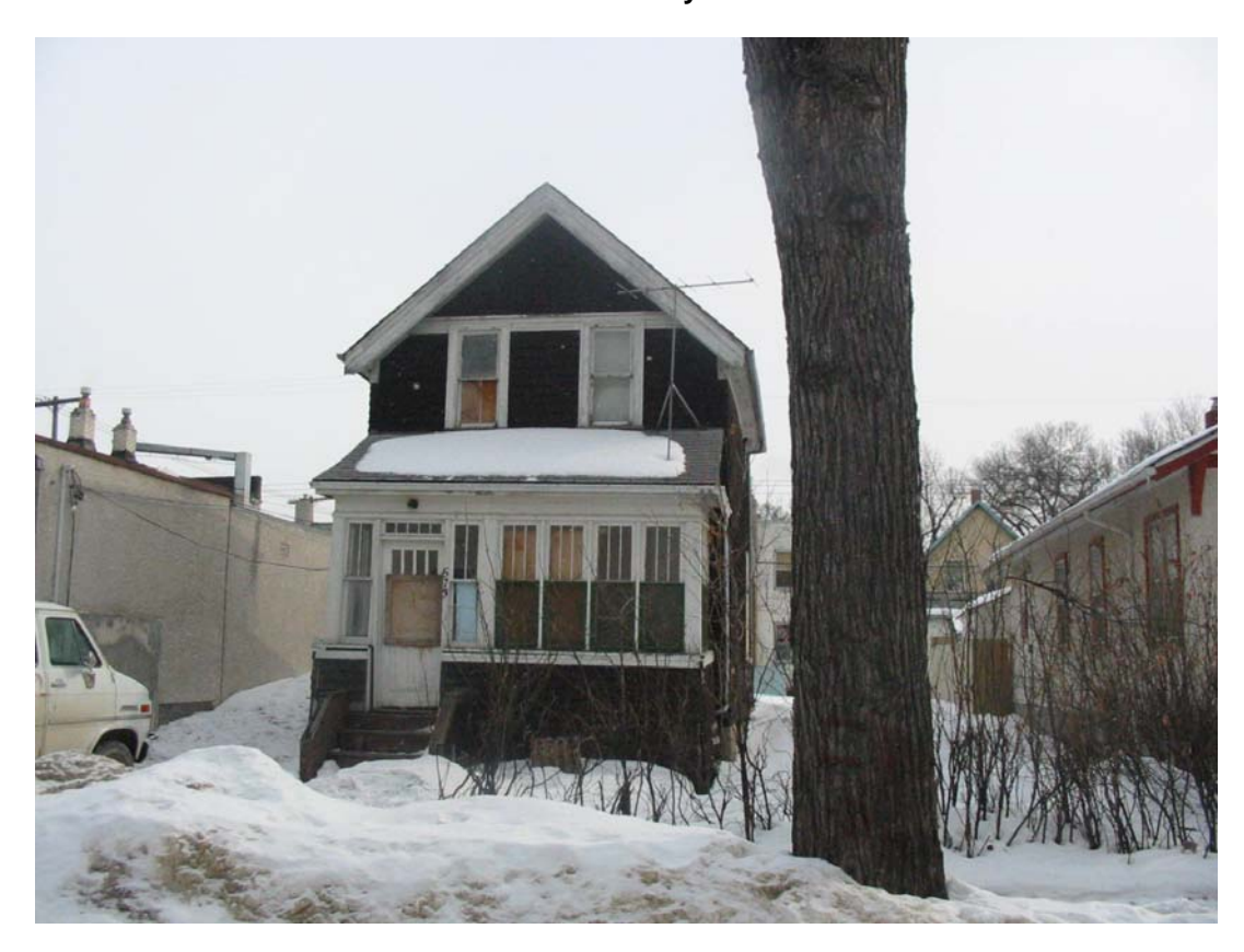
573 Beverley - Rear