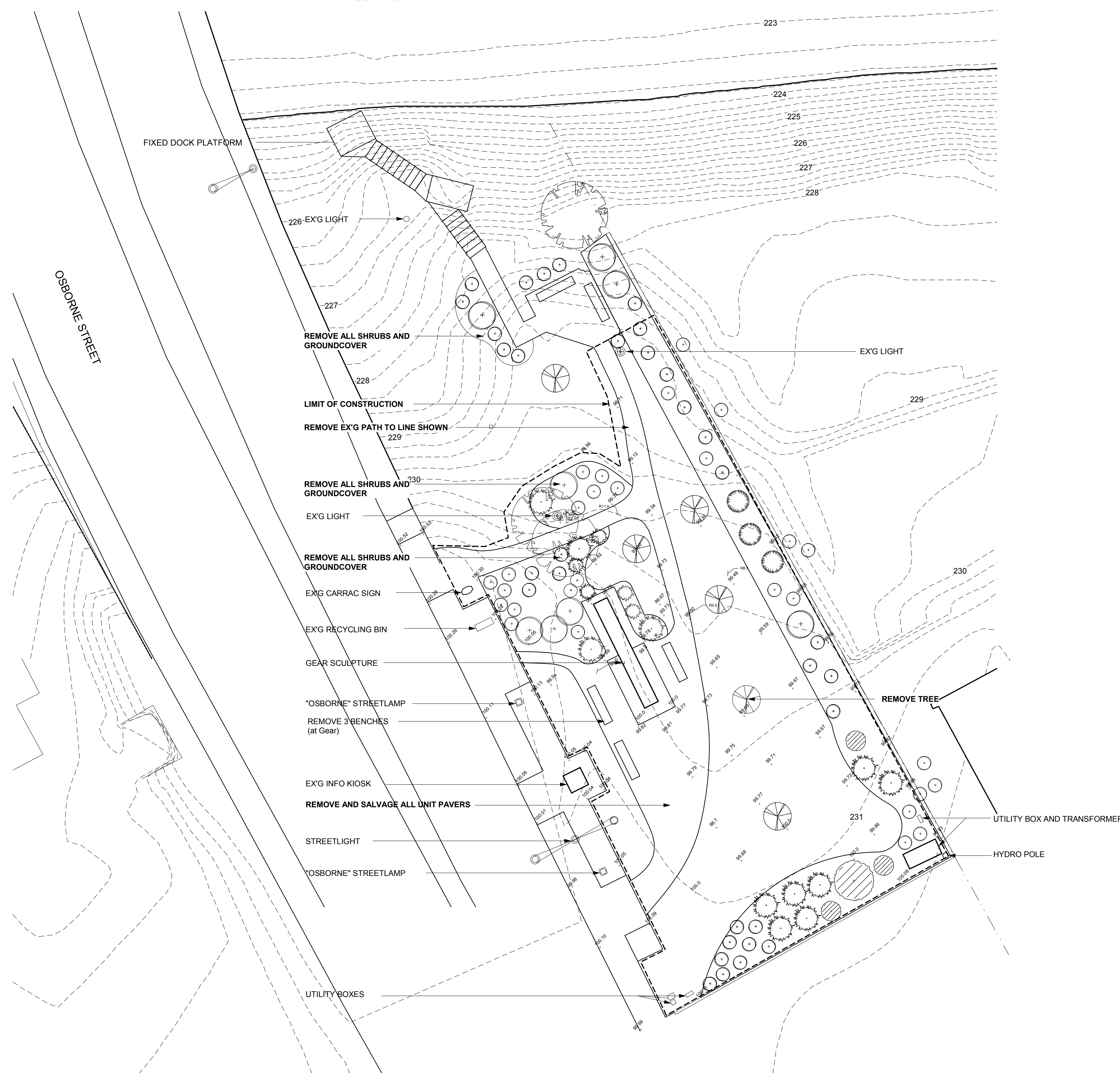
1 Existing Conditions, Salvage and Removal Plan L1 Scale: 1:200