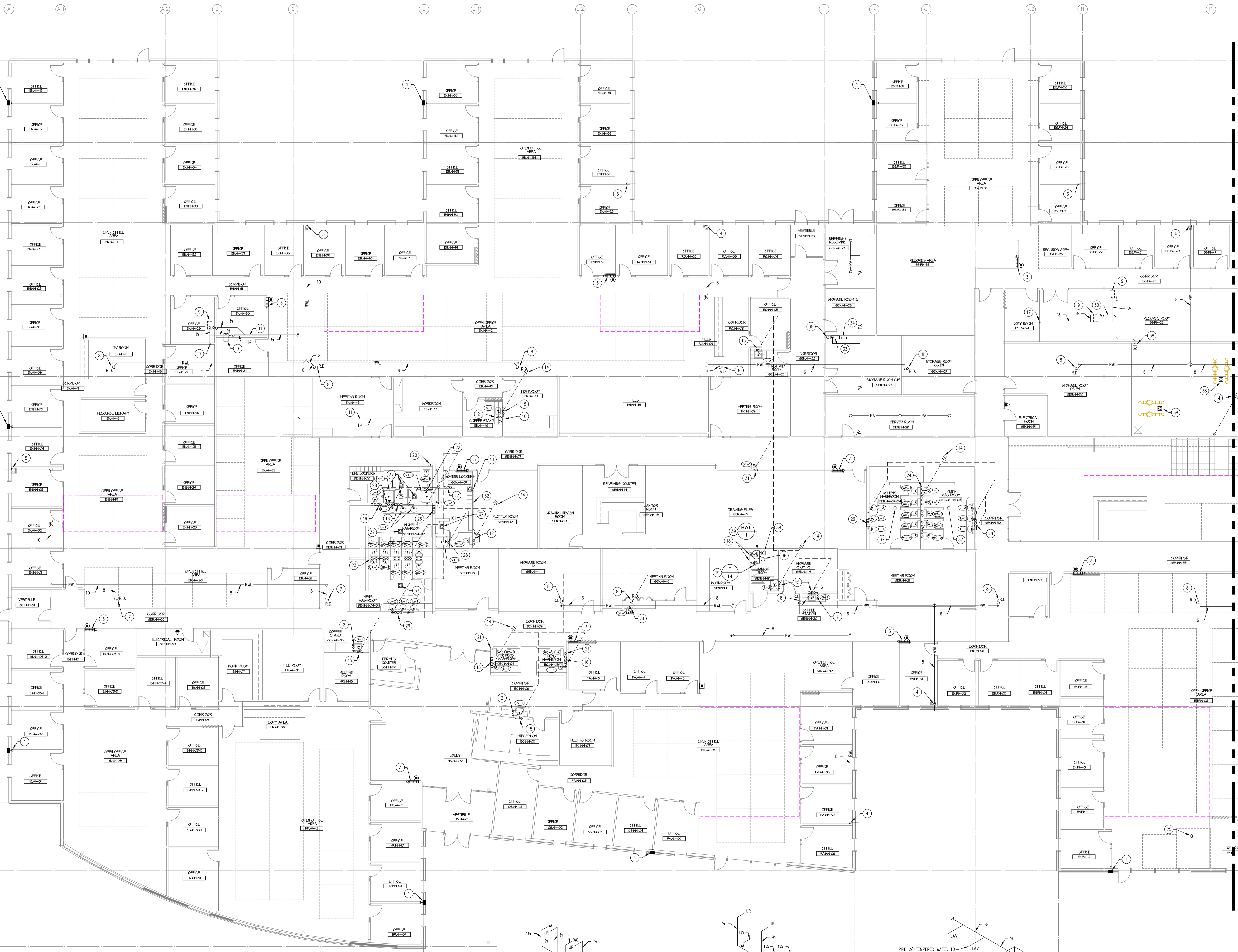
PART MAIN FLOOR PLAN SCALE 1/100

MAIN FLOOR PLAN - PART A PLUMBING AND FIRE PROTECTION M1.4