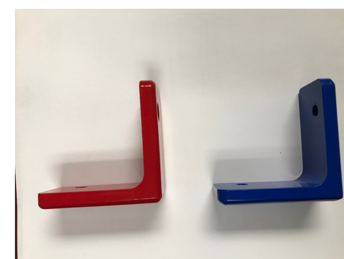
Skate Stops Typ.