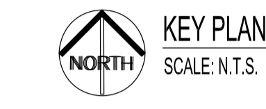
KEY PLAN SCALE: N.T.S.