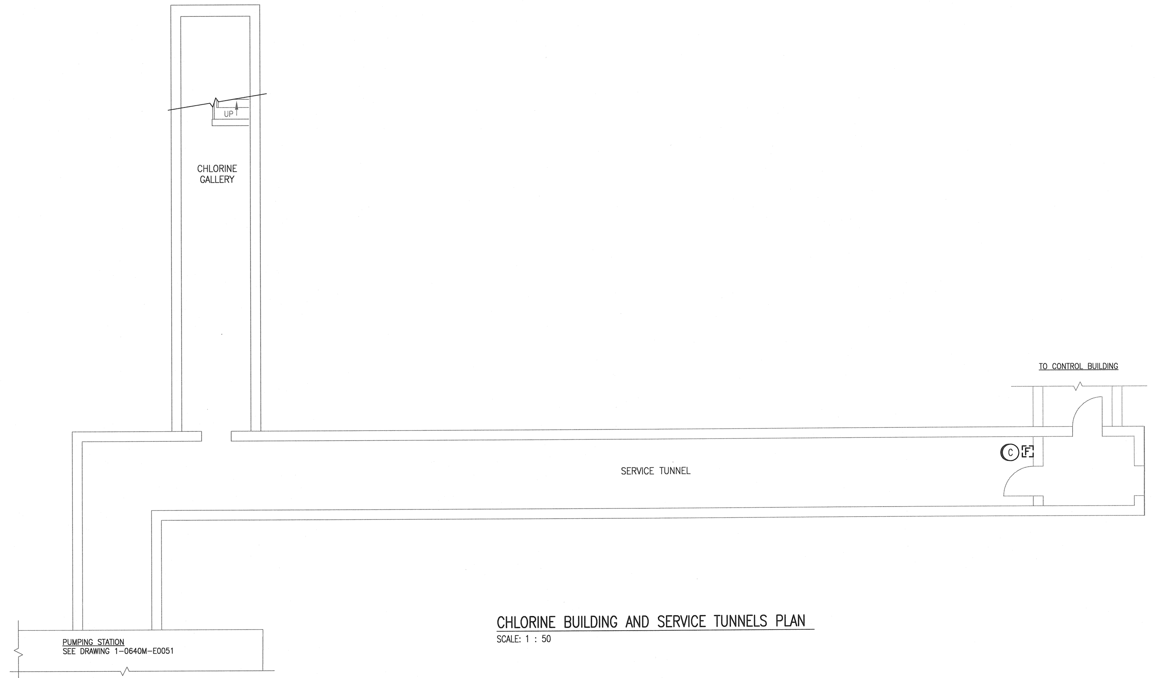
CHLORINE BUILDING AND SERVICE TUNNELS PLAN SCALE: 1 : 50