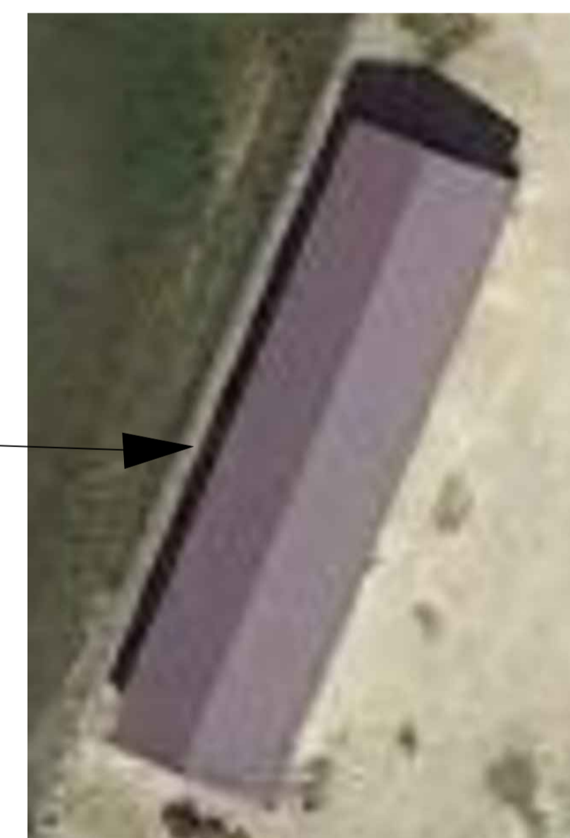
CIVIL MAINTENANCE/AQUEDUCT BUILDING