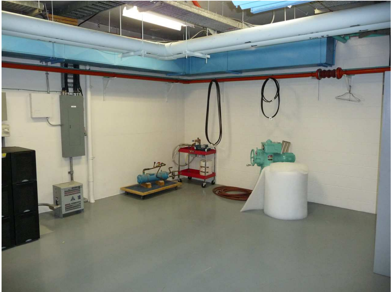
Existing Ductwork Below Electrical Room North-West Corner of Mezzanine Level