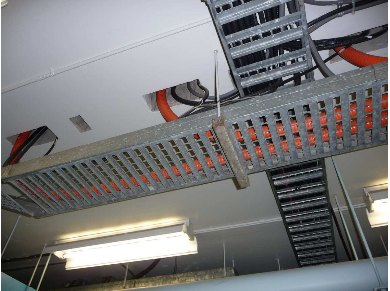
Cabling and Cable Tray Below 5kV Switchgear