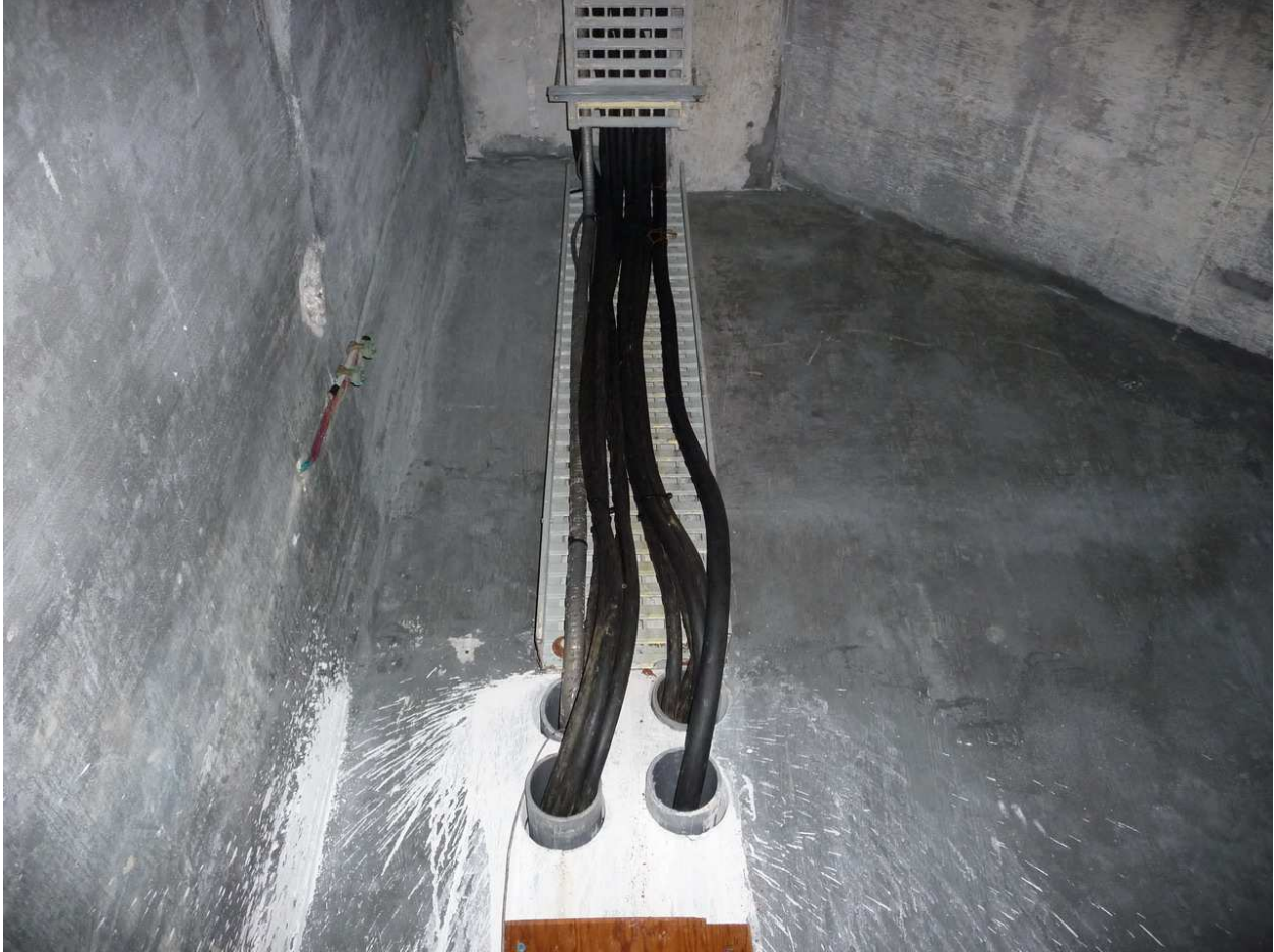
Reservoir Valve House – Incoming Feeder Cables