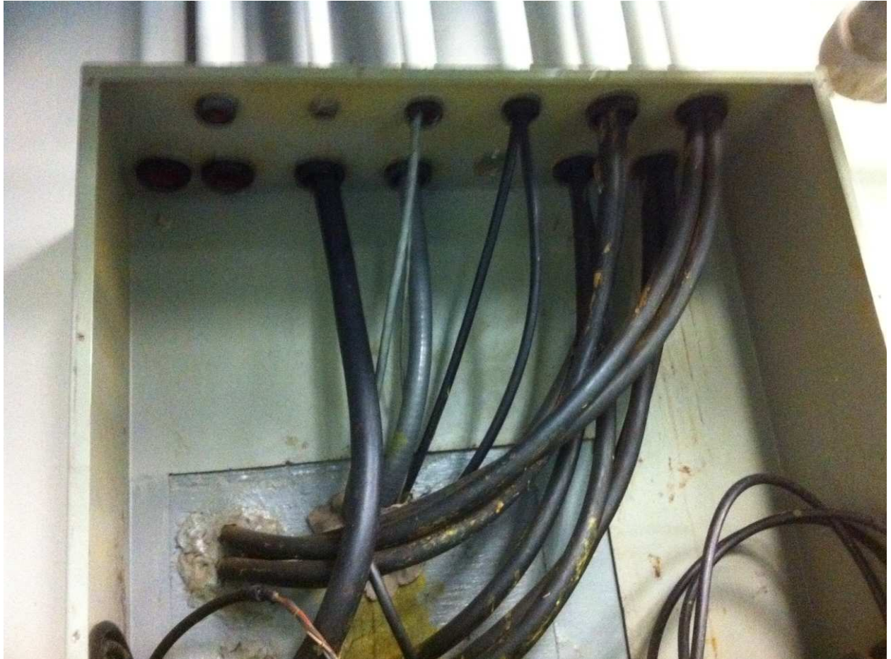
Reservoir Valve House Pullbox Located at south end of the pumping station on the Mezzanine Level