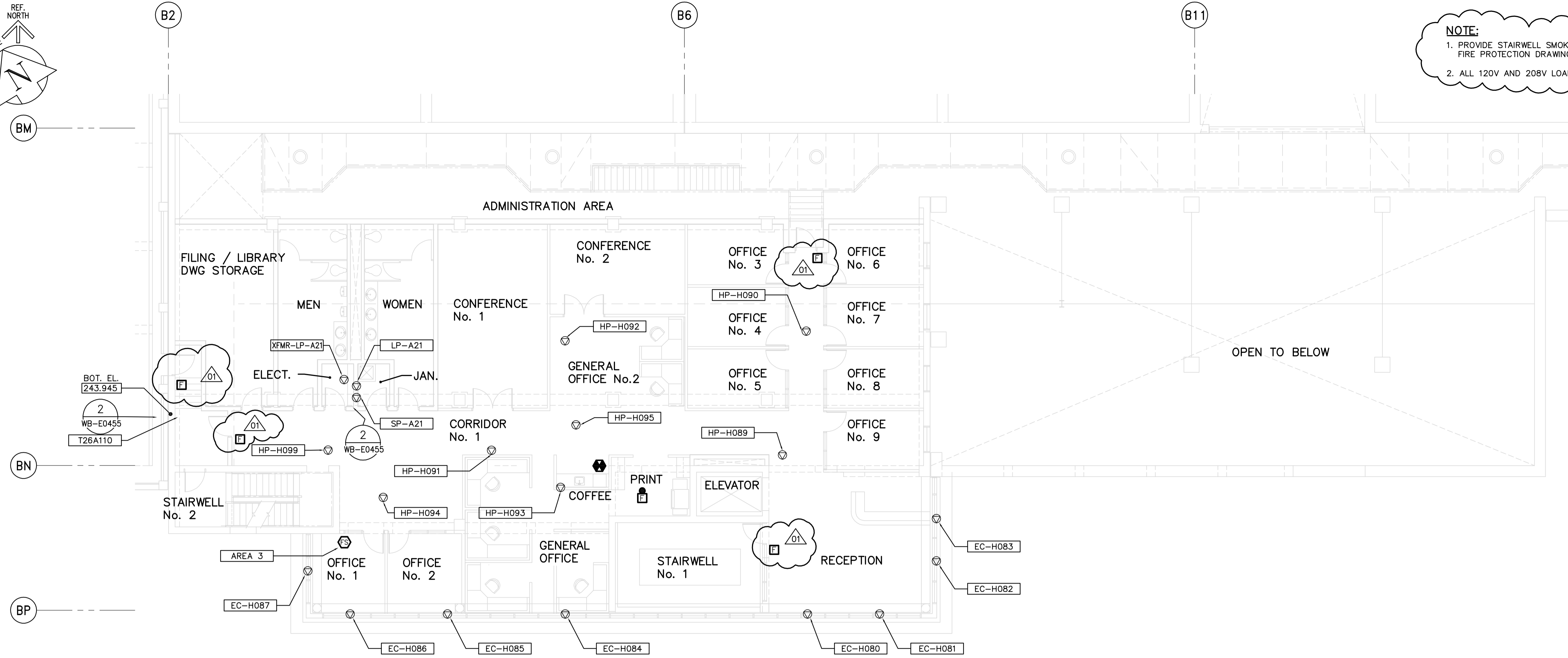
SECOND FLOOR FACILITY PLAN 1:100

NOTE: 1. PROVIDE STAIRWELL SMOKE DETECTORS AS SHOWN ON FIRE PROTECTION DRAWINGS. 2. ALL 120V AND 208V LOADS ARE FED FROM LP-A11