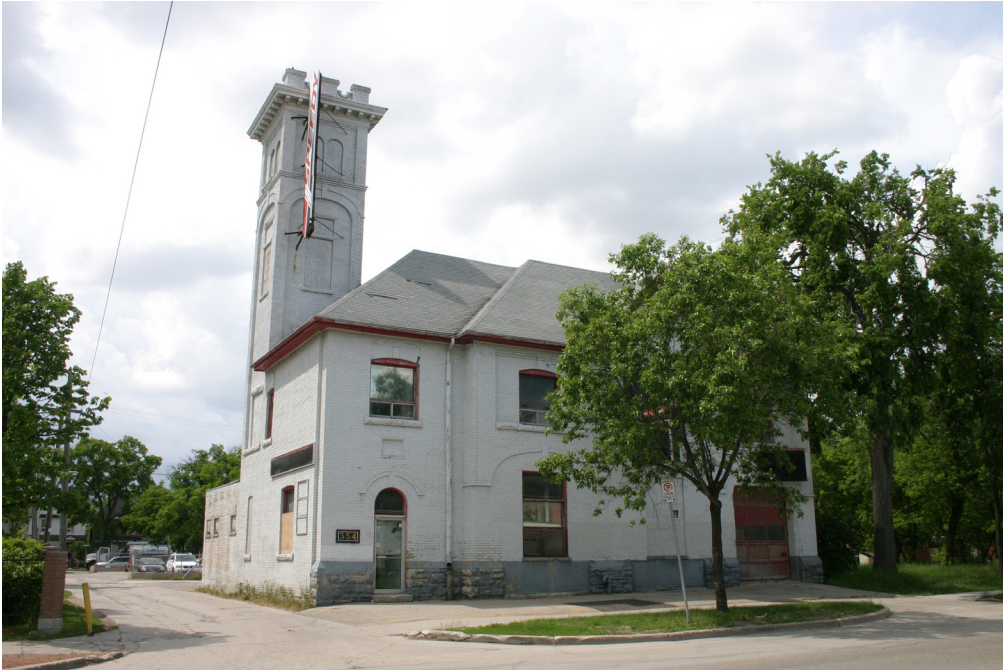
354 Sherbrook Street

Did not meet designation criteria, removed from Historical Buildings Inventory Demolished