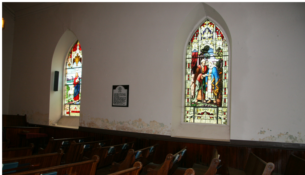
Part of the church's interior

Kildonan Presbyterian Church, 201 John Black Avenue— Staff have continued to be involved with redevelopment plans for this structure. Built in 1852-1853, it stands as the oldest stone church in Winnipeg. The building has been underutilized for some time and is now deteriorating. In 2011 a “Friends of Historic Kildonan Church” group formed, and began working towards both short and long-term goals. The group hopes to address urgent condition issues in the summer of 2012 including installing a new roof and patching various areas of the walls. In the long run, larger condition issues must be faced, as well as finding a viable new use for the structure.