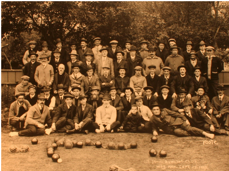
A group of 1918 Winnipeg lawn bowlers from the St. John's Club.