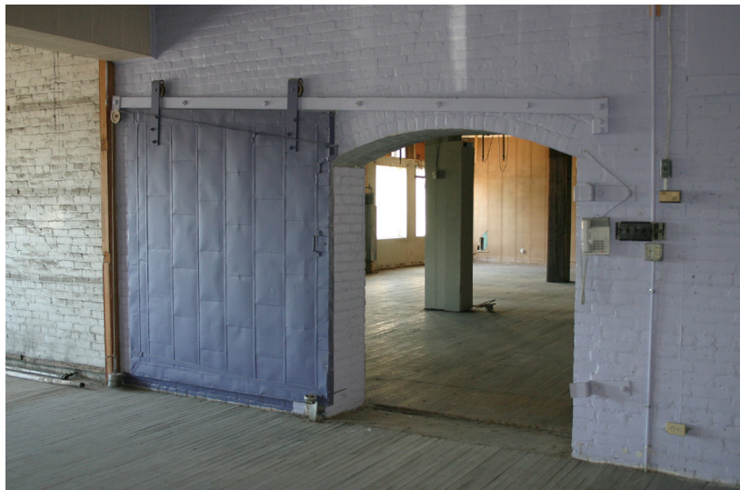
111 Lombard Avenue, original metal fire door

The structure was designed by well-known local architect James H. Cadham and was used by the Kemp Company and its various amalgamations until the 1950s. Bricks Limited, a local retail furniture store, occupied the building from the 1970s well into the 2000s.