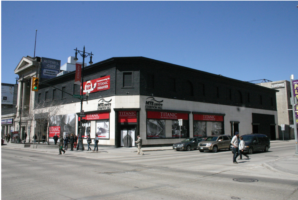
311 Portage Avenue

For history, see The Year Past, 1997-2000