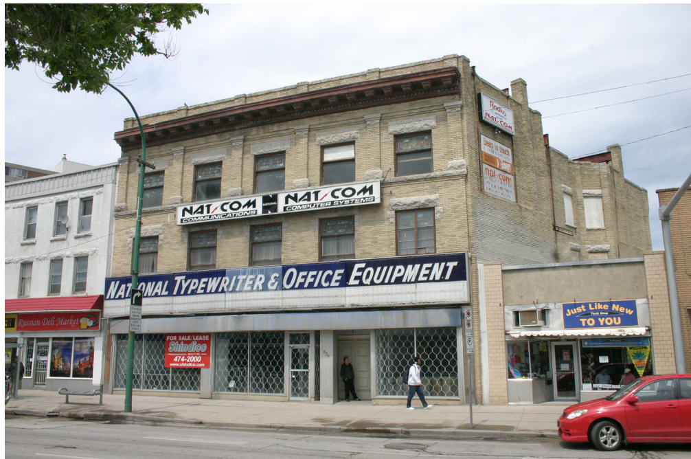
639 Portage Avenue