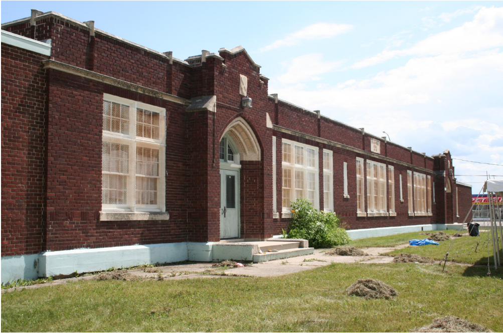
15 Chester Street

For history, see The Year Past, 1994-1996