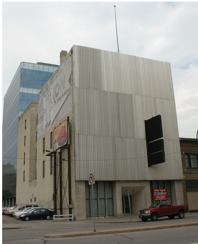
The Scott Block as it looked prior to the recent renovations

A fixture on south Main Street, the company's modern new headquarters, located on Main Street just south of Graham Avenue, was completed in 1904, the building touted as Canada's largest exclusively furniture structure. But a lightning strike in 1905 completely destroyed the rear and side walls of the building. Quickly rebuilt, the structure suffered a second devastating fire, in 1914, which destroyed the rear wall and all the contents of the building. The original 1904 building was rebuilt in 1915, although an internal concrete frame was built as support.