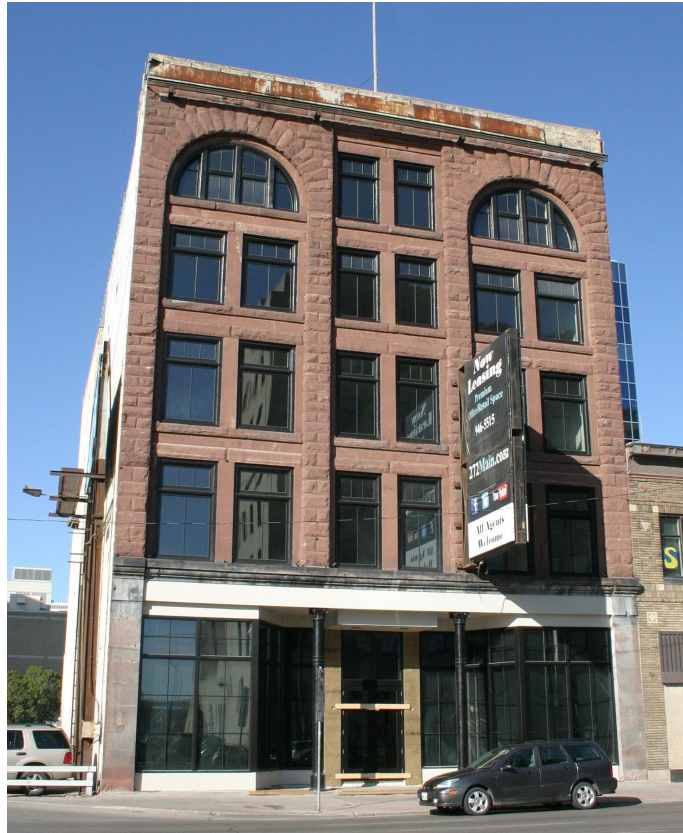
272 Main Street after the 2011 work to remove the metal cladding and rebuild the ground floor entrance