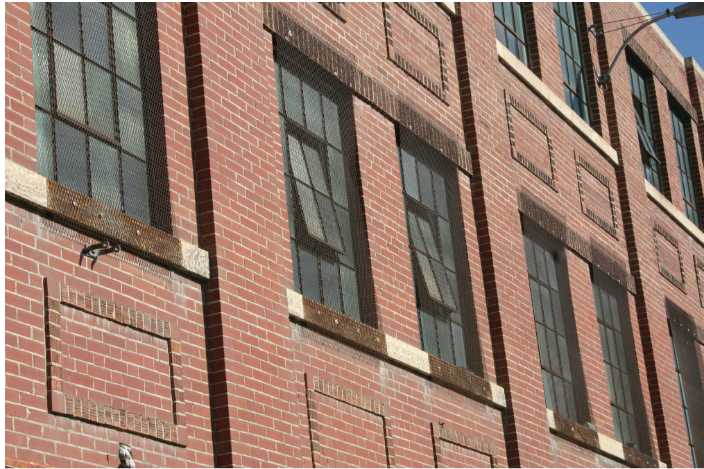
765 Main Street, detail

This structure was built in 1924 as Postal Station “A” – an important modern addition to the Canadian Pacific Railway (CPR)’s national mail delivery system that had grown from its infancy in the 1860s. The system included: central mail depots in major centres to regionally sort mail and forward bags onto the correct trains; travelling post offices – rail cars with mail sorters to sort bags of mail en route; and catch posts at stations all across Canada to receive bags of sorted mail from moving trains.