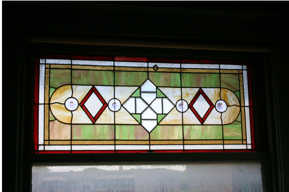
One of the panes of leaded glass on the building's south façade