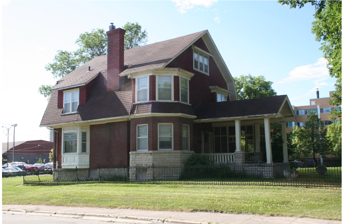
51 Balmoral Street

For history, see The Year Past, 1992-1993