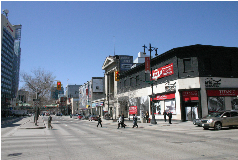
North side of Portage Avenue, west of Donald Street where construction on a hotel/office/retail complex will begin in 2012

ing code-compliant washrooms, elevators, kitchens and mechanical equipment. This addition will also mean that very little of the theatre itself will need to be altered to accommodate such services. A clean-up of the theatre façade occurred a few years back, including cleaning of the masonry, new windows and rehabilitation of the canopy, so this phase of the work will focus on restoring the theatre's interior. Plaster throughout will be repaired and repainted, and the lobby will be restored to the original look. The stage and loggia will remain in place; however the auditorium seating will be replaced with tables to accommodate patrons. Canad Inns is hoping to have the Met open in October 2012. The Committee continues to meet with the owners to discuss interior restoration, and has recently visited the site to review progress.