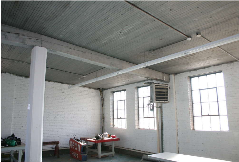
765 Main Street, part of the third floor ceiling

The railway mail service ended in Canada in the early 1970s due to competition from airplanes and trucks, this building was used by several commercial tenants, including prints and a caterer. It is now being converted into office space for local community-based organizations.