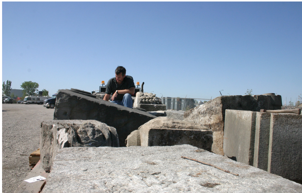
Identifying shards on the trailer at the St. Boniface Industrial site

Work was carried out over the fall of 2011 in response to amendments to the City of Winnipeg's Charter, calling for the inclusion of designation information on Certificates of Title at the Winnipeg Land Titles Office. "Historic Property Notices" were created for every building on the Conservation List, signed by the City's Clerks Department and then files at the Land Titles Office. The project was nearing completion at the end of 2011.