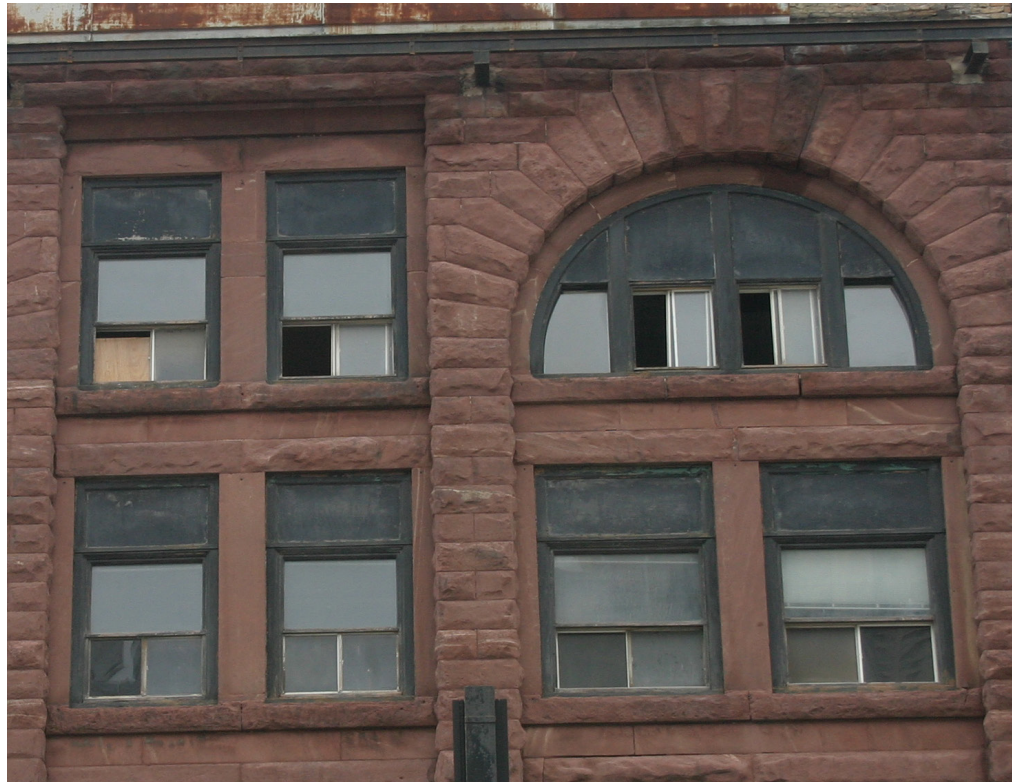
Part of the front façade of the Scott Block

The main (east) façade faces Main Street and included a recessed ground floor entrance and upper storeys clad in cut red (Port Wayne) sandstone. Arches graced the outer banks of windows framing the square headed central section and the building was completed with a modest metal cornice and flagpole. Over time, alterations to the main façade severely altered this original design. The original entrance was reworked, with limestone cladding used and sometime in the 1960s or 1970s, a new metal cladding was attached to the front, hiding the original exterior from view.