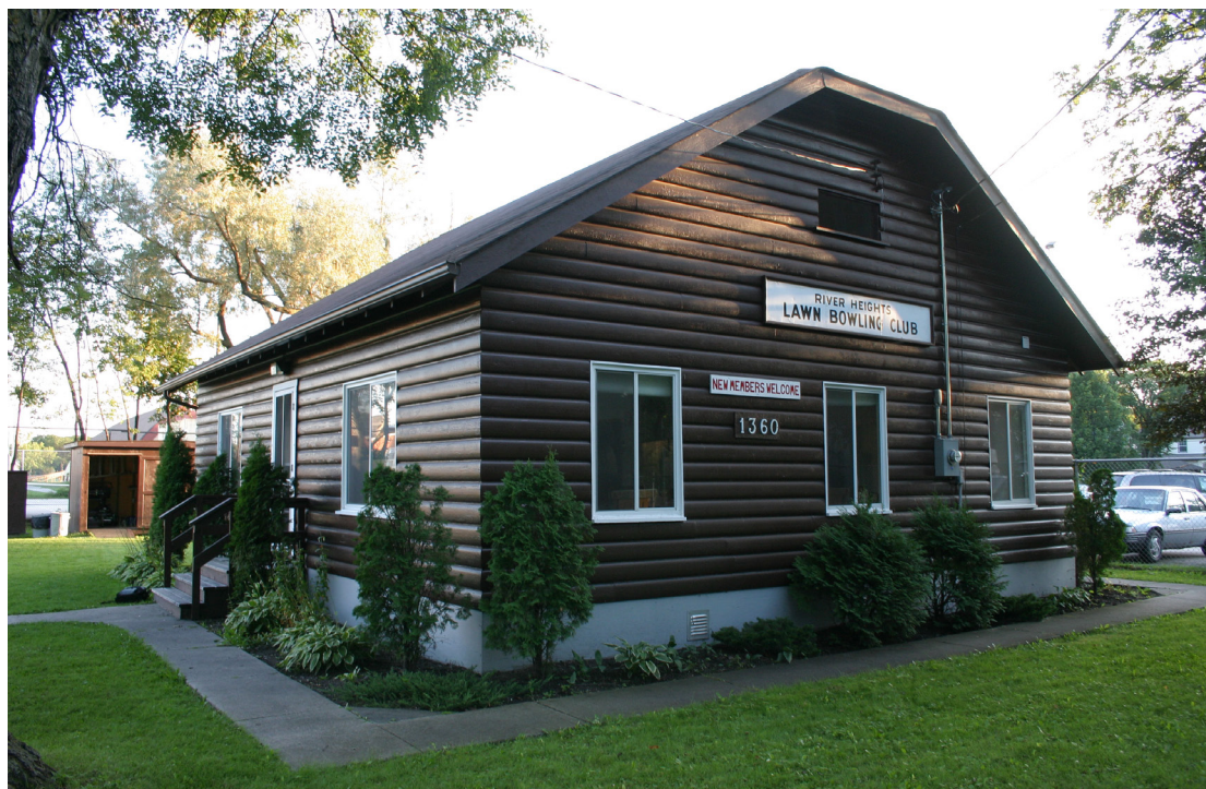
River Heights Lawn Bowling Club Clubhouse

Lawn bowling was an extremely popular sport in Winnipeg beginning in the late 1800s and growing rapidly in the pre-World War I era. Clubs were established throughout the City, including St. John's, Greenwood, Riverview and West End, and thousands of Winnipeggers enjoyed the sport. In 1908, the Manitoba Lawn Bowling Association was formed to oversee the growth of the sport and run provincial championships. By the time the River Heights Club was organized in the early 1930s, there were an estimated 23 clubs operating in the City of Winnipeg and approximately that many more throughout the province. The River Heights Club grew rapidly, with an annual membership of over 150 in the 1960s. Although membership has declined since then, it is still one of Winnipeg's seven active outdoor lawn bowling facilities.