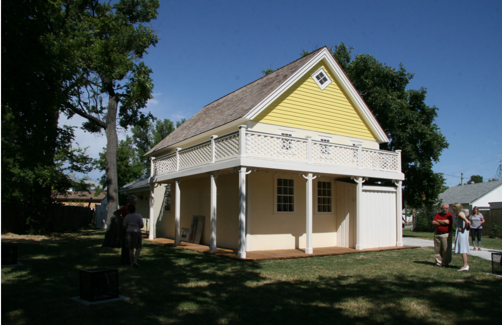
The rehabilitated Barber House on its grand opening

Beyond evaluating buildings and reviewing proposed alterations the Historical Buildings Committee was involved in a number of other initiatives in 2011.