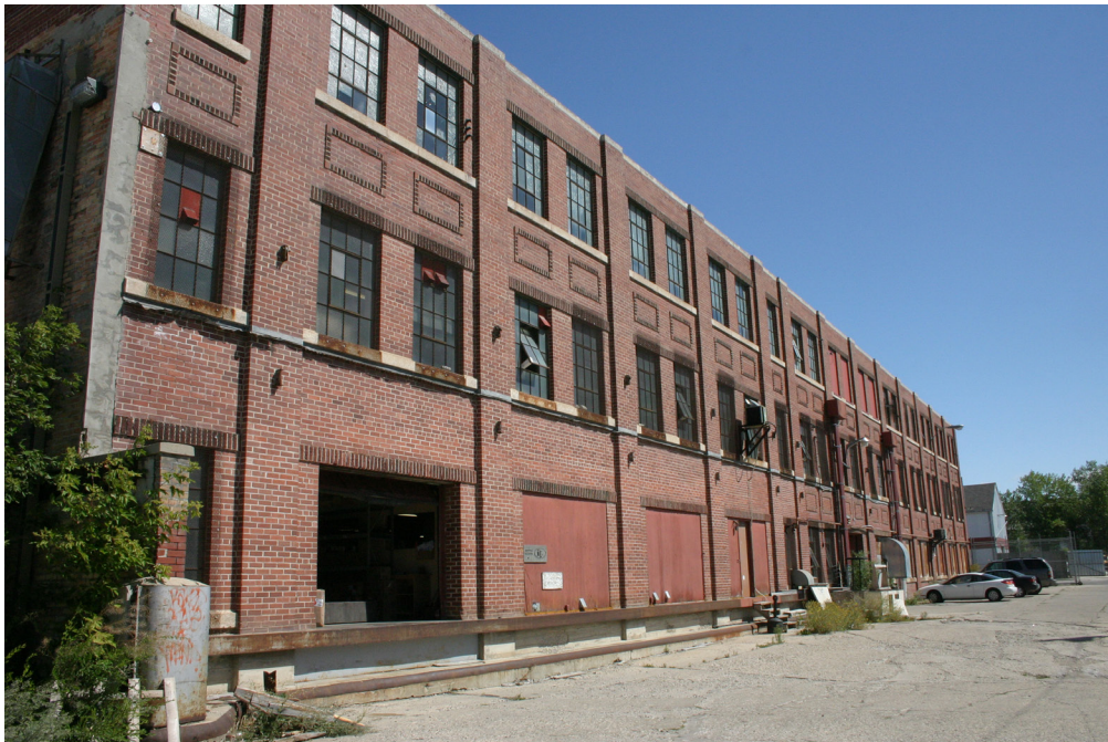
765 Main Street, south side