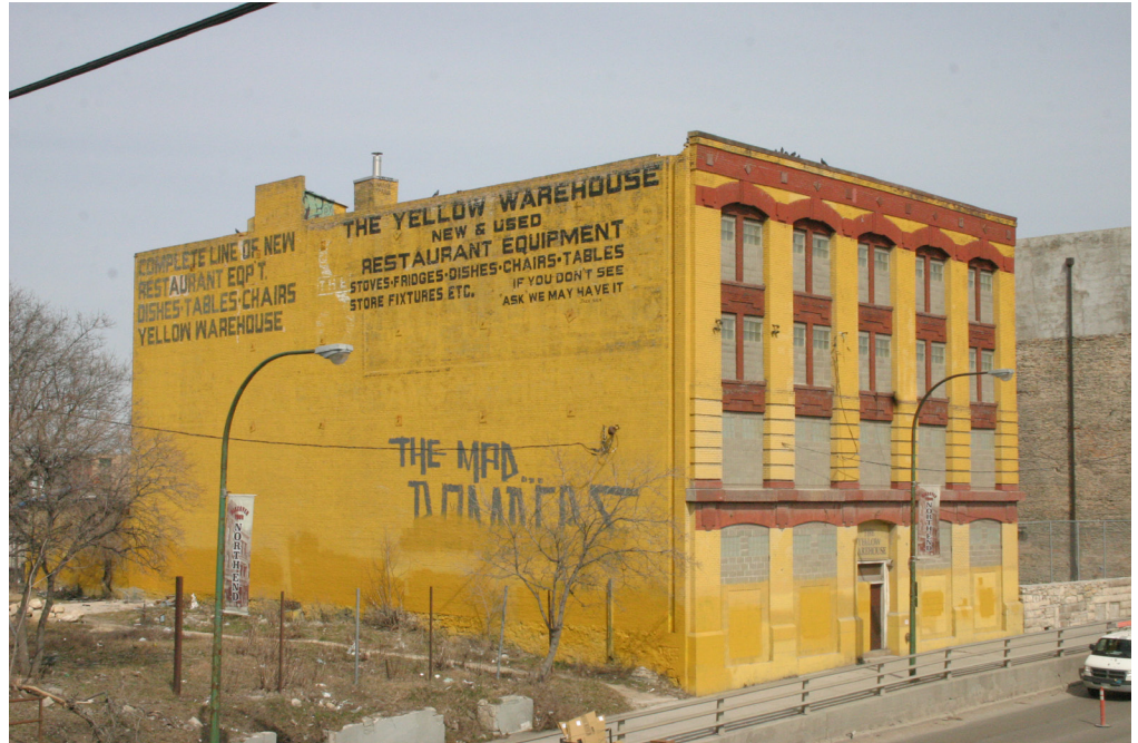
764 Main Street

Did not meet designation criteria, removed from Historical Buildings Inventory Demolished