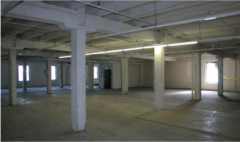
111 Lombard Avenue, 3rd floor warehouse space

ornamentation and use of arched openings makes it an excellent example of the Romanesque Revival style, very popular in warehouse districts throughout North America in the late 1800s and for several decades in the early 20th century. This large structure was built in stages between 1903 and 1911, much of it using the mill style of construction – solid brick walls attached to an internal framework of heavy squared timber beams and posts with heavy wood plank sub-flooring.