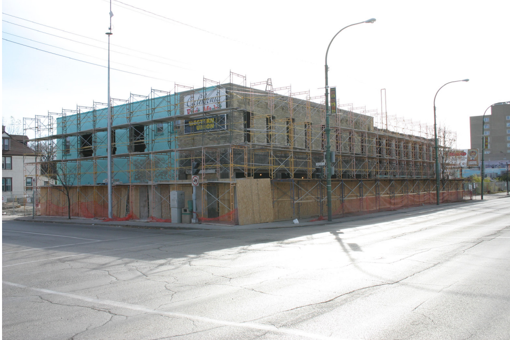
865-879 Main Street