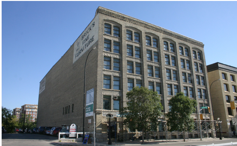
111 Lombard Avenue

This large brick and stone warehouse was built in 1903 for metal goods manufacturer Kemp Manufacturing Company. Its bulky appearance, rough texture, modest