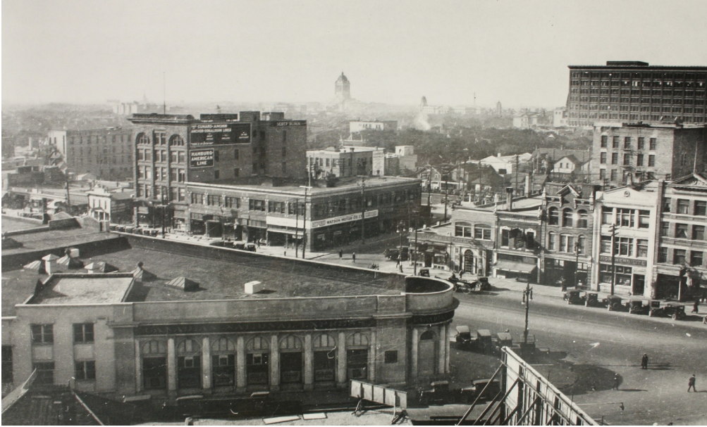
South Main Street, ca.1938. The Scott Block is prominent in the upper left of the picture

A fixture on south Main Street, the company's modern new headquarters, located on Main Street just south of Graham Avenue, was completed in 1904, the building touted as Canada's largest exclusively furniture structure. But a lightning strike in 1905 completely destroyed the rear and side walls of the building. Quickly rebuilt, the structure suffered a second devastating fire, in 1914, which destroyed the rear wall and all the contents of the building. The original 1904 building was rebuilt in 1915, although an internal concrete frame was built as support.