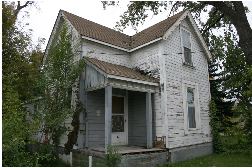
74 Higgins Avenue