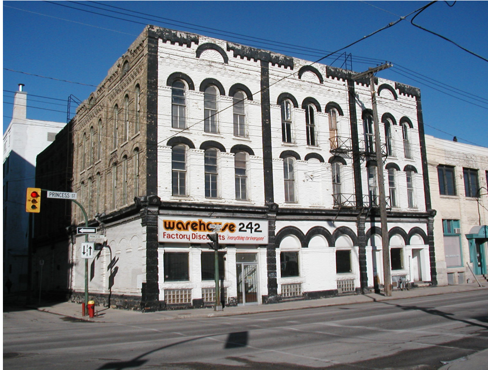
242 Princess Street