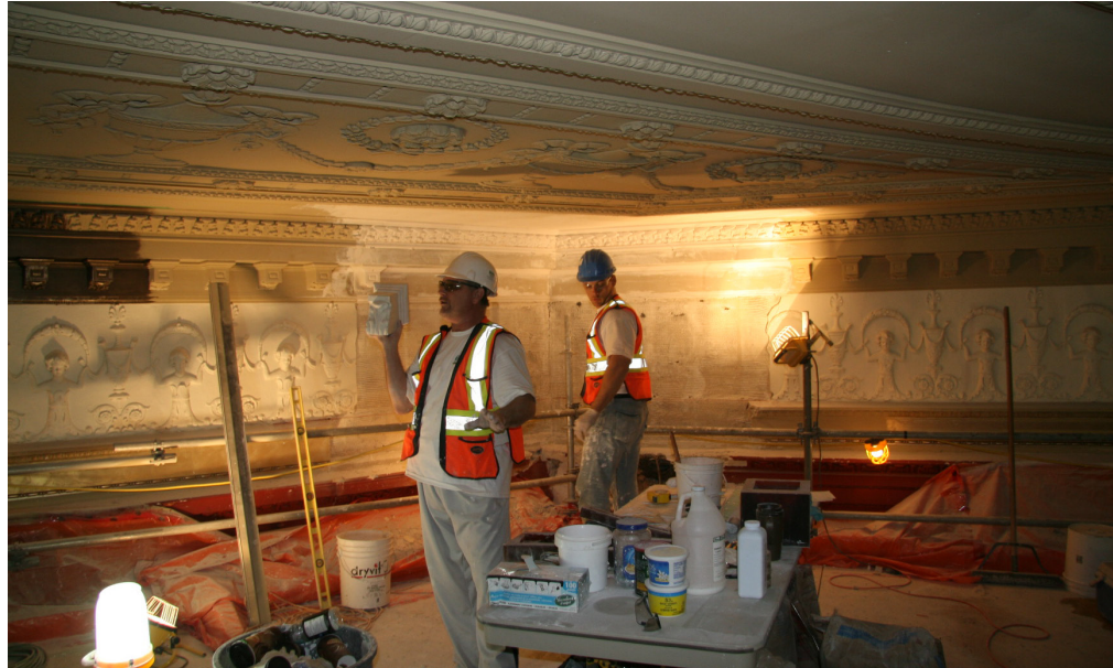
Painting of the original ornamental plasterwork

During a busy 2011, the HBC provided design review and input on a number of important heritage projects throughout the City (all refer to Appendix A). The highlights include: