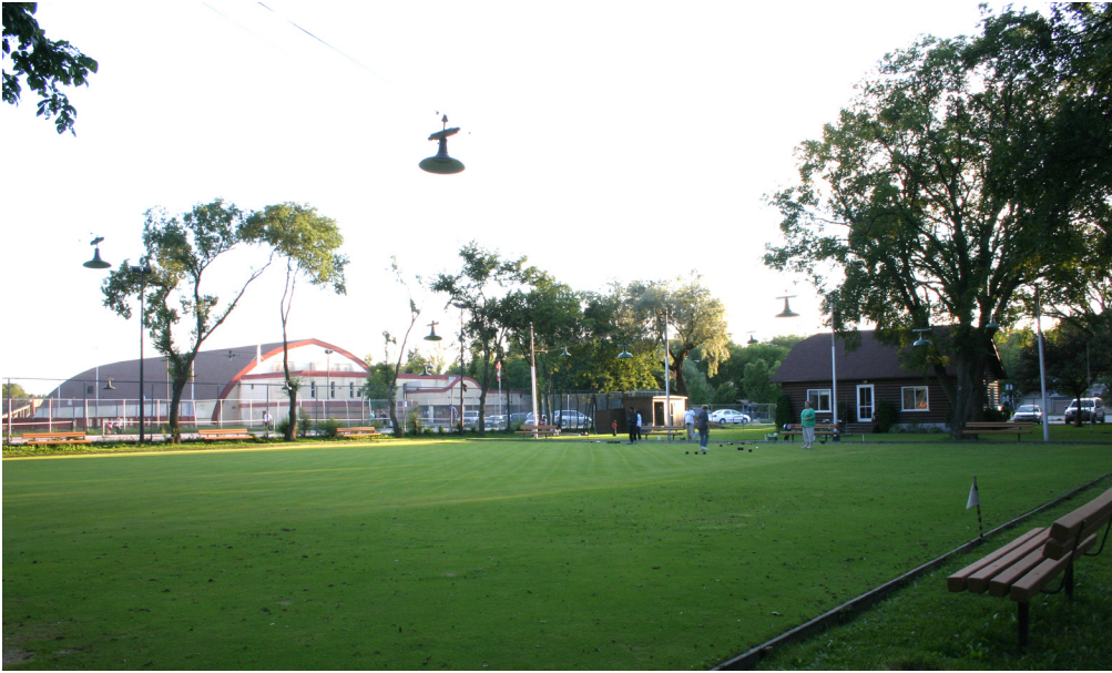
Clubhouse and greens

as has some of the wood panelling and light fixtures, although upgrades have occurred. It stands as the oldest, most intact lawn bowling clubhouse in the City of Winnipeg and is an integral part of the sports/education complex located in the middle of River Heights.