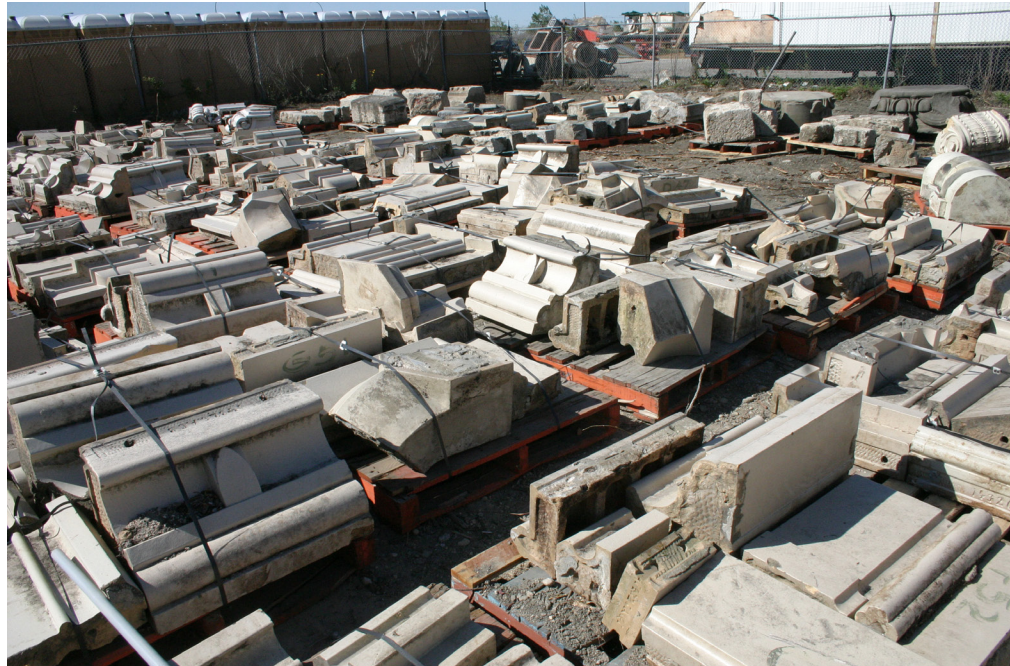
Part of the shard collection at the St. Boniface Industrial site

Work was carried out over the fall of 2011 in response to amendments to the City of Winnipeg's Charter, calling for the inclusion of designation information on Certificates of Title at the Winnipeg Land Titles Office. "Historic Property Notices" were created for every building on the Conservation List, signed by the City's Clerks Department and then files at the Land Titles Office. The project was nearing completion at the end of 2011.