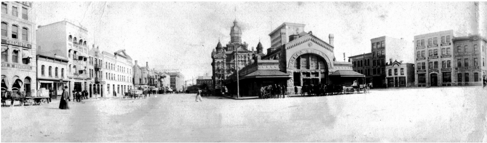
This undated image shows a bustling warehouse district with Winnipeg's City Hall and Market Building in the centre of the picture

Information on the Historical Buildings Committee, its policies and procedures, incentive programs, publications, back issues of The Year Past , the Heritage Conservation List and individual building histories (in PDF format) can be found at the website listed below.