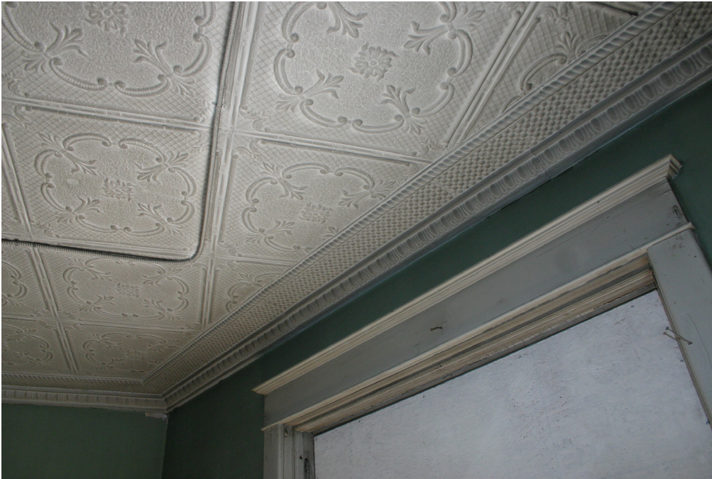
Ornamental tin ceiling in one of Monte Cassino Court's upper floor suites

The Monte Cassino Court was built as a mixed use retail/residential block in 1910, taking advantage of the growth of the City's population, the growth of Portage Avenue as one of its premier thoroughfares, the popularity of apartment dwelling in Winnipeg and the demand for modern commercial and residential space.