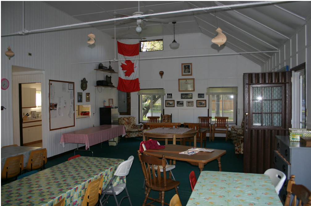
Interior of the clubhouse

as has some of the wood panelling and light fixtures, although upgrades have occurred. It stands as the oldest, most intact lawn bowling clubhouse in the City of Winnipeg and is an integral part of the sports/education complex located in the middle of River Heights.