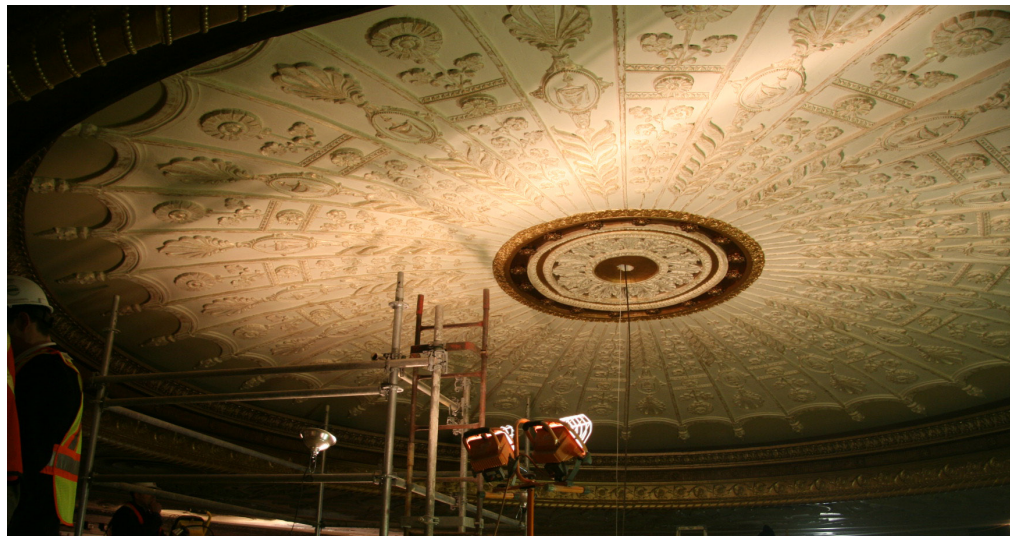
Part of the ceiling of the theatre being restored

The Committee reviewed plans to construct an addition on the south side of the building that would hold all the modern services required to run the facility, includ-