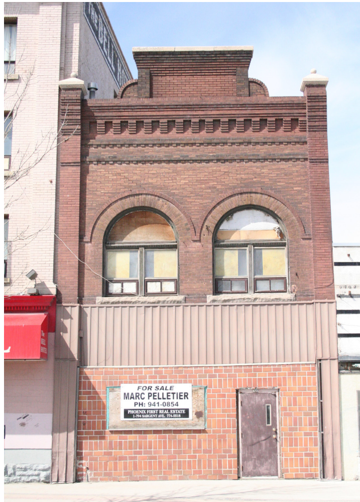
666 Main Street