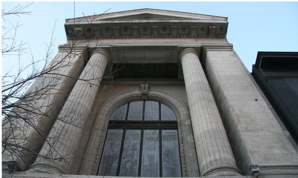
Main façade, 315 Portage Avenue

Four buildings had their heritage status confirmed.