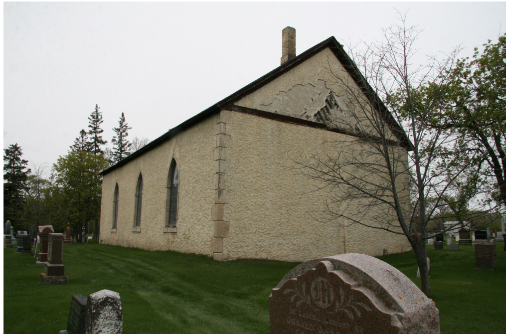
Kildonan Presbyterian Church

Kildonan Presbyterian Church, 201 John Black Avenue— Staff have continued to be involved with redevelopment plans for this structure. Built in 1852-1853, it stands as the oldest stone church in Winnipeg. The building has been underutilized for some time and is now deteriorating. In 2011 a “Friends of Historic Kildonan Church” group formed, and began working towards both short and long-term goals. The group hopes to address urgent condition issues in the summer of 2012 including installing a new roof and patching various areas of the walls. In the long run, larger condition issues must be faced, as well as finding a viable new use for the structure.