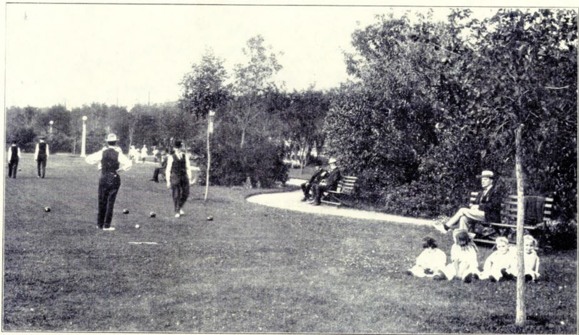
Lawn Bowling in St. James Park 1914