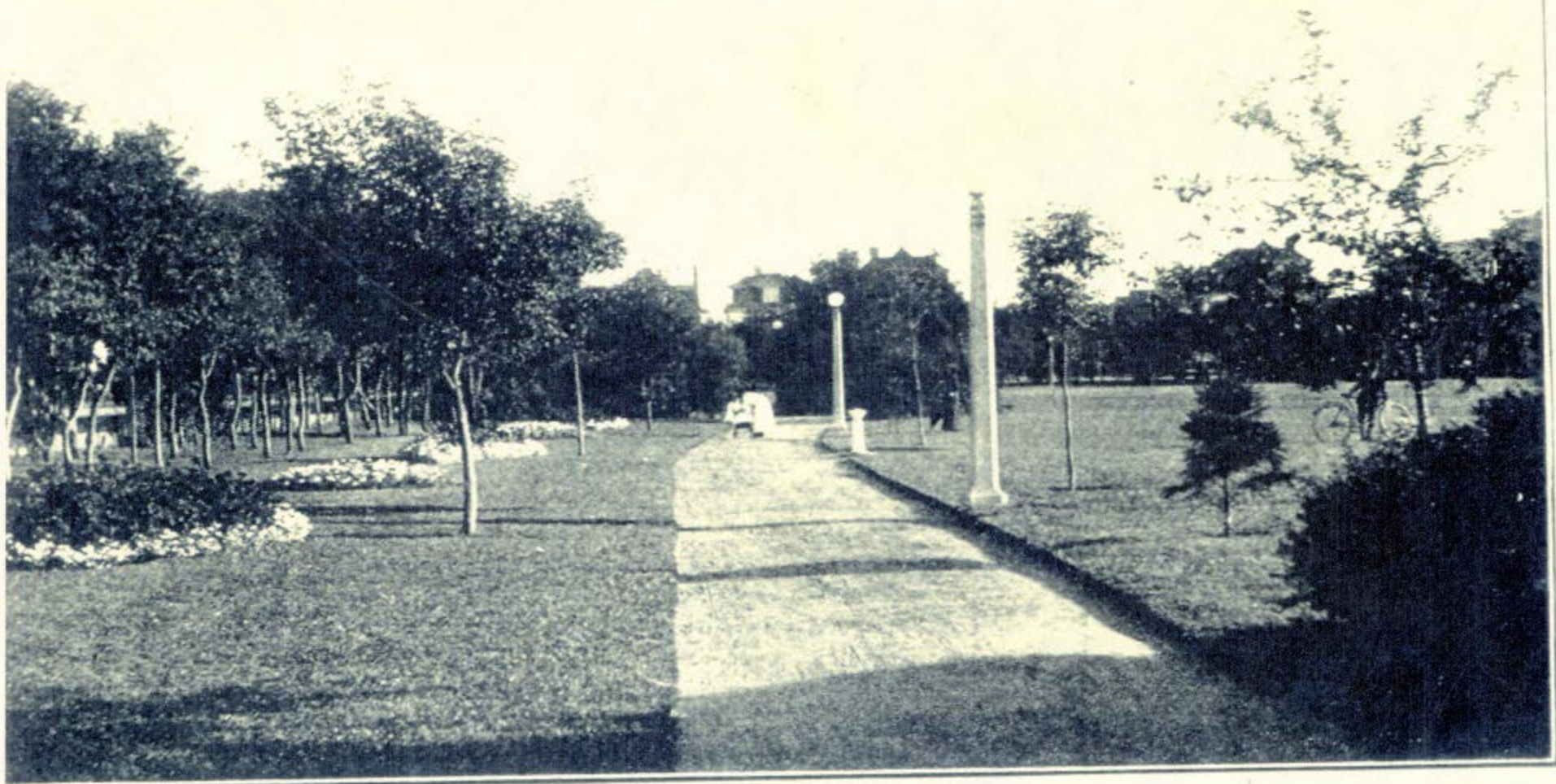
St. James Park 1913