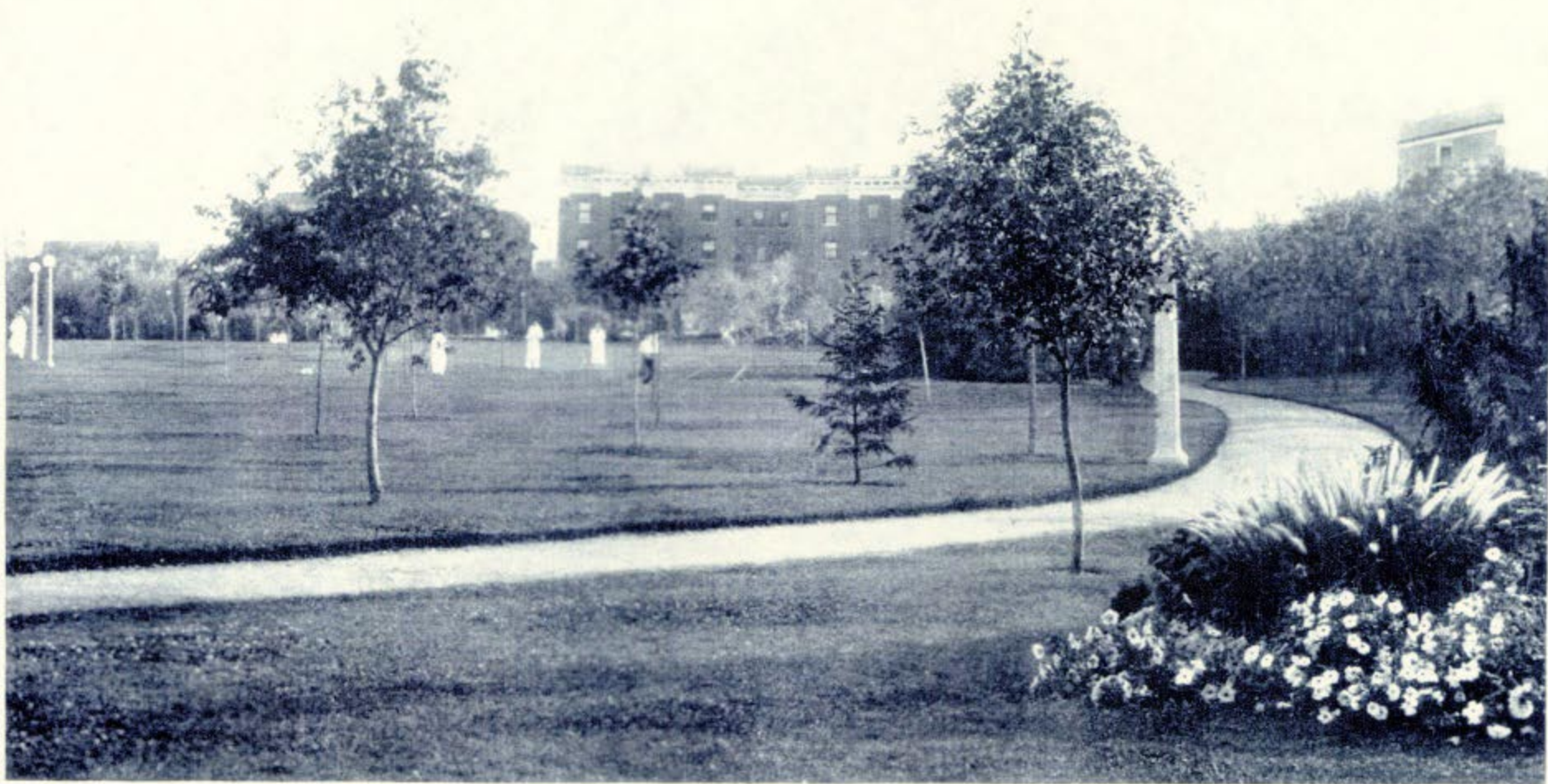
TENNIS COURTS, ST. JAMES PARK 1915 "In the Good Old Summer Time"