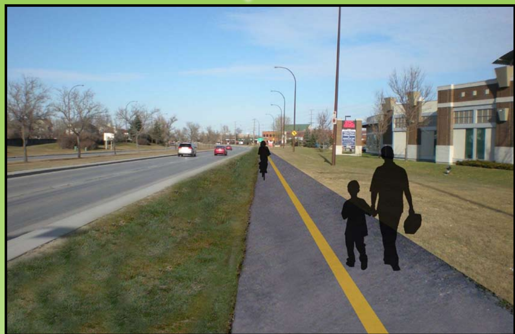
Proposed 3.5 metre asphalt multi-use pathway