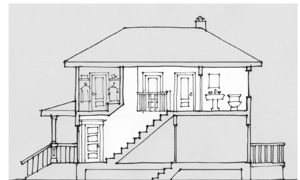
Second floor suite

Every effort has been made to ensure the accuracy of information in this brochure. In the event of a discrepancy between this booklet and the governing City of Winnipeg By-law, the By-law will take precedence.