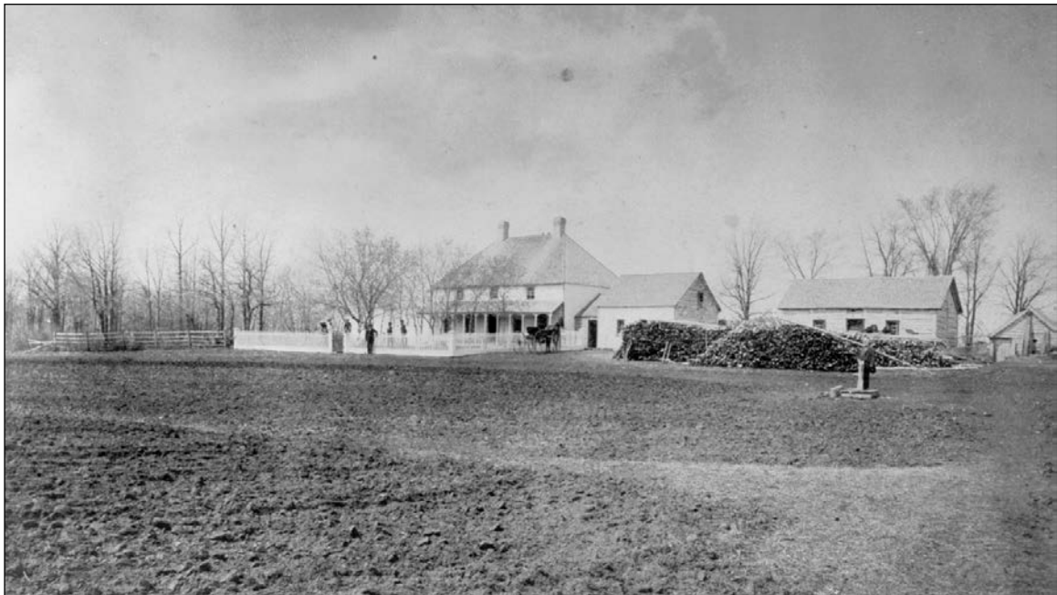
Plate 8 – The McBeth farm, Lot 33, in the 1880s.