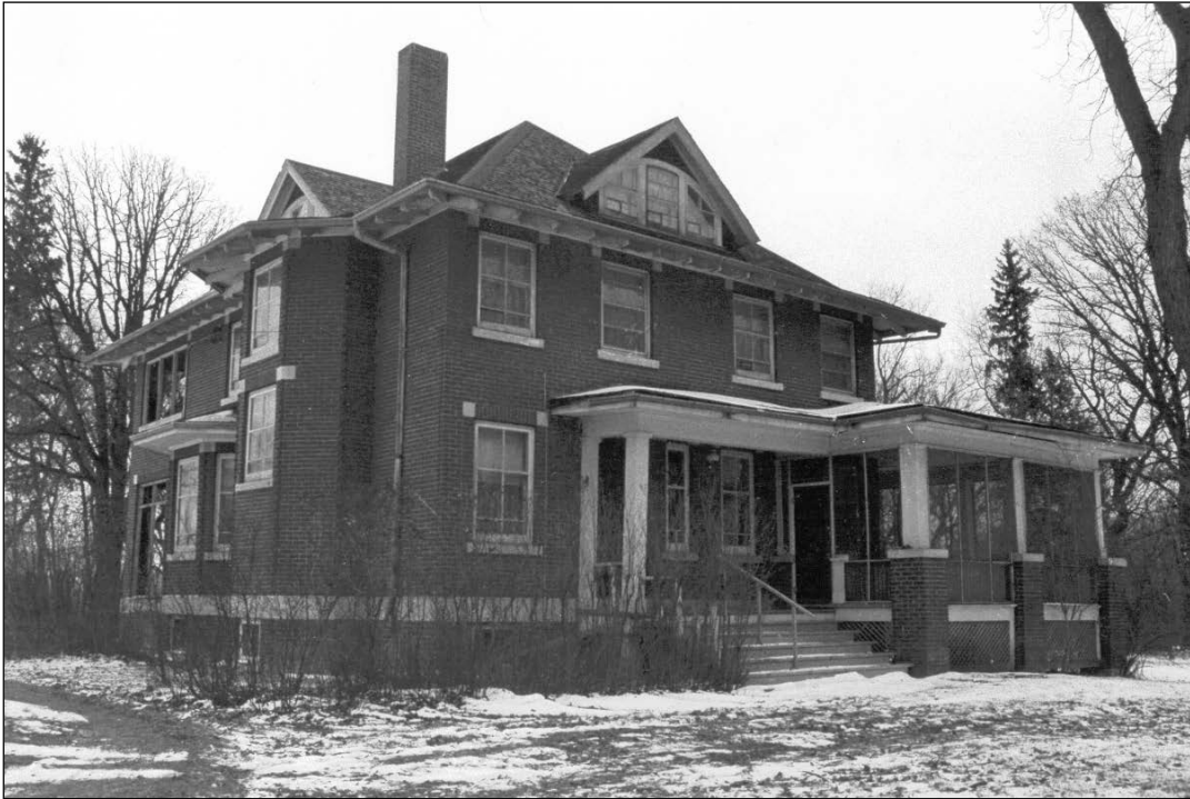
Plate 1 – 31 McBeth Street, McBeth House, 1984.