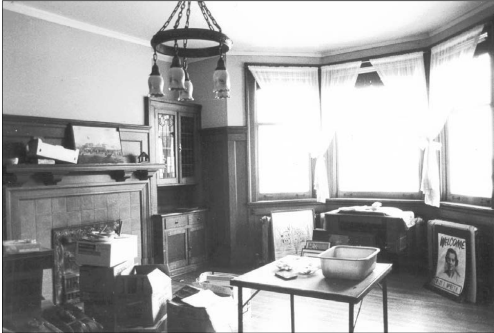
Plate 3 – Dining room, 1984.