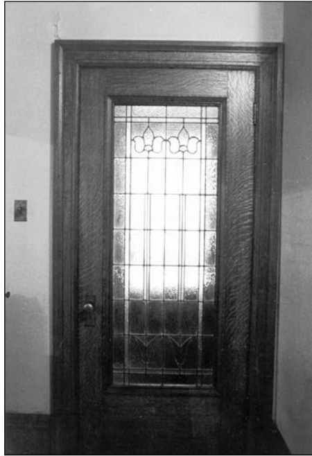
Plate 5 – Glass panel in a foyer door, 1984.