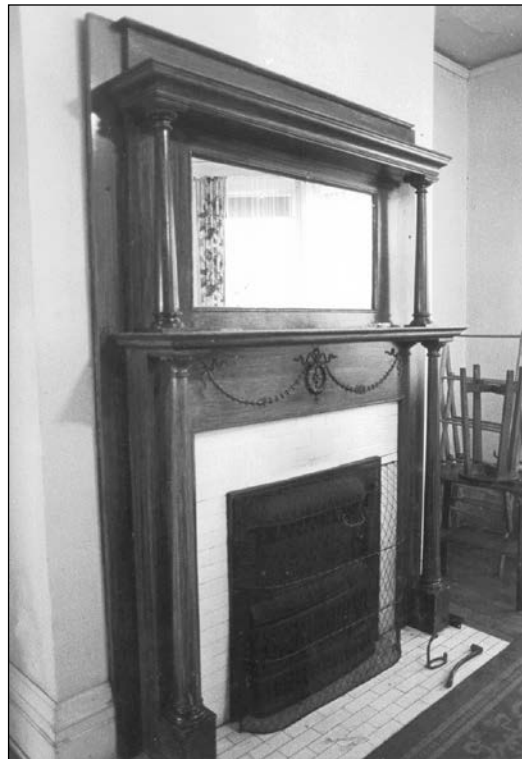
Plate 4 – Detail of the fireplace in the living room, 1984.