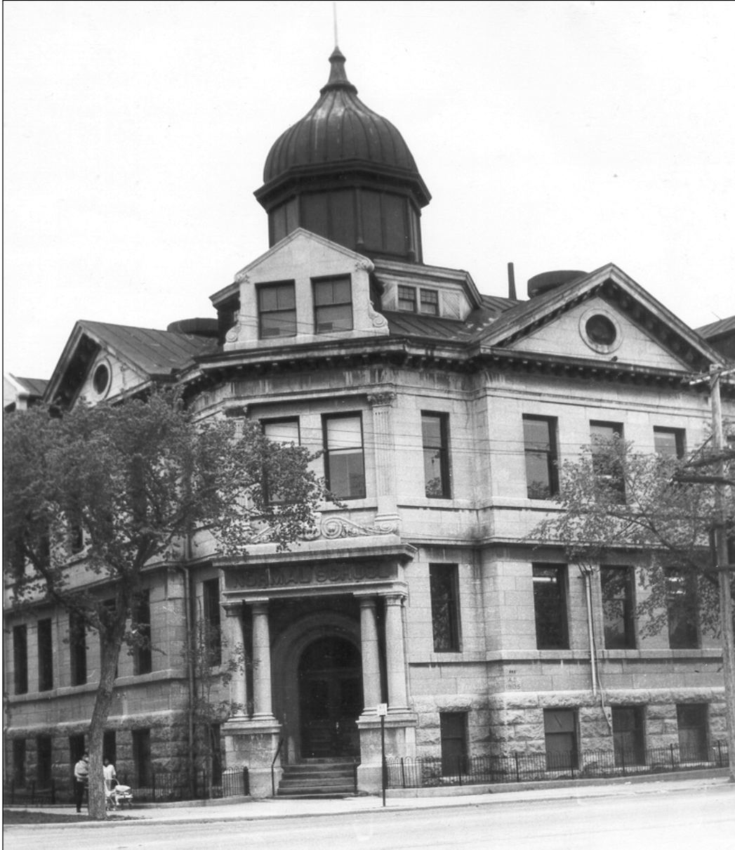
Plate 4 – Provincial Normal School, 1969. .