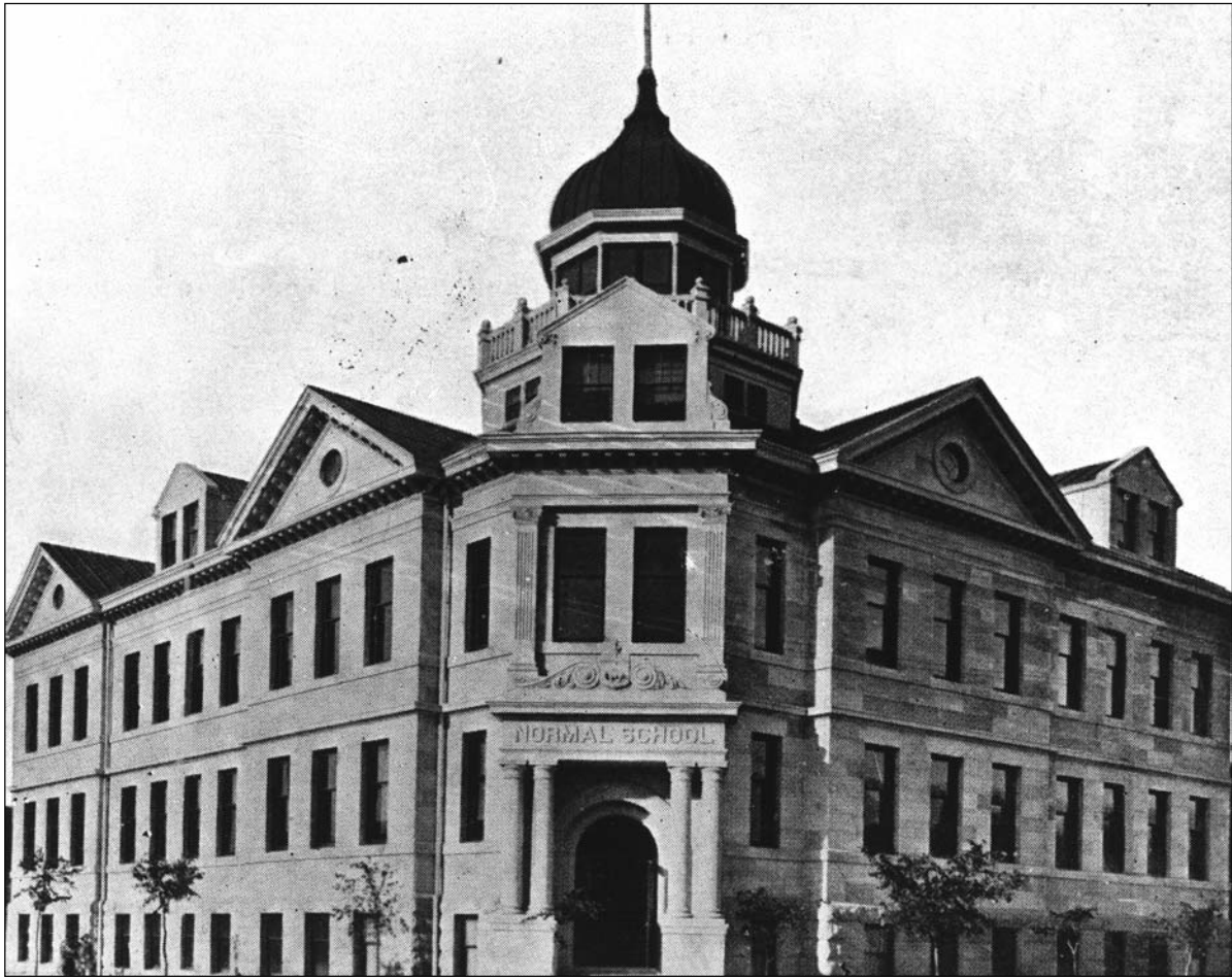
Plate 1 – Provincial Normal School, 442 William Avenue, shortly after construction.