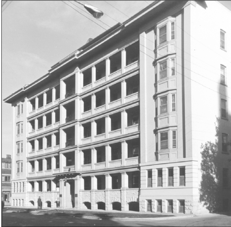
Plate 5 – Warwick Apartments, 1969.