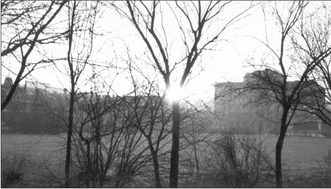
Plate 3 – Sunrise on Central Park with the Warwick on the right, 1913.