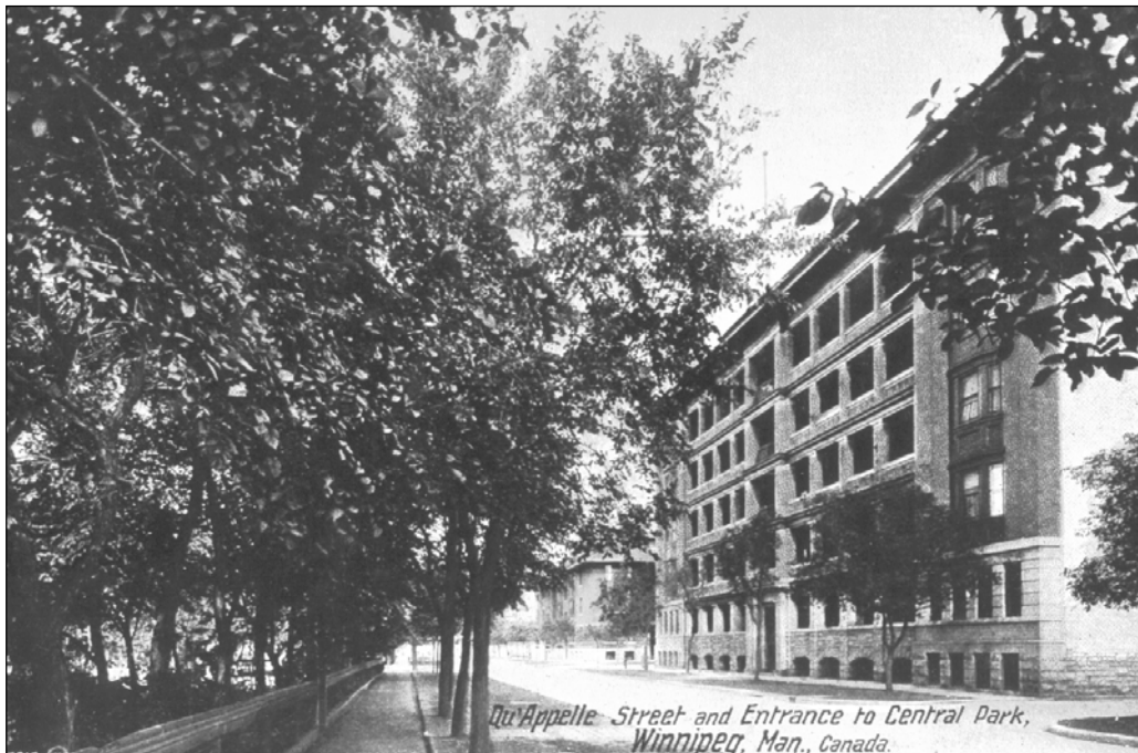
Plate 2 – Taken from a picture postcard, this shot of the Warwick and Central Park has been touched up, ca.1910.