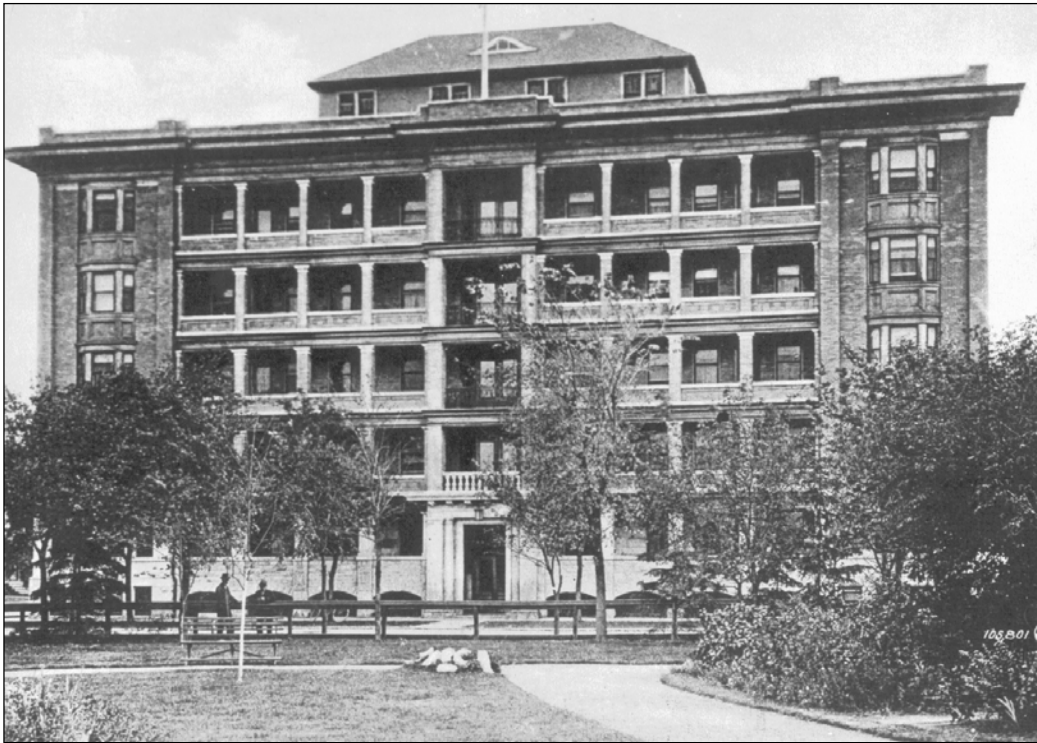
Plate 1 – Warwick Apartments, 366 Qu'Appelle Avenue, not long after its construction, ca.1910.