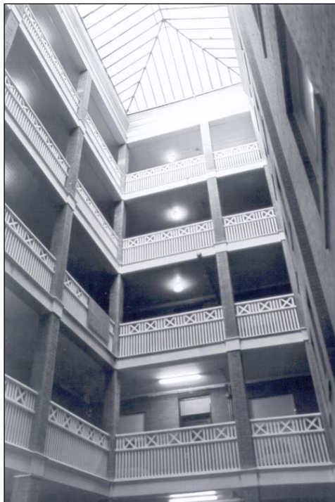
Plate 6 – Details of the courtyard, no date.