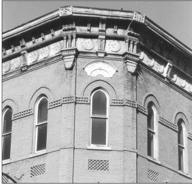
Plate 3 – McDermot Block, exterior detailing, no date.