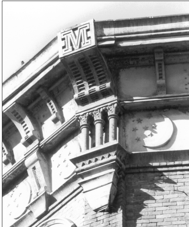
Plate 4 – McDermot Block, exterior detailing, no date.