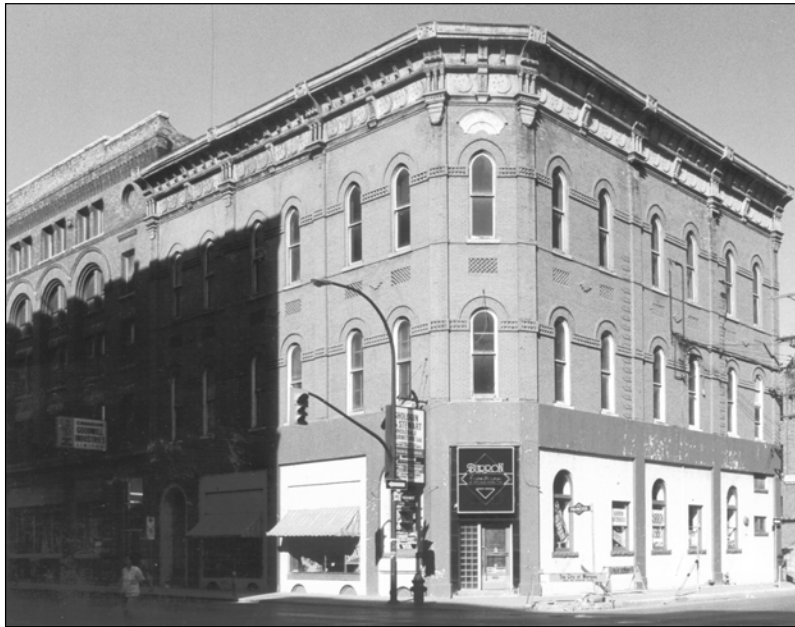
Plate 2 – McDermot Block, 72-74 Princess Street, no date. ( City of Winnipeg Planning Department. )