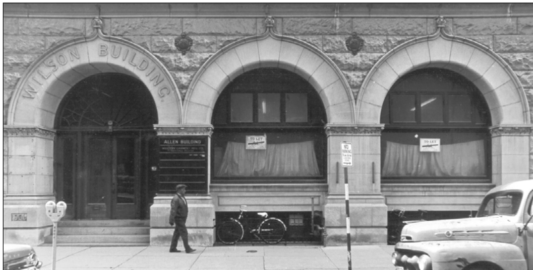
Plate 3 – Detail of the ground floor windows, 1969.