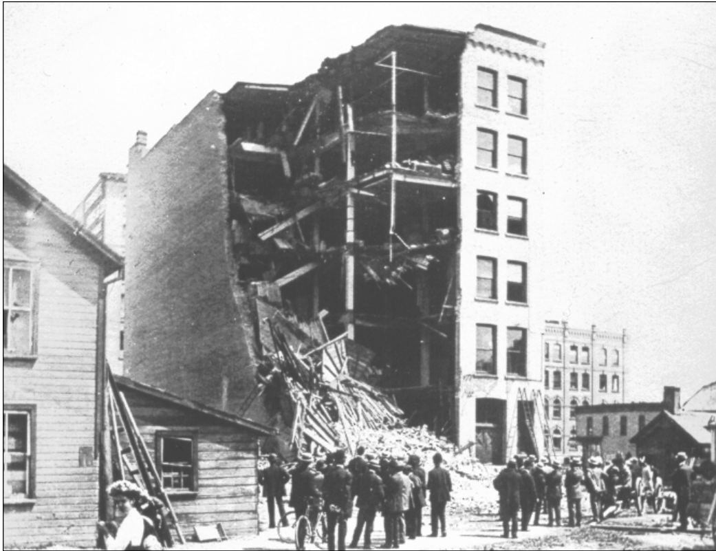
Plate 2 – Rear of the Wilson Building following the collapse of the water tower on the roof, 1908.