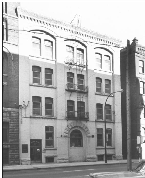
Plate 2 – 87 King Street, the Anne Building, 1970.