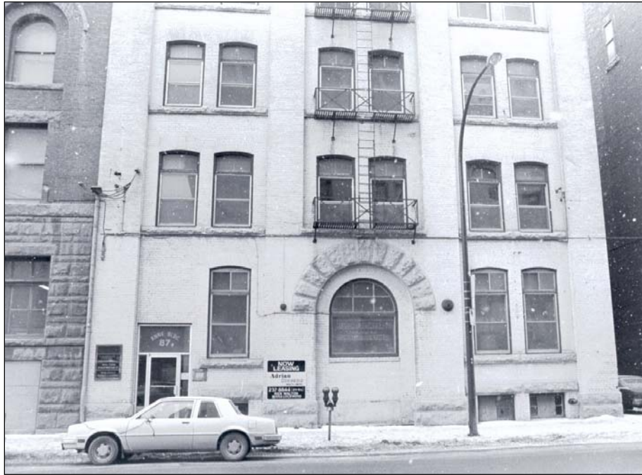
Plate 5 – 87 King Street, Anne Building, 1983.