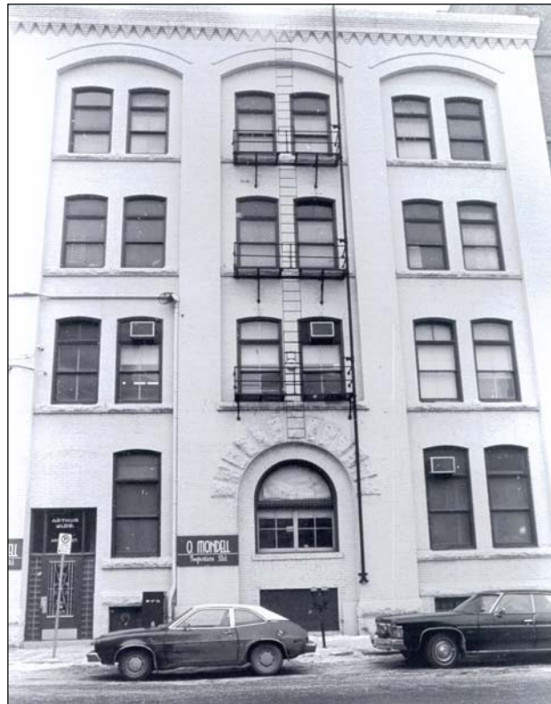
Plate 6 – 88 Arthur Street, Arthur Building, 1983