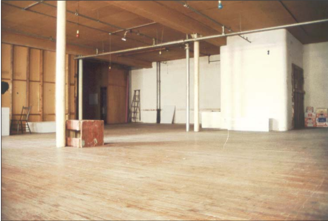
Plate 7 – Typical interior warehouse space, no date. (City of Winnipeg, Planning Department.)