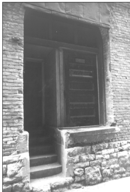
Plate 4 – 88 Arthur Street, altered loading dock, 1970.