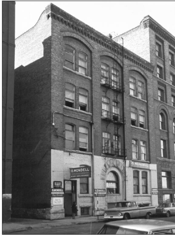
Plate 3 – 88 Arthur Street, the Arthur Building, in 1970.