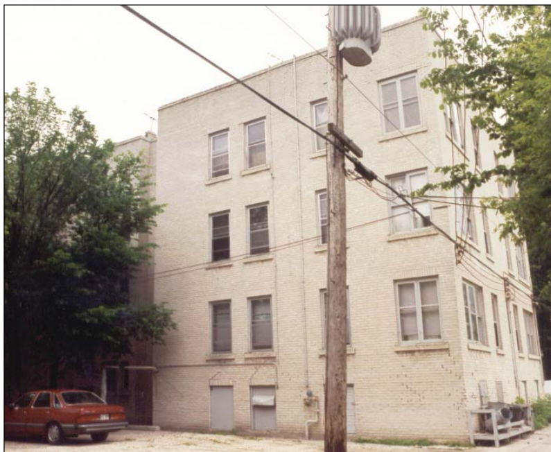
Plate 2 – The Thelma Apartments, 272 Home Street, rear and north side. ( Murray Peterson, 1992. )