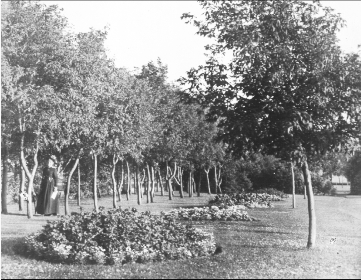
Plate 3 – St. James Park, 1910. (Photo courtesy of the Provincial Archives of Manitoba, N11803.)