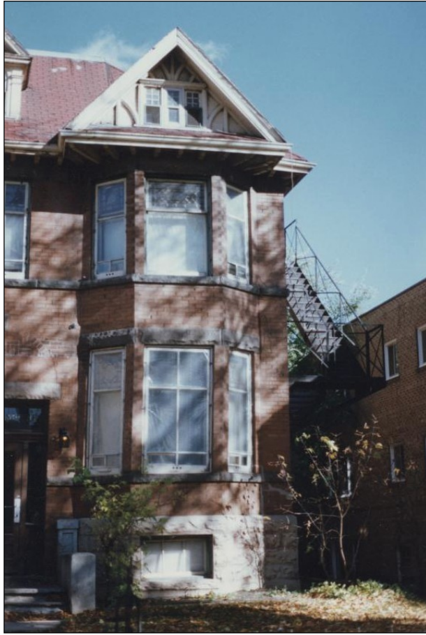
Plate 3 – Bay window on east end of front façade. (M. Peterson, 1989.)