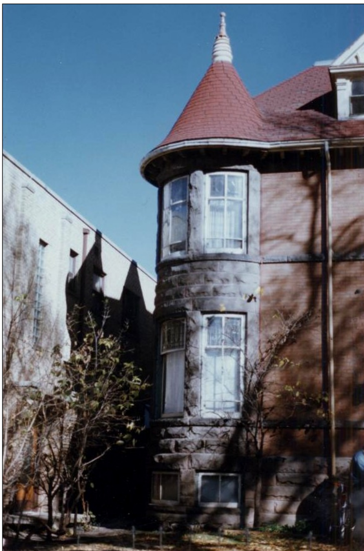
Plate 2 – Tower, northwest corner. ( M. Peterson, 1989. )