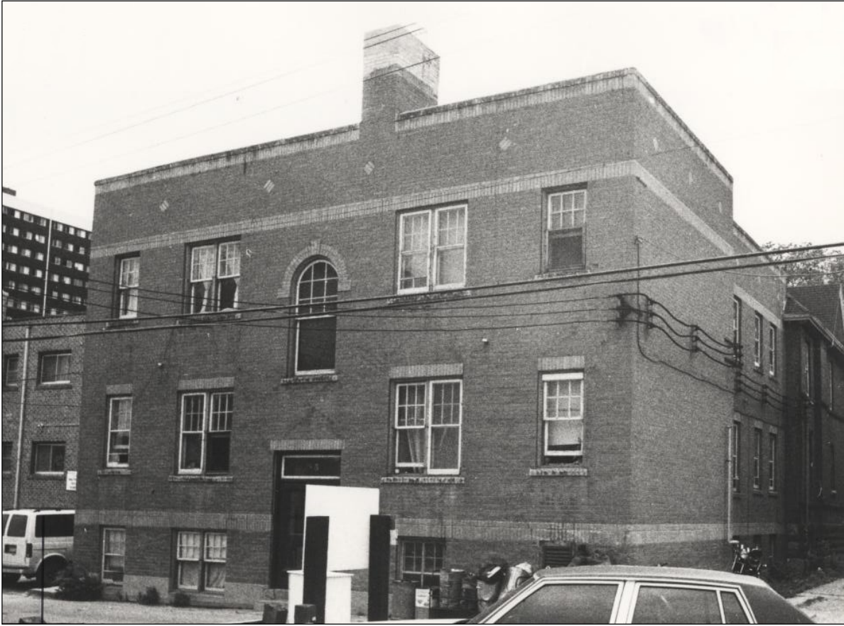
Plate 5 – Rear addition. (M. Peterson, 1989.)