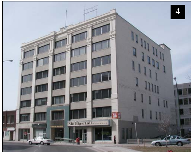
Plate 1 – Some examples of J. and J. McDiarmid designs including: #1- 115 Bannatyne Avenue, Donald H. Bain Building, 1899; #2- 123 Bannatyne Avenue, Marshall-Wells Building, 1900; #3- 138 Portage Avenue, Jacob-Crowley Building, 1909; and #4- Canada Building, 352 Donald Street, 1910.