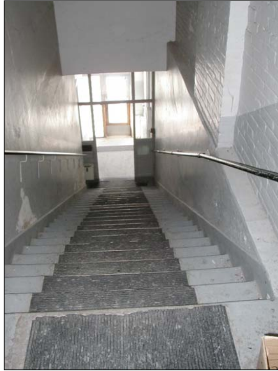
Plate 6 – Stairwell, 2004. ( M. Peterson, 2004. )