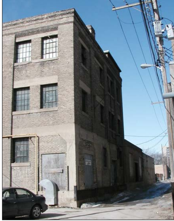
Plate 4 – North and east façades, 2004.