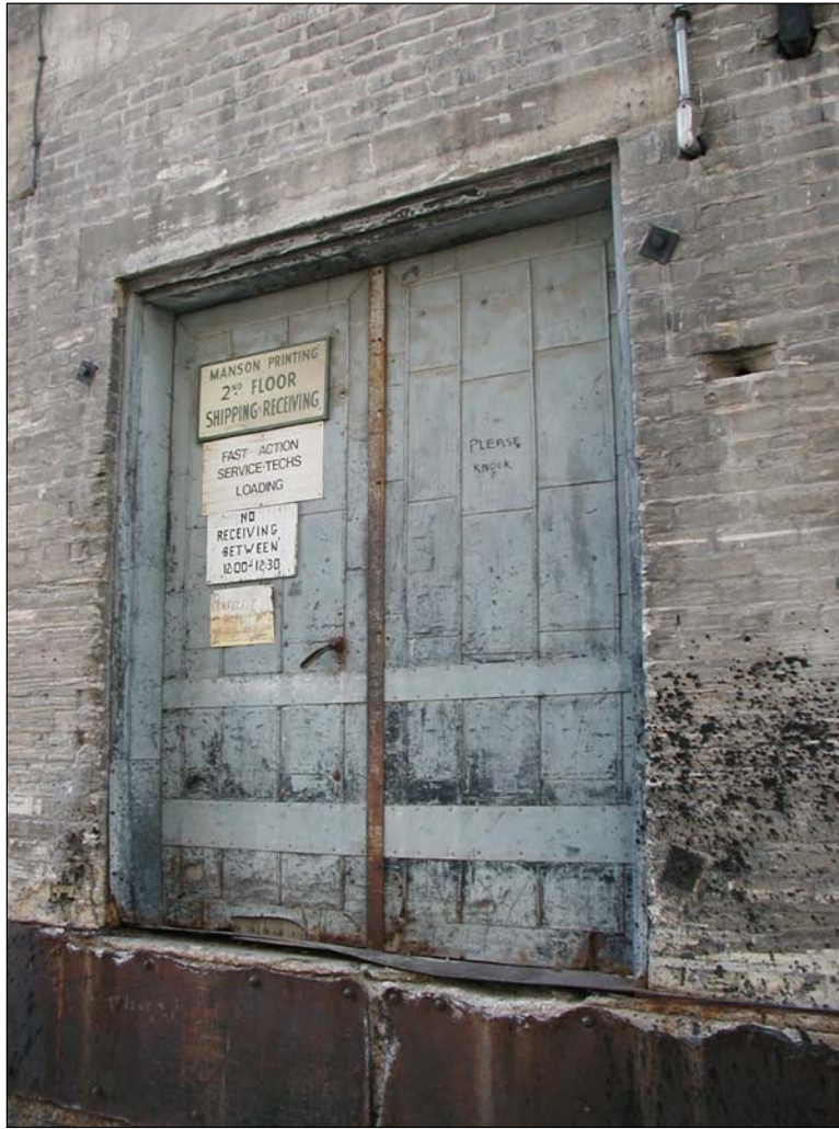
Plate 9 – Metal-clad loading door, north façade, 2004.