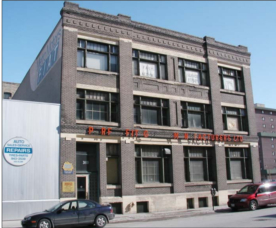
Plate 2 – 319 Elgin Street, Scott Fruit Company Warehouse, front (south) façade, 2004.