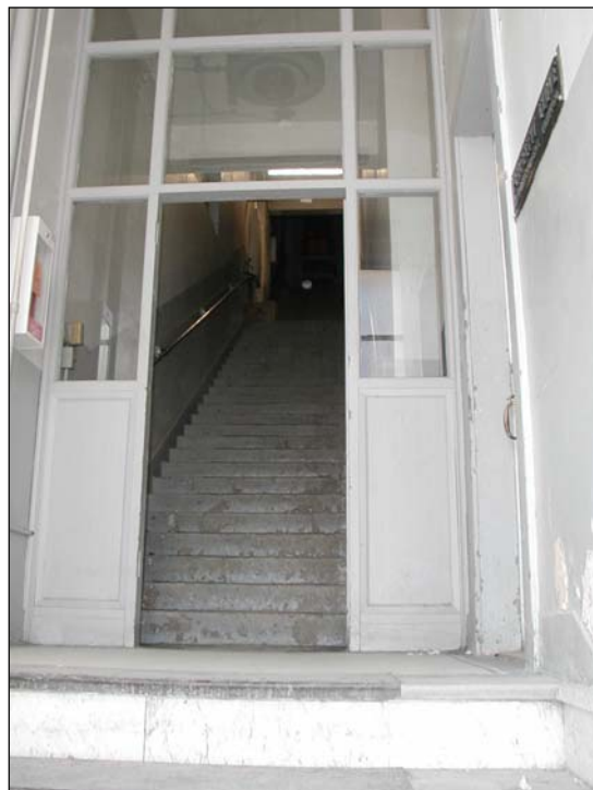
Plate 7 – Ground-floor foyer, 2004. ( M. Peterson, 2004. )