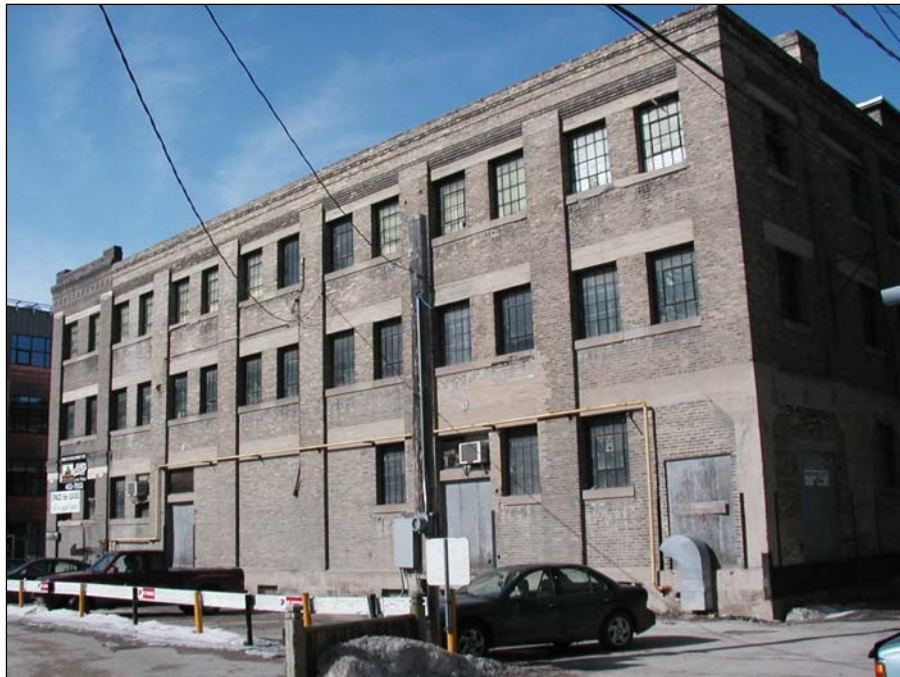
Plate 3 – East façade, 2004. ( M. Peterson, 2004. )