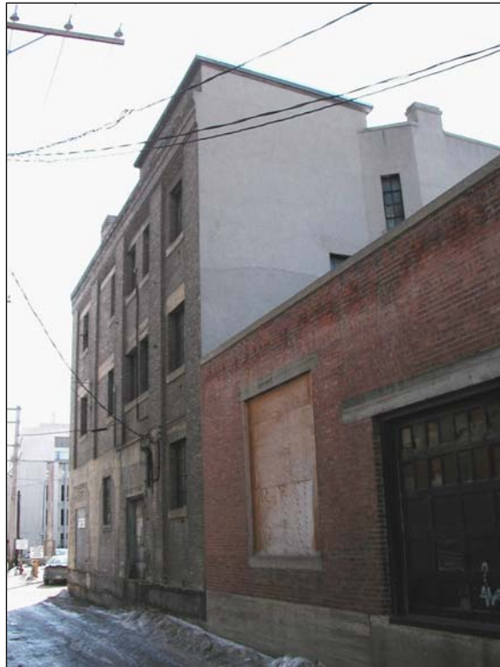
Plate 5 – North and west façades, 2004. ( M. Peterson, 2004. )