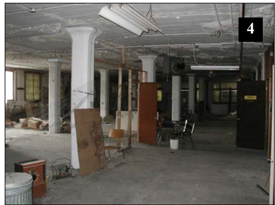
Plate 8 – #1- basement, #2- ground floor, #3- second floor and #4- third floor, 2004.