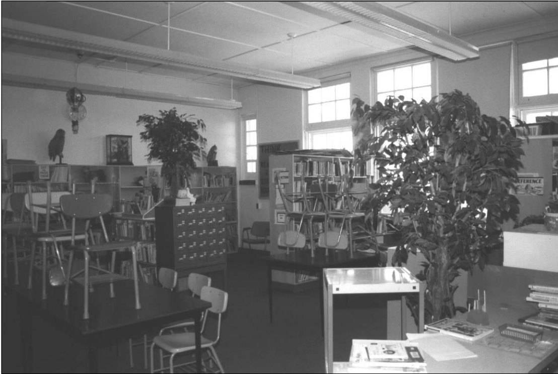
Plate 10 –Wolseley School, 511 Clifton Street South, typical classroom.