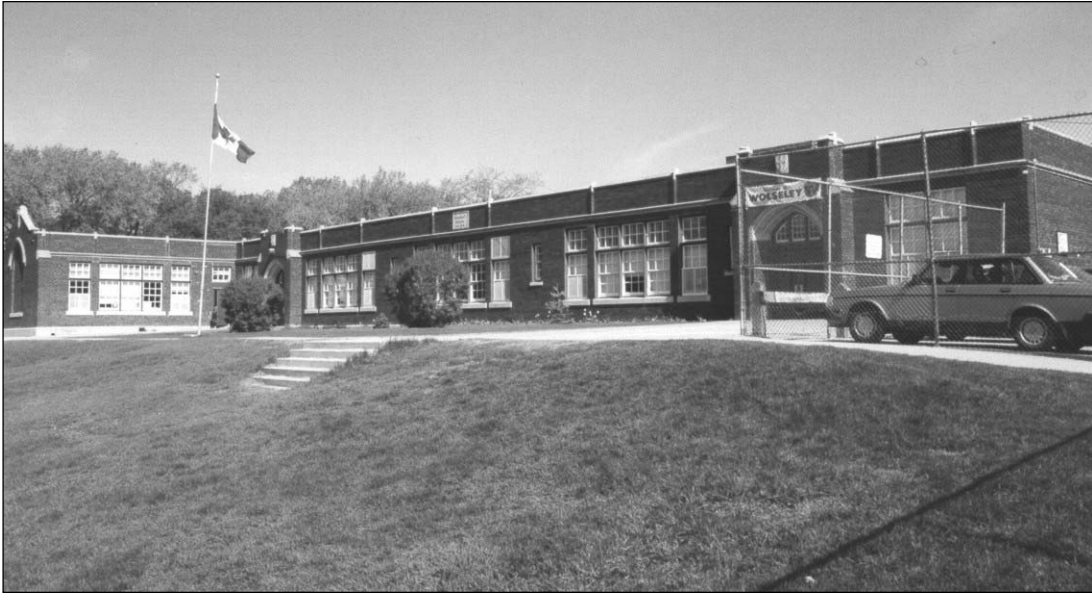
Plate 6 – Wolseley School, 511 Clifton Street South, south façade.