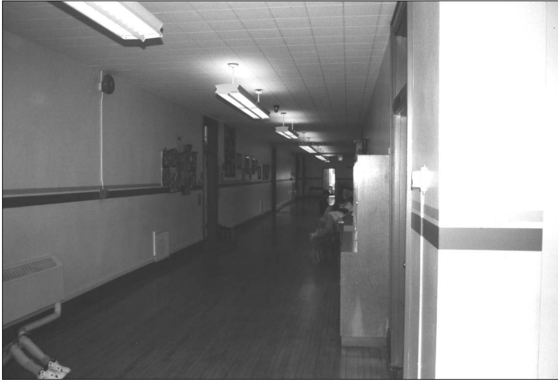
Plate 8 – Interior of Wolseley School, 511 Clifton Street South, main hall looking east. ( M. Peterson, 1996. )