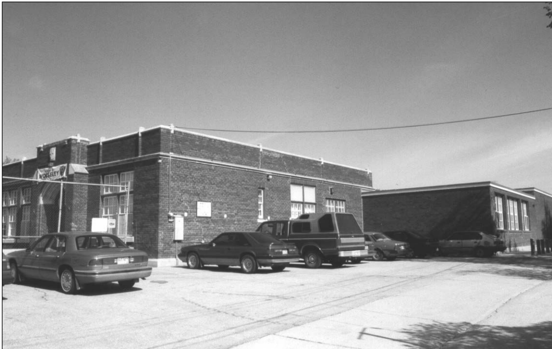
Plate 7 – Wolseley School, 511 Clifton Street South, northeast corner, showing 1959 auditorium and the Community Club (built ca.1976).