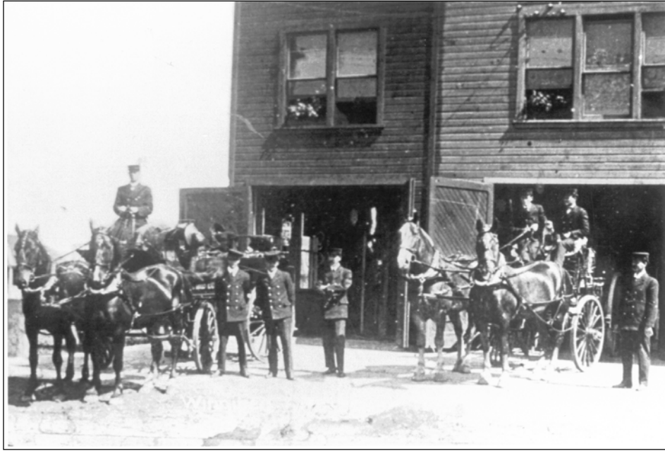
Plate 5 – Temporary Fire Hall No. 3, Maple Street, ca.1882.