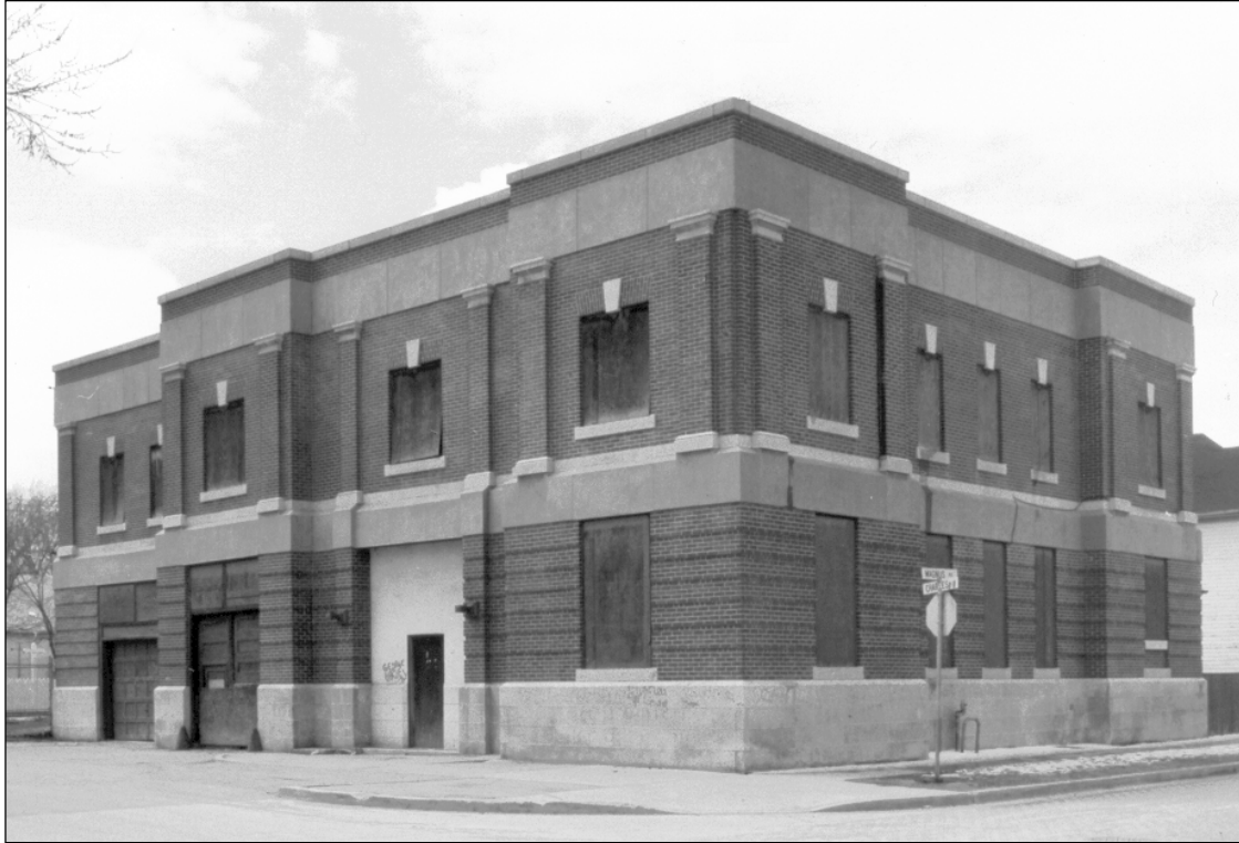
Plate 1 – 200 Charles Street, former North End Police Substation.