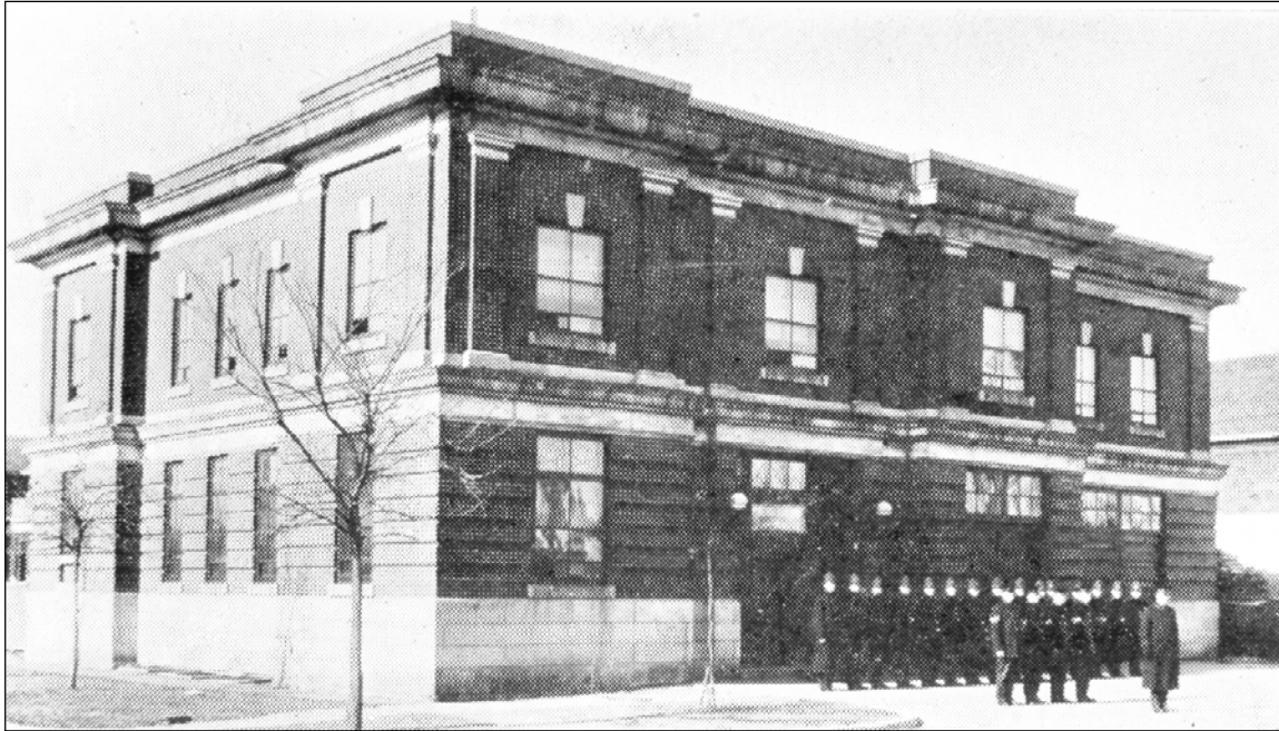
Plate 3 – Jessie Avenue, Fort Rouge Substation, n.d., now demolished.