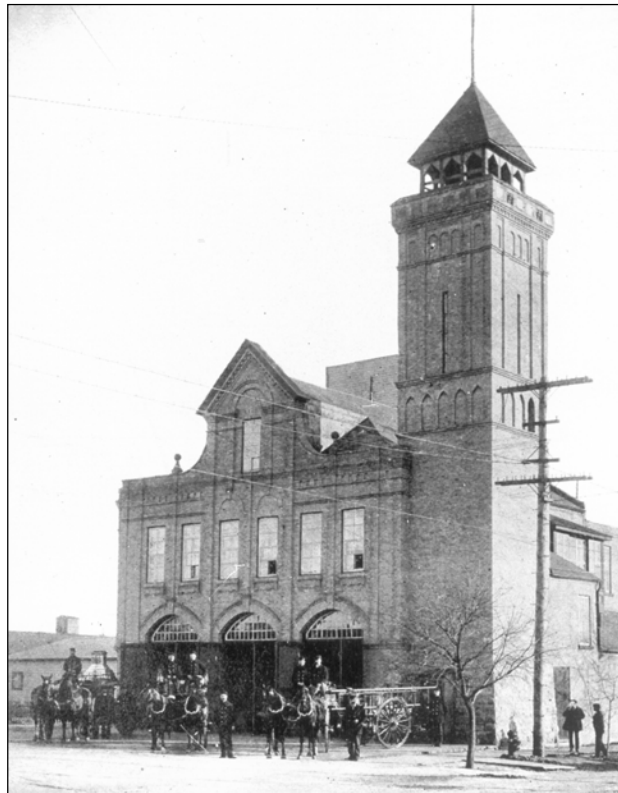
Plate 6 – Fire Hall No. 3, 57 Maple Street, ca.1904.