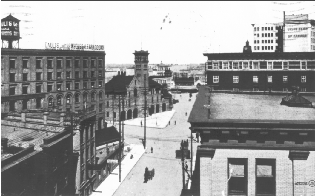
Plate 3 – Looking north along Albert Street, ca. 1910.