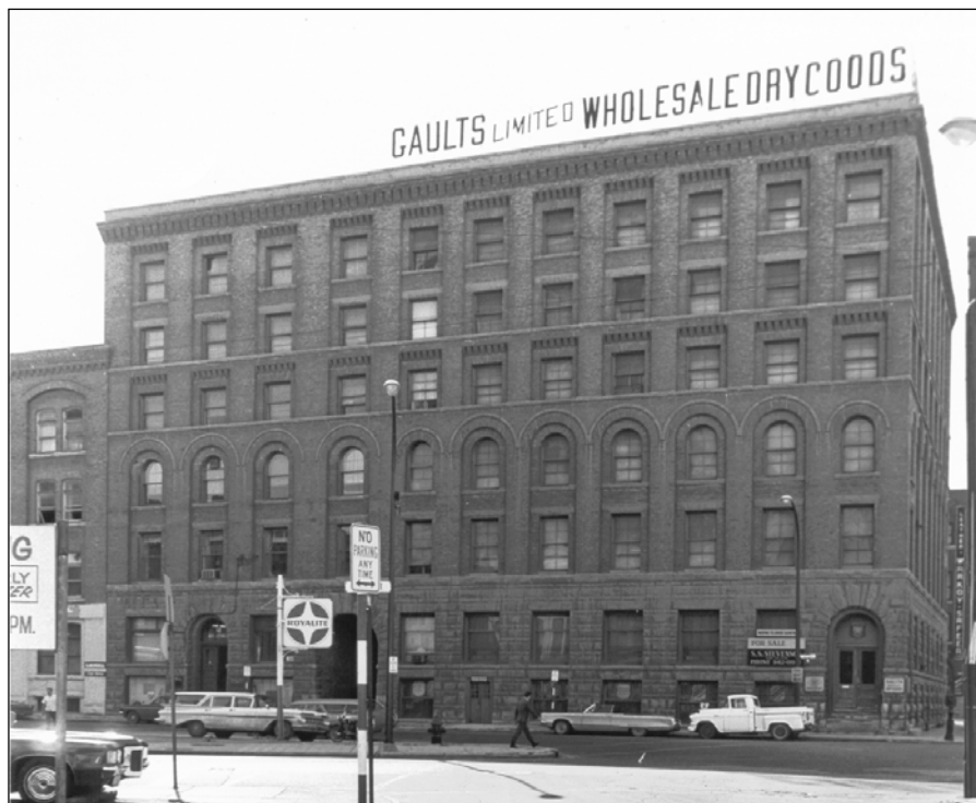
Plate 4 – Gault Brothers Company Warehouse, Arthur Street, 1969.