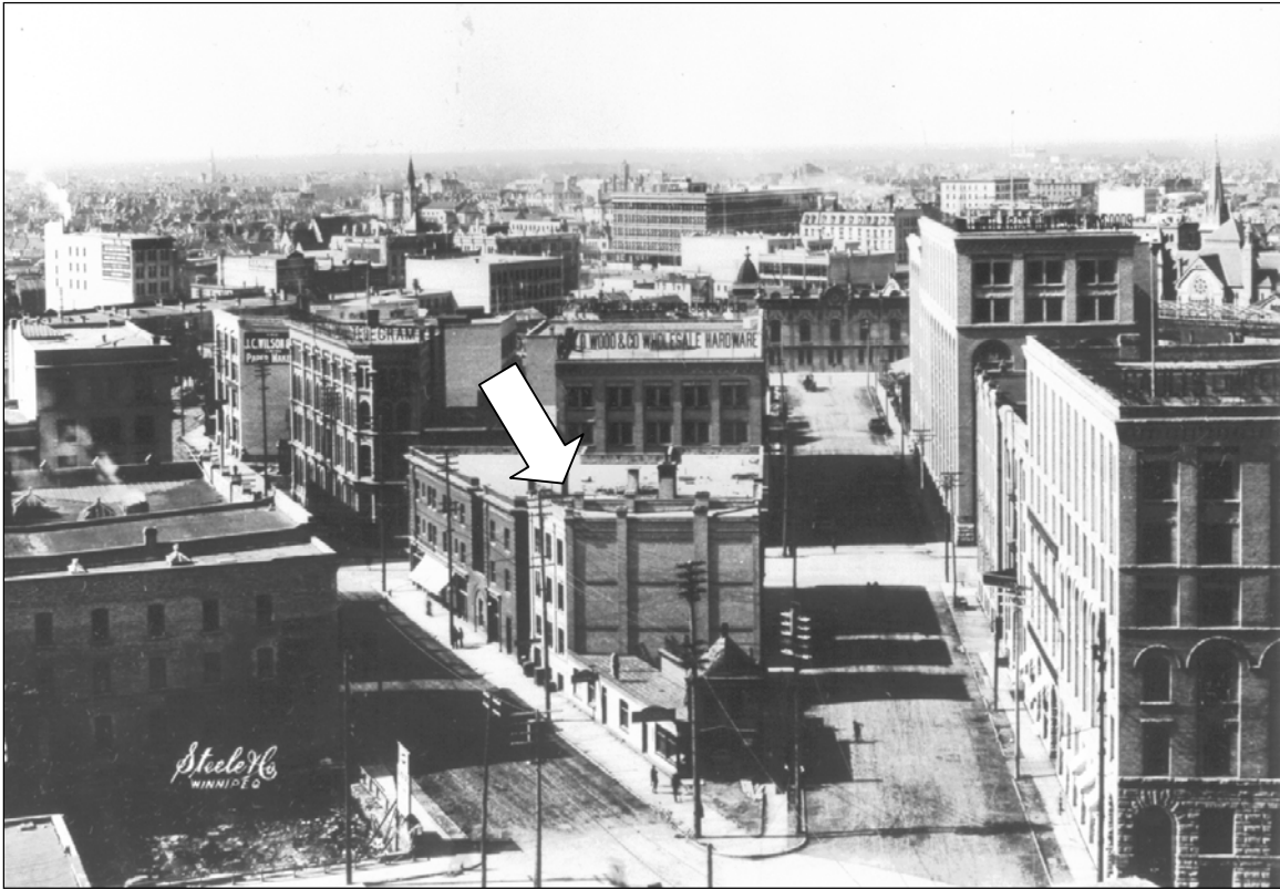
Plate 3 – Warehouse District, ca.1905, Western Building at arrow.