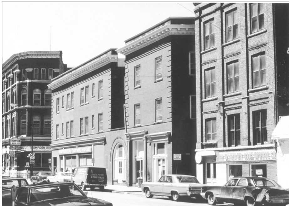
Plate 2 – Albert Street with the Western Building in the foreground, 1969.