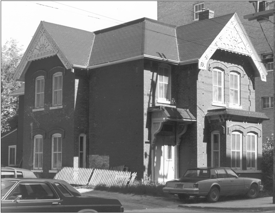
Plate 2 – Kelly House, no date. (City of Winnipeg, Planning Department.)