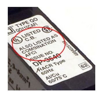
Sample Labels on Combination-Type AFCI Breakers

The above requirements are applicable to all new installations.