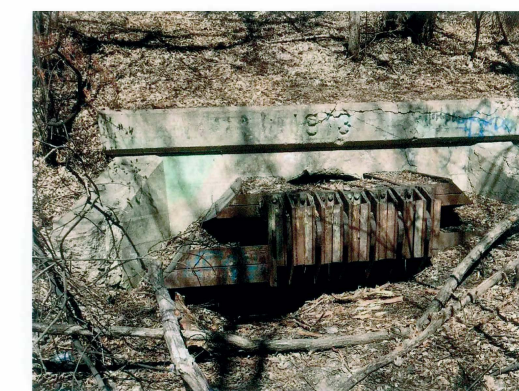
PICTURE 2: EXISTING STEEL STRUCTURE TO BE REMOVED AND DISPOSED OF. MAINTAIN CONCRETE HEADWALL