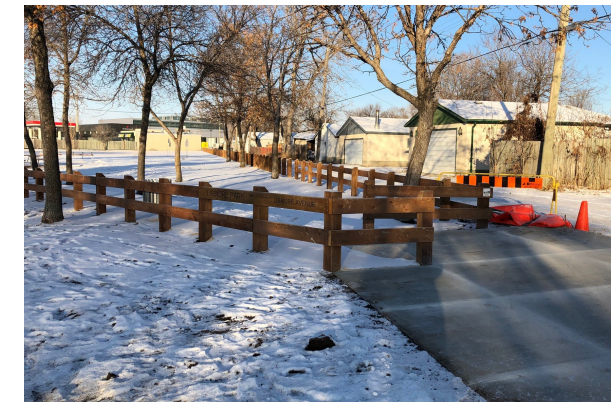
wood fence example: Lismore Park

CONTRACTOR TO CONFIRM ALL DIMENSIONS AND REPORT ANY DISCREPANCIES TO CONTRACT ADMINISTRATOR PRIOR TO CONSTRUCTION. LOCATION OF UNDERGROUND STRUCTURES AS SHOWN ARE BASED ON THE BEST INFORMATION AVAILABLE BUT NO GUARANTEE IS GIVEN THAT ALL EXISTING UTILITIES ARE SHOWN OR THAT THE GIVEN LOCATIONS ARE EXACT. CONFIRMATION OF EXISTENCE AND EXACT LOCATION OF ALL SERVICES MUST BE OBTAINED FROM THE INDIVIDUAL UTILITIES BEFORE PROCEEDING WITH CONSTRUCTION.