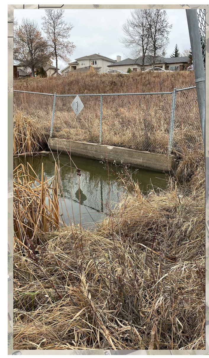
PIPE OUTLET DATE: 2022-11