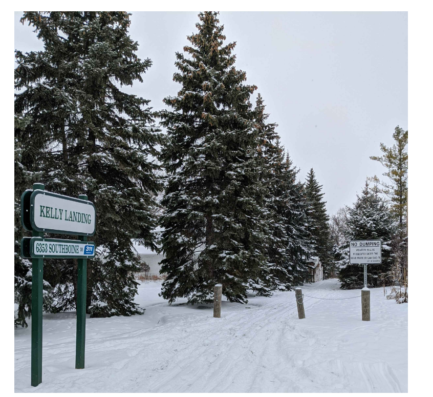
SITE ACCESS DATE: 2022-11