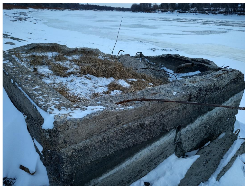
Photo 21: Old concrete block (to be removed) marks the downstream limit of riprap (refer to drawings for details). (December 1, 2022)