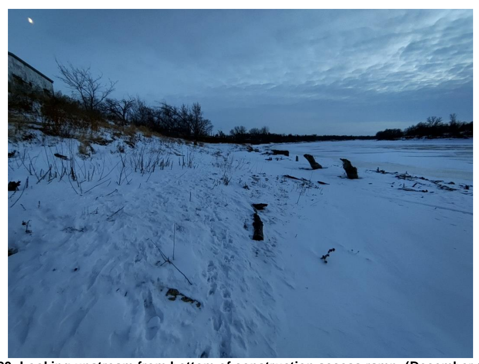
Photo 20: Looking upstream from bottom of construction access ramp. (December 1, 2022)