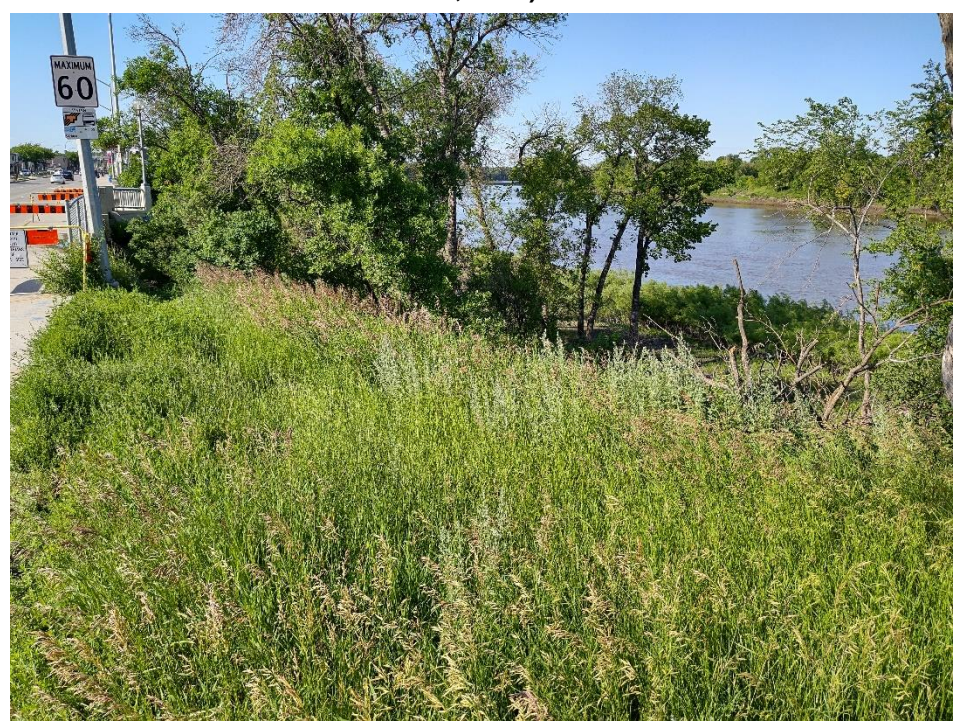
Photo 10: Potential site access. Looking upstream at the top of the bank showing the barricaded failed sidewalk (July 12, 2022)