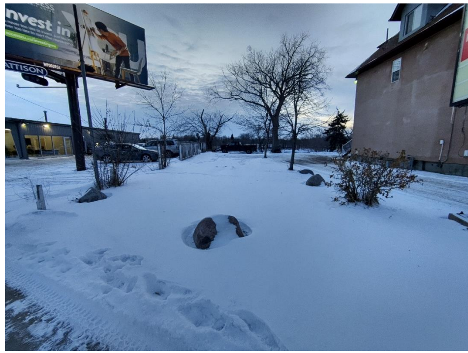
Photo 17: Location of top of construction access ramp at 480 St. Mary's Road. (December 1, 2022)