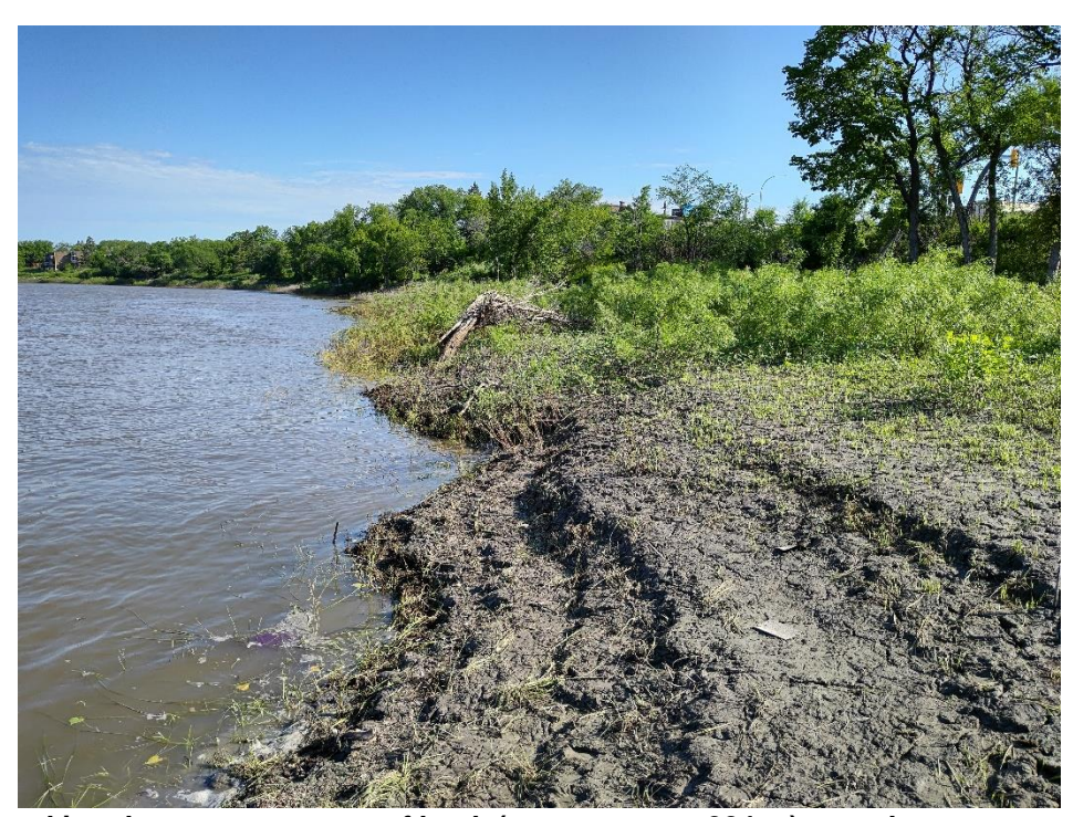
Photo 14: Looking downstream at toe of bank (water approx. 224 m) near the upstream edge of the project area (July 12, 2022)