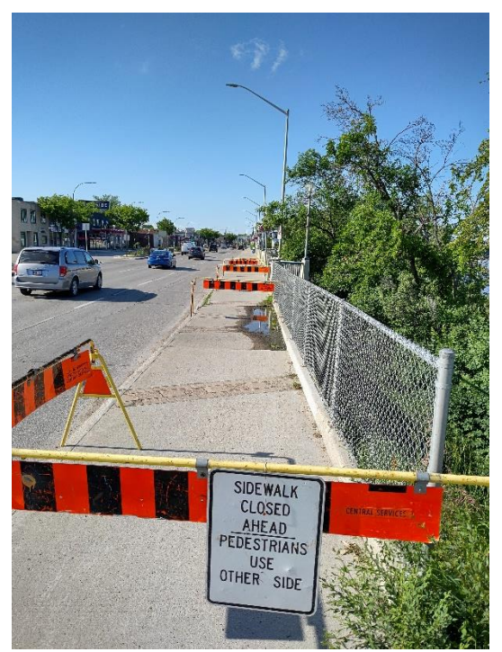
Photo 3: Looking south on St. Mary's at closed sidewalk segment (July 12, 2022)