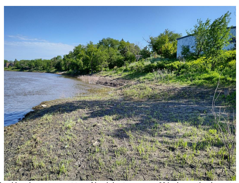
Photo 16: Looking downstream at toe of bank (water approx. 224 m) near the downstream edge of the project area (July 12, 2022)