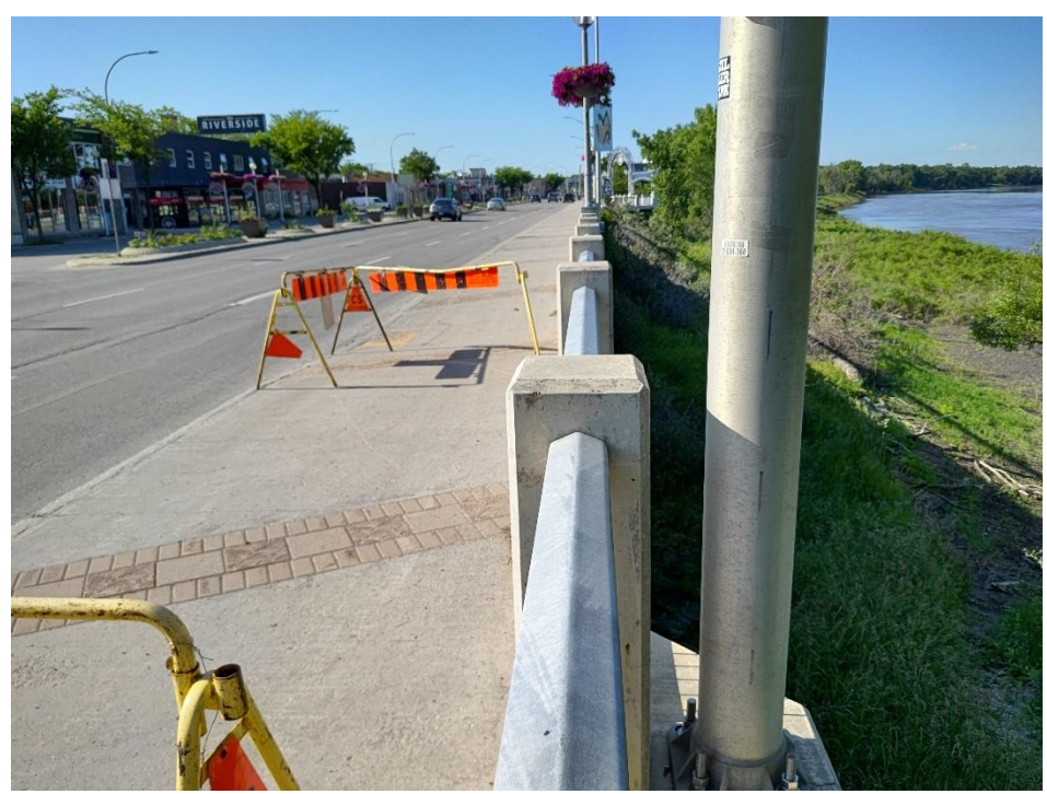
Photo 4: Looking upstream at the top of bank near the upstream edge of the project area (July 12, 2022)