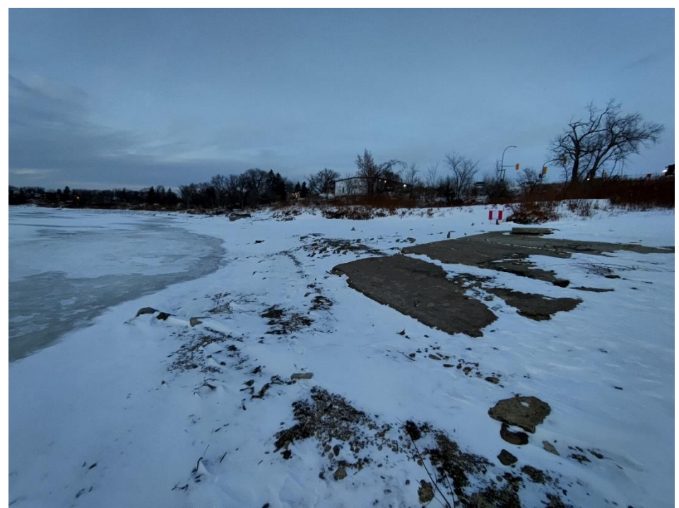
Photo 23: Looking downstream from concrete slab (old boat launch to be removed) . (December 1, 2022)