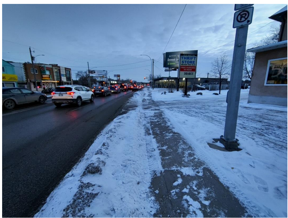
Photo 18: Looking south near top of construction access ramp. Caution must be exercised around existing signs and utilities (December 1, 2022)