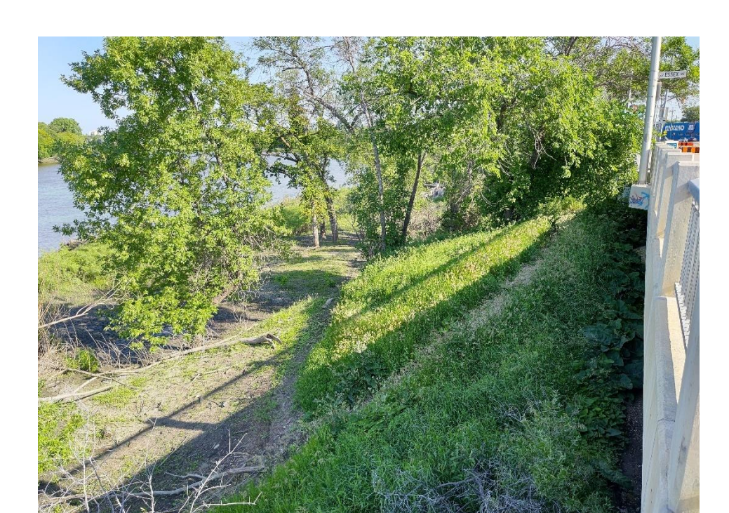
Photo 9: Looking downstream at the top of bank near the upstream edge of the project area (July 12, 2022)