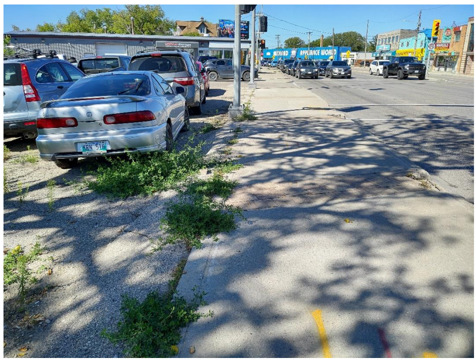
Photo 2: Looking north on St. Mary's from Vivian intersection (August 31, 2022)