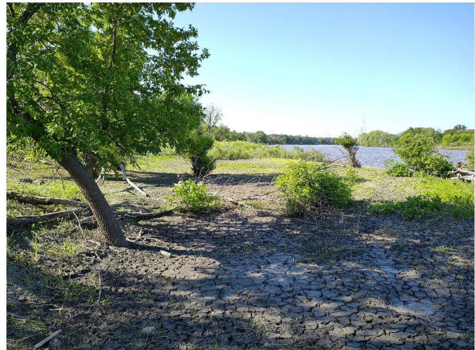
Photo 11: Looking upstream at mid-bank (approx. OHWM) near the upstream edge of the project area (July 12, 2022)