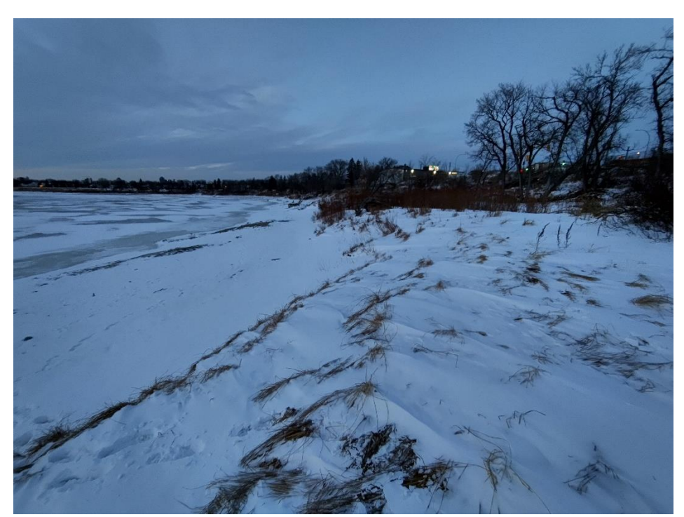
Photo 24: Looking downstream at toe of riverbank (water approx. 222 m) (December 1, 2022)