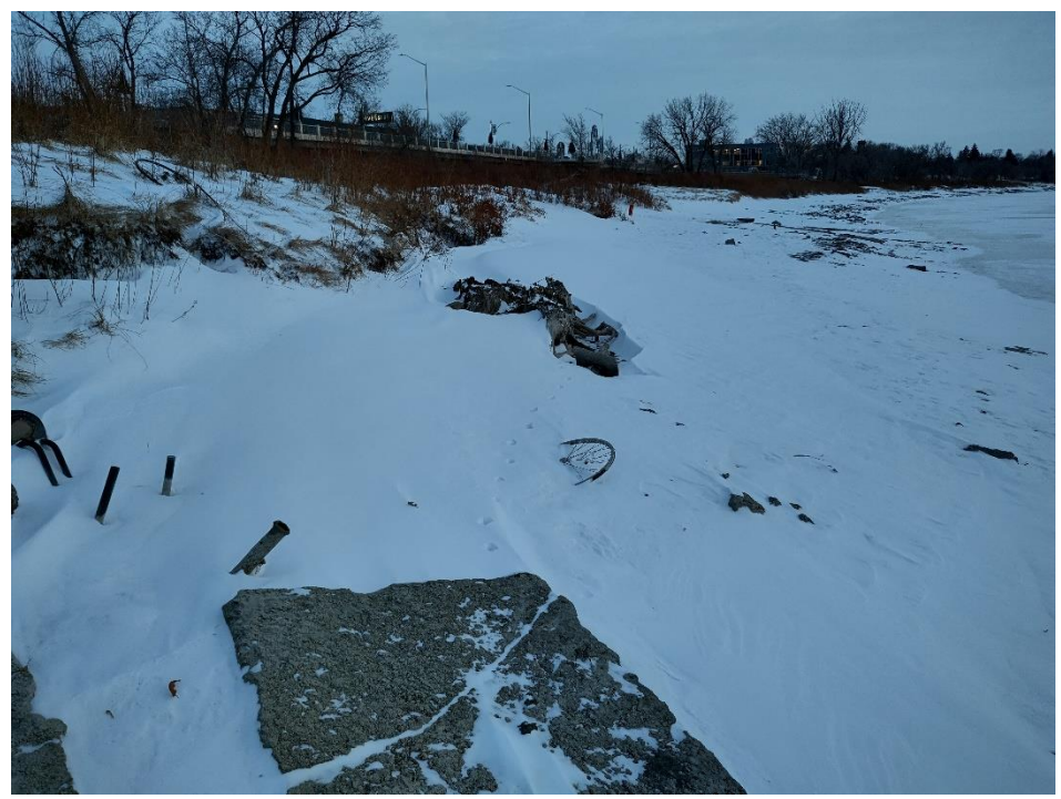
Photo 22: Looking upstream from old concrete block (to be removed). (December 1, 2022)