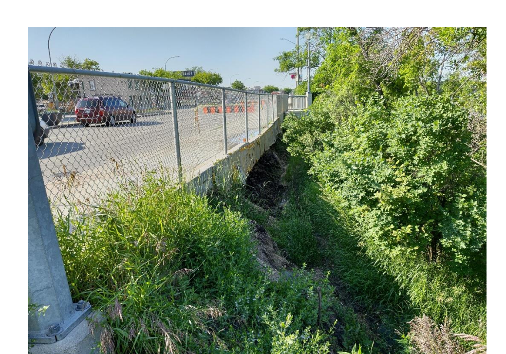
Photo 7: Looking south on St. Mary's at closed sidewalk segment. Significant undermining (July 12, 2022)