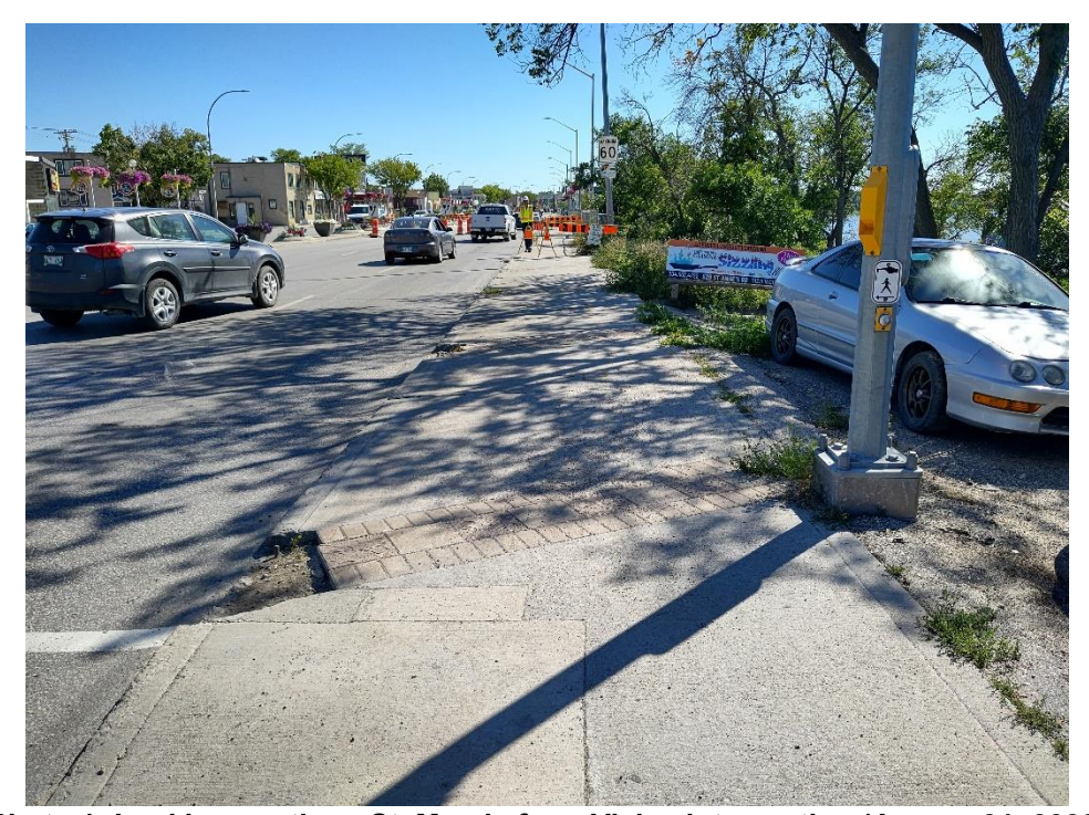
Photo 1: Looking south on St. Mary's from Vivian intersection (August 31, 2022)