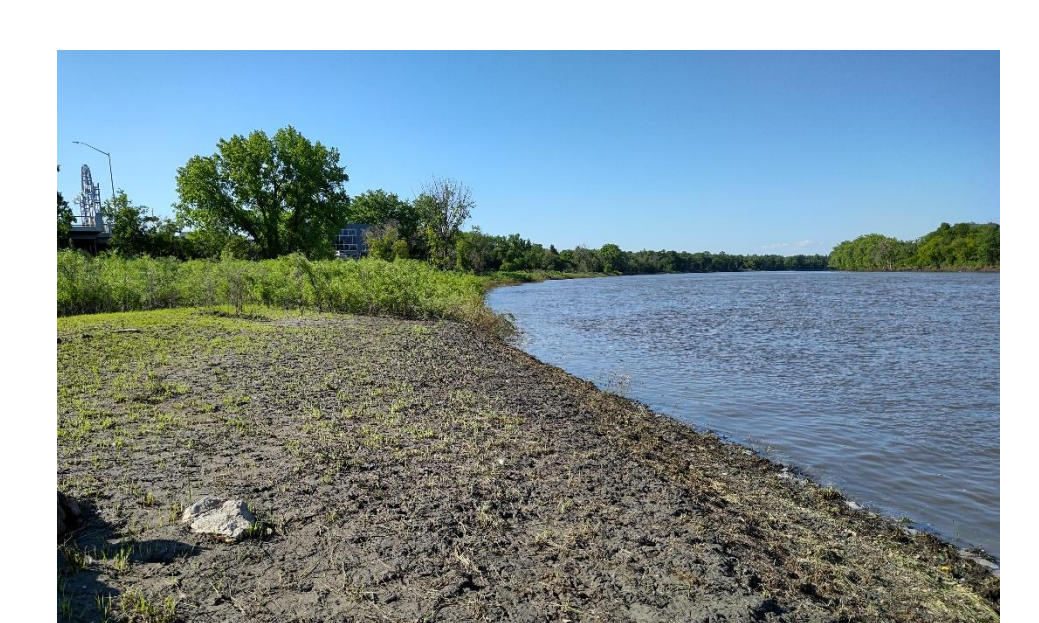
Photo 13: Looking upstream at toe of bank (water approx. 224 m) near the upstream edge of the project area (July 12, 2022)