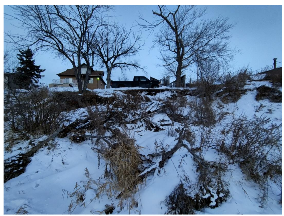
Photo 19: Looking upslope from bottom of construction access ramp. Site must be secured with fencing. Refer to tree protection specifications. (December 1, 2022)