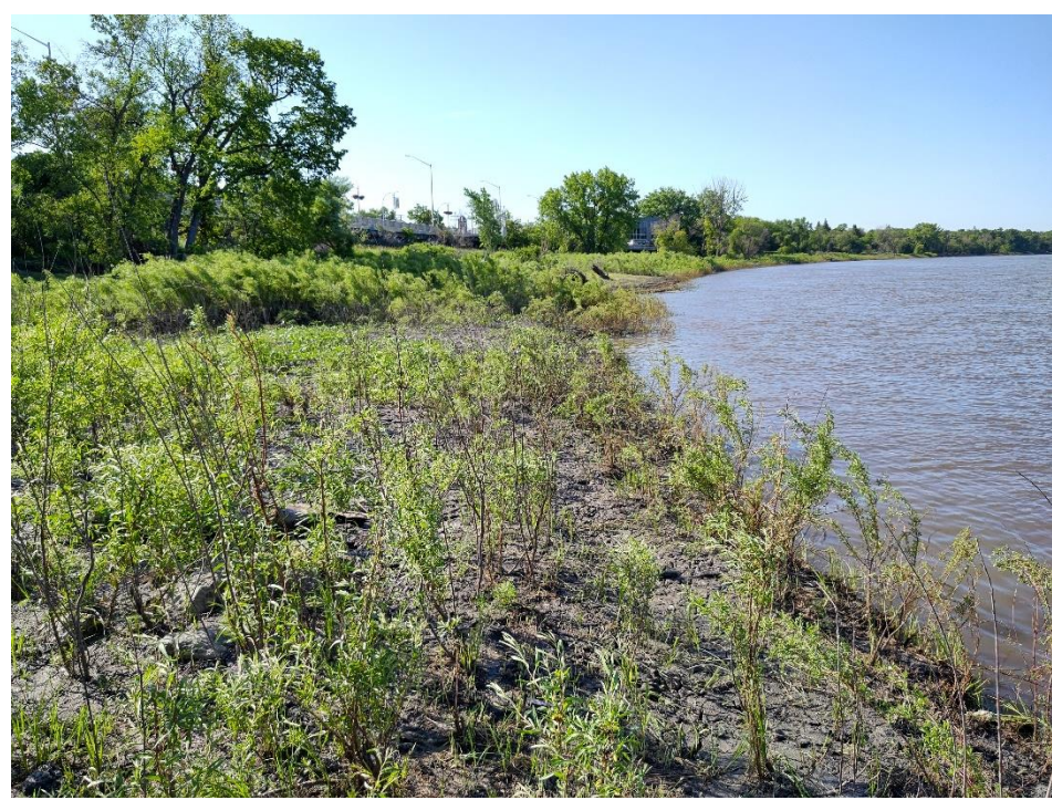
Photo 15: Looking upstream at toe of bank (water approx. 224 m) near the downstream edge of the project area (July 12, 2022)