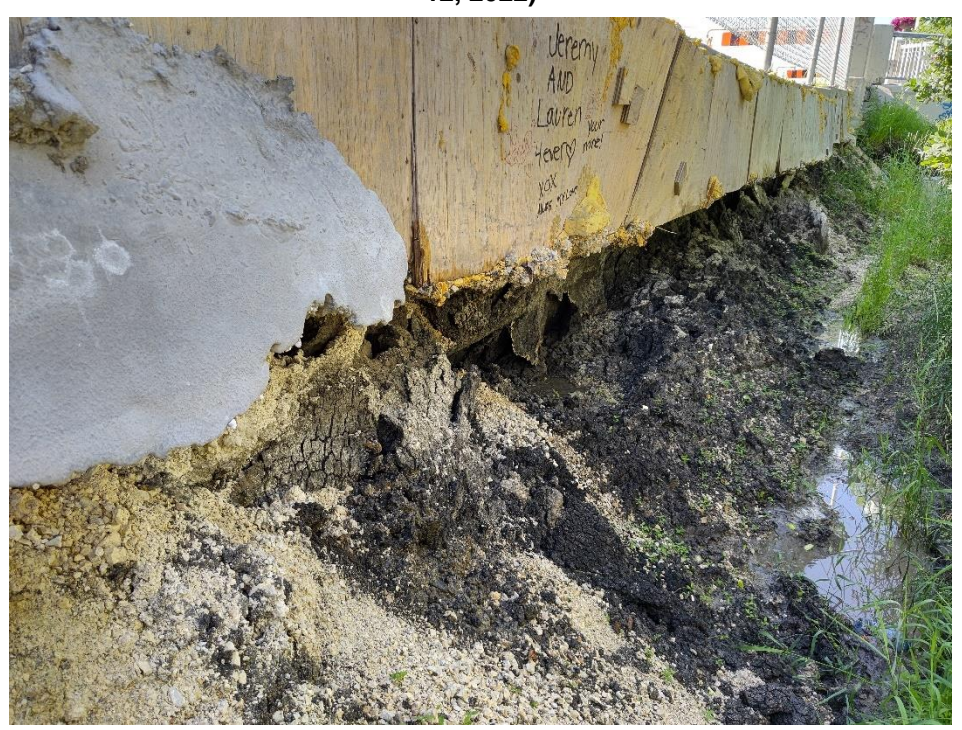
Photo 8: Close-up view of upper bank failure undercutting the sidewalk (July 12, 2022)