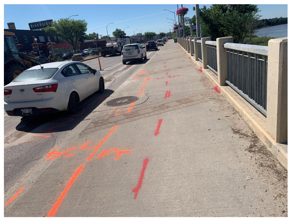
Photo 5: Looking south on St. Mary's. Utilities marked out on sidewalk (July 29, 2022)