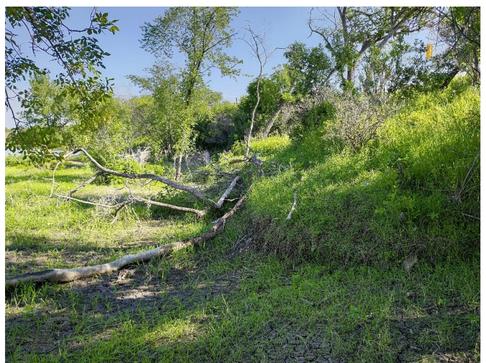
Photo 12: Looking downstream at mid-bank (approx. OHWM) near the middle of the project area (July 12, 2022)