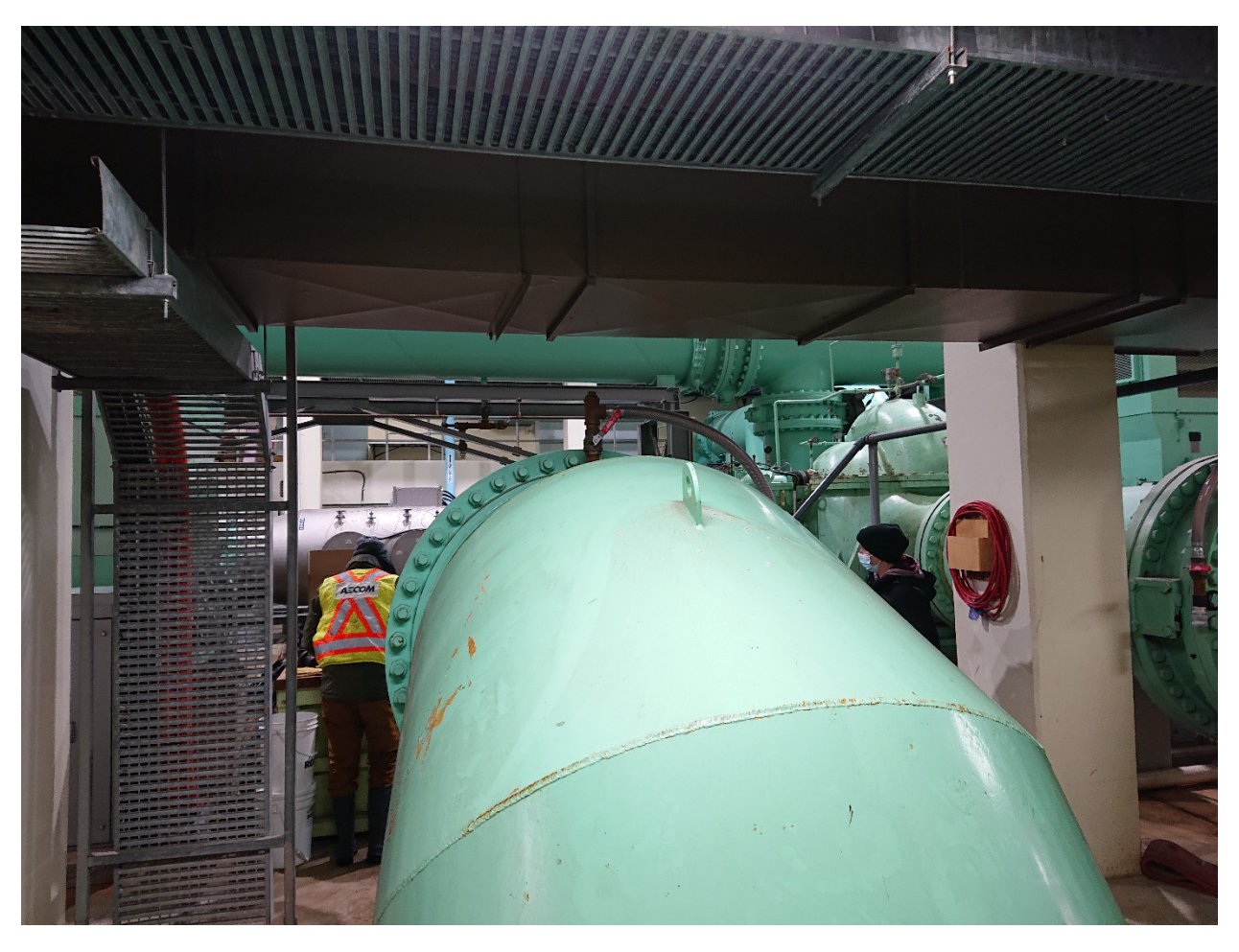
Figure 4: View of Work Area at Pipe Bend Reducer Facing South