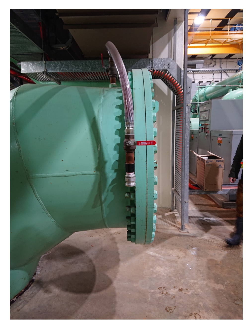
Figure 2: View of Pipe Bend Reducer and Blind Flange to be Removed