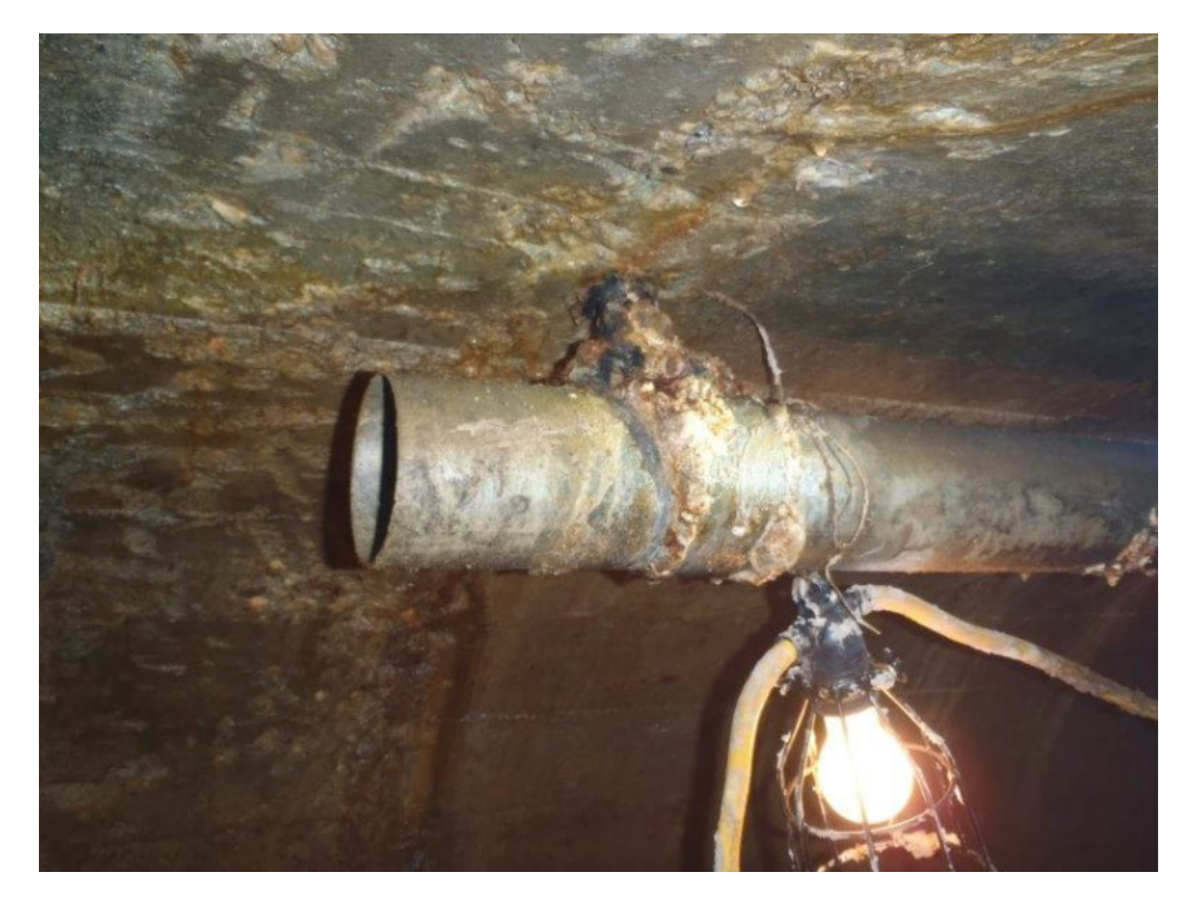
West Side – Existing tunnel ventilation piping (typ)