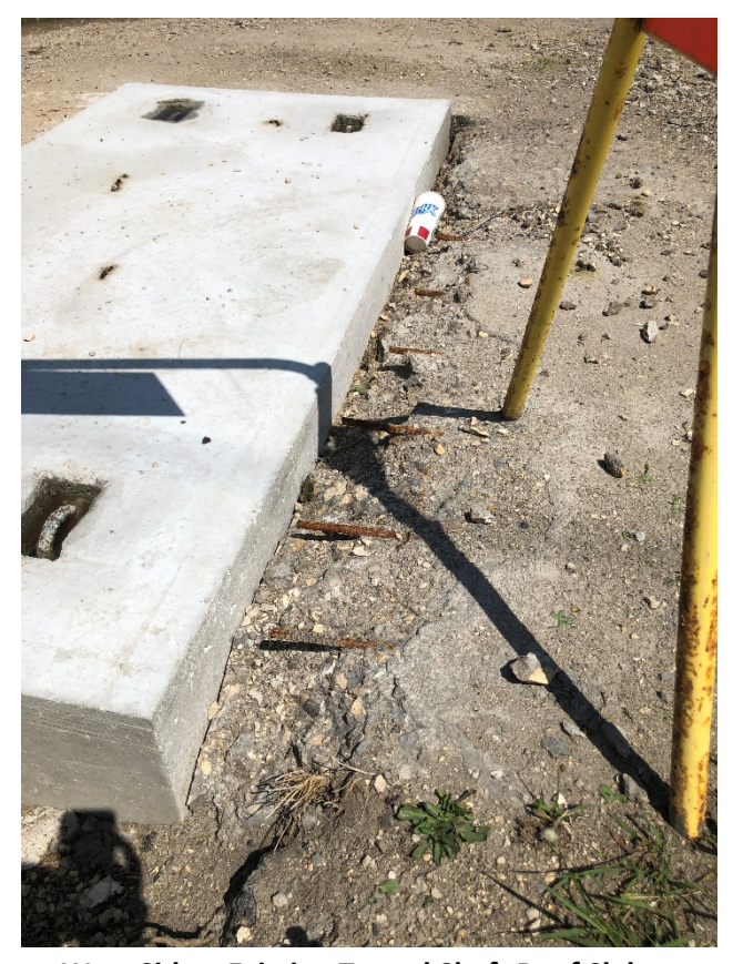
West Side – Existing Tunnel Shaft Roof Slab