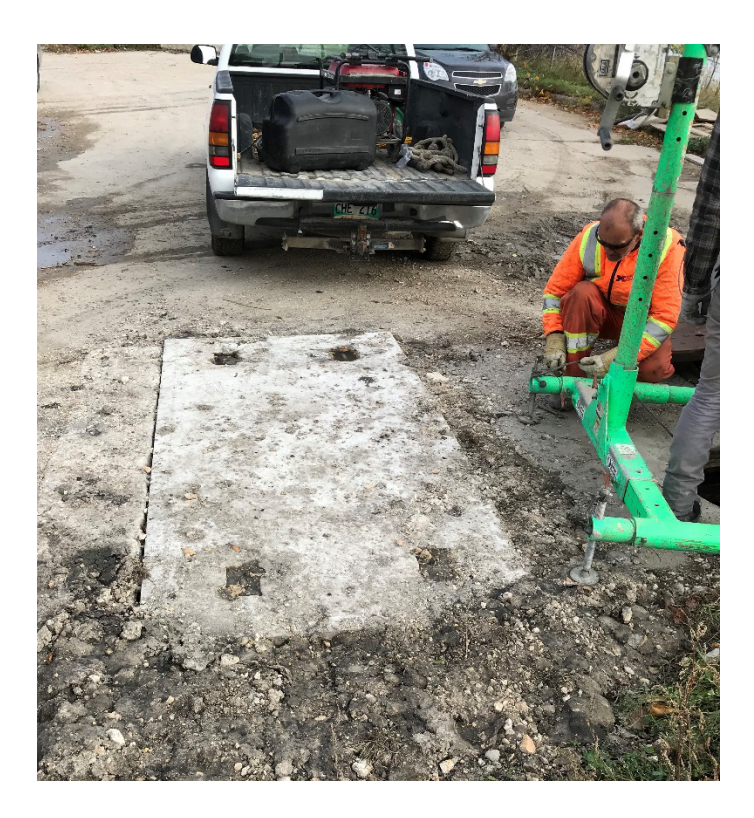
West Side – Existing tunnel shaft removable roof slab