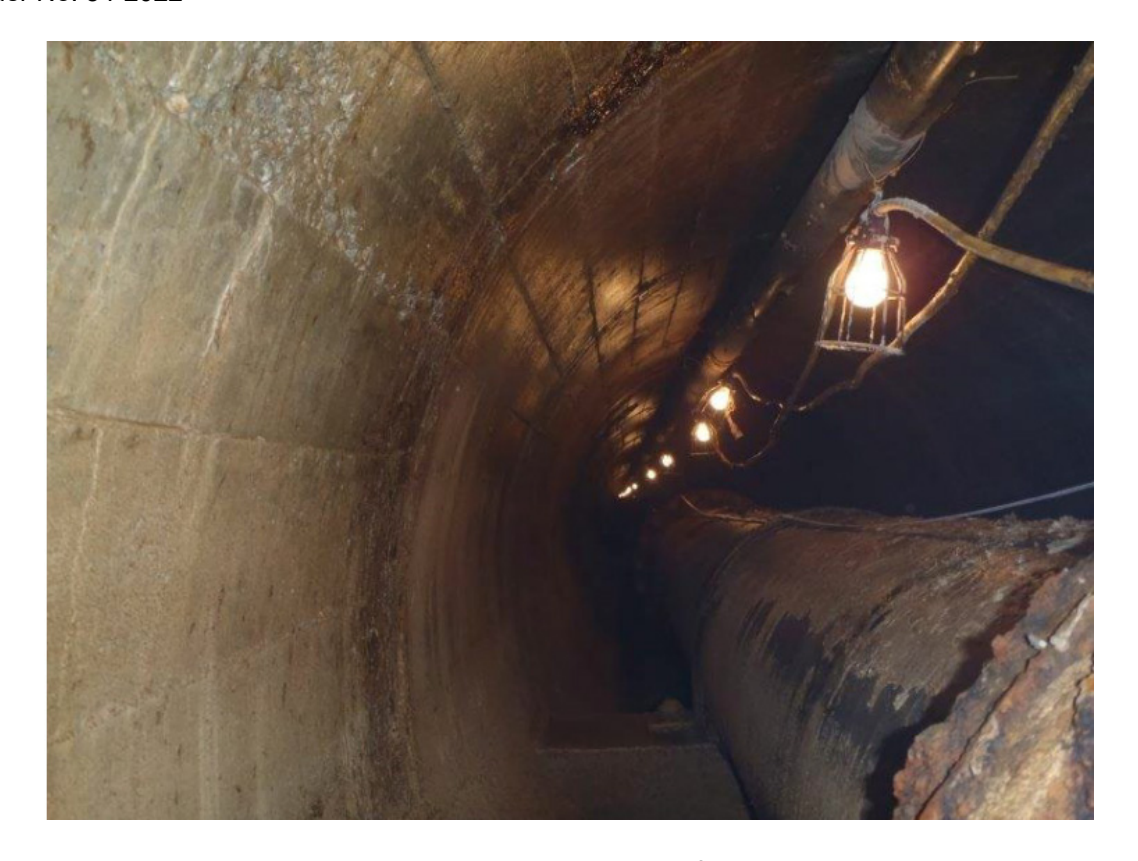
West Side – Tunnel and 600 mm feeder main