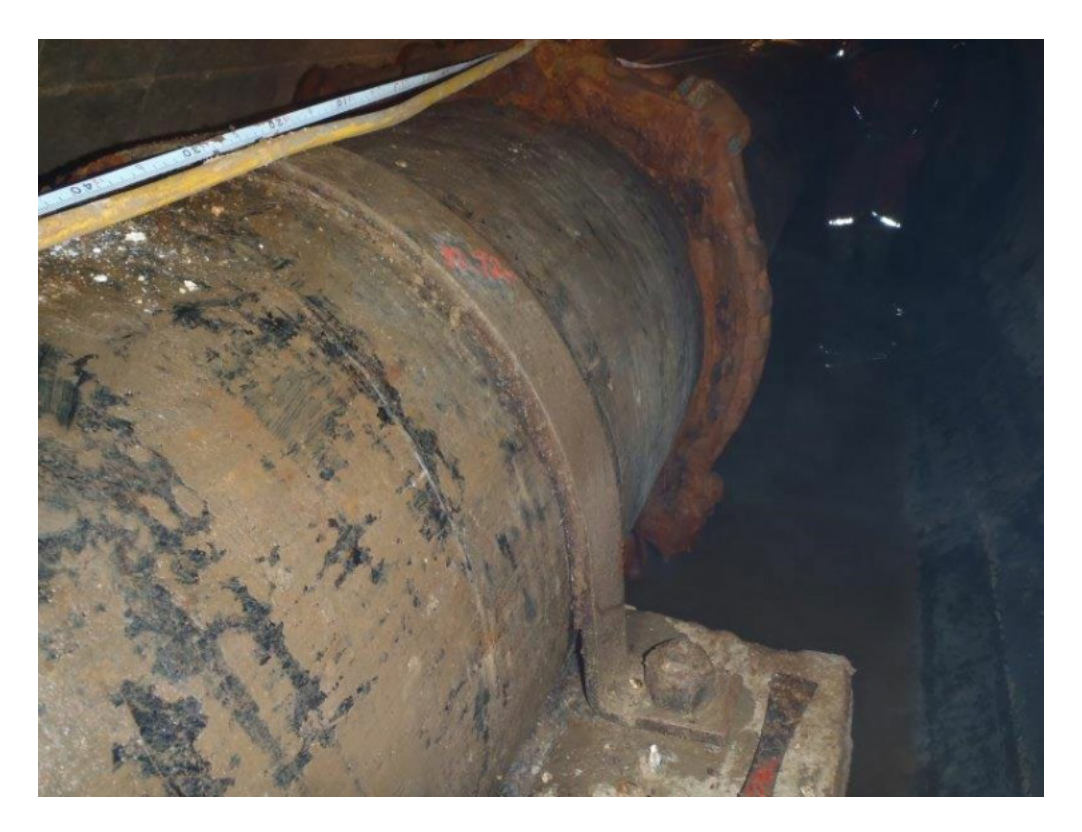
West Side – Existing 600 mm feeder main pipe support (typ)