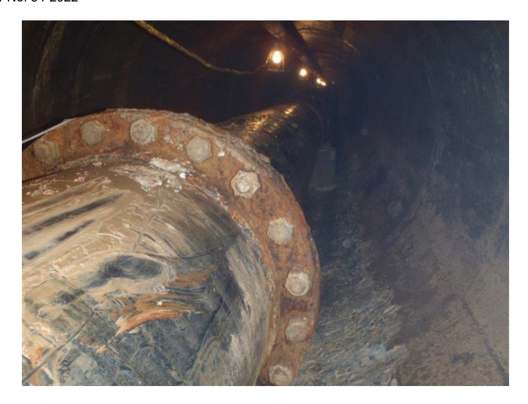
West Side – Existing 600 mm feeder main flanged joint (typ)