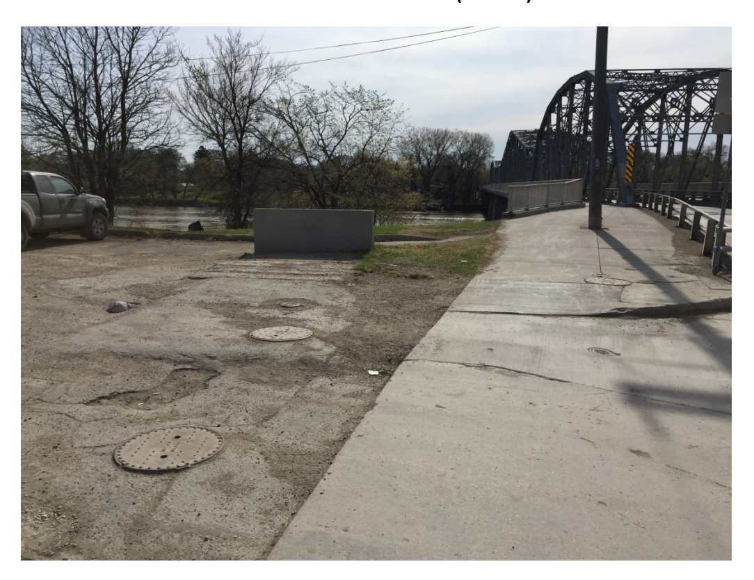
West Side – Existing tunnel shaft and valve chambers