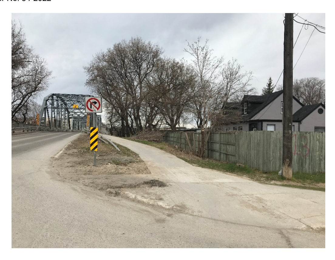
East Side - Looking west towards existing valve chamber