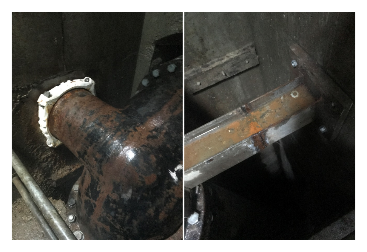
West Side – Existing tunnel shaft - Side-outlet elbow