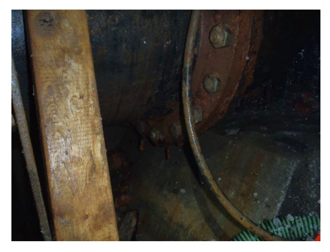
West Side – Existing 600 mm feeder main lower 90 deg bend base block