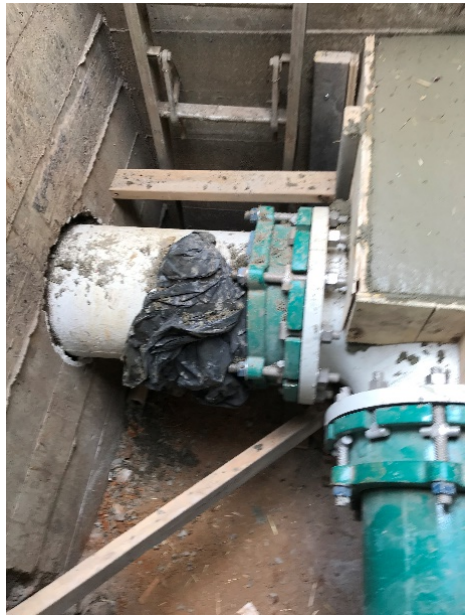
East Side – Existing valve chamber