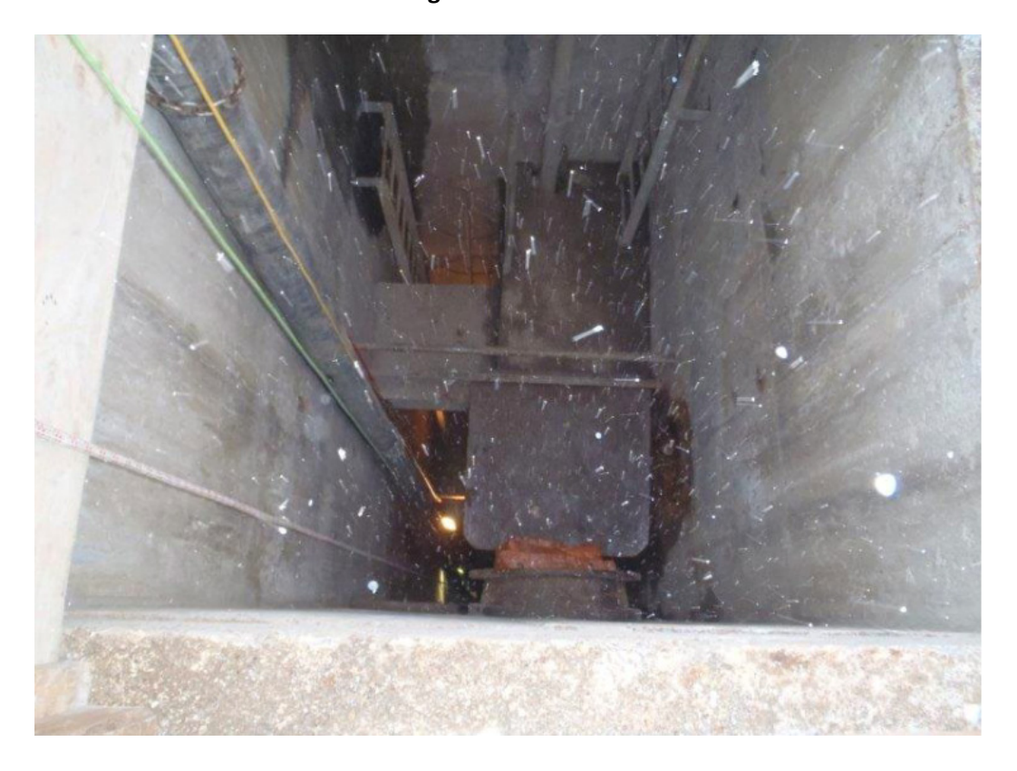
West Side - Existing tunnel shaft