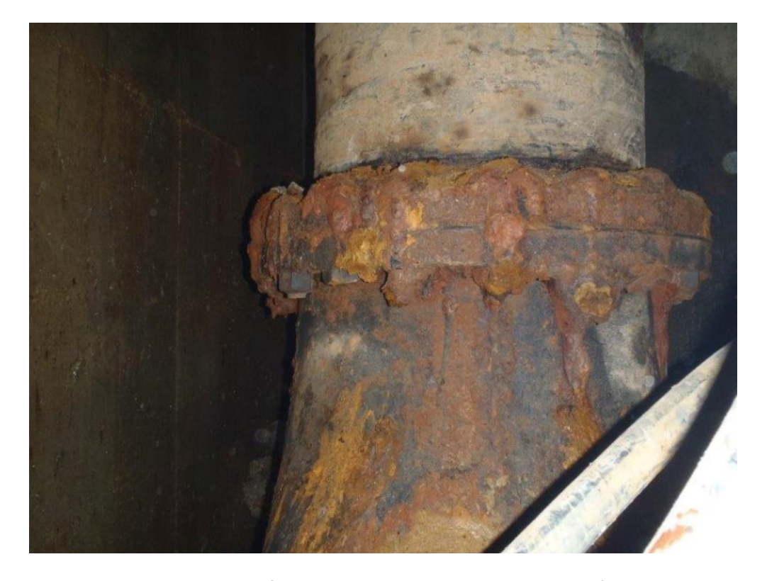
West Side – Existing 600 mm feeder main lower 90 deg bend upper flange connection