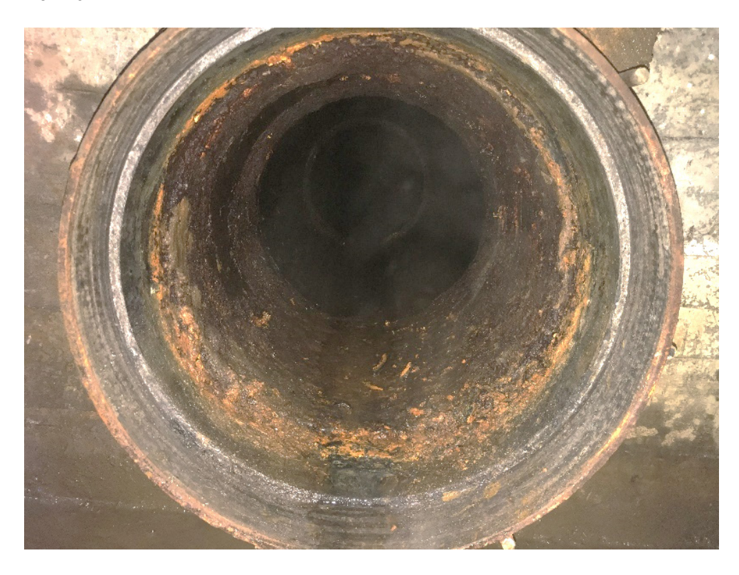
East Side - 600 feeder main (interior)