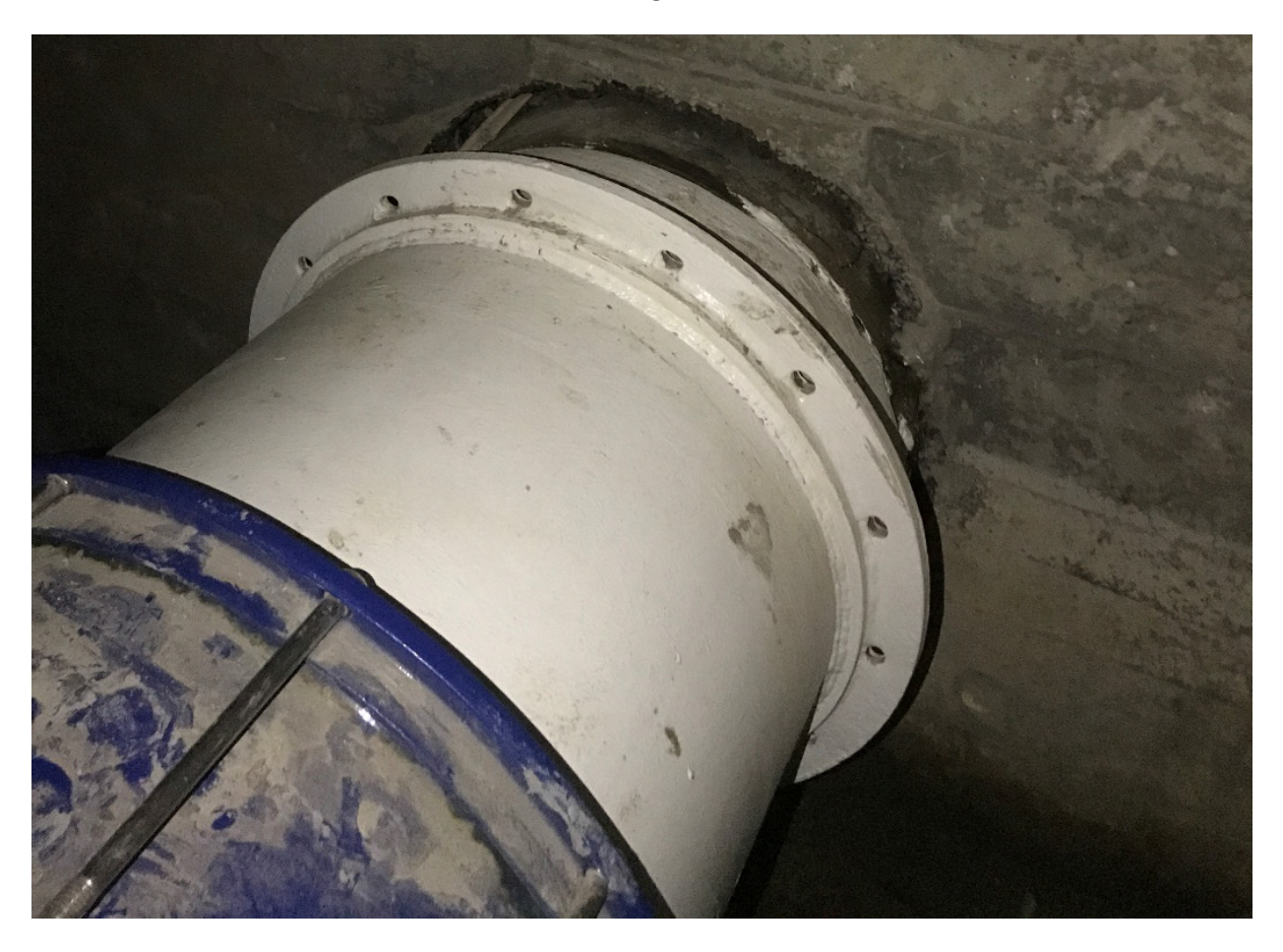
East Side – Existing valve chamber - 600 feeder main (exterior)