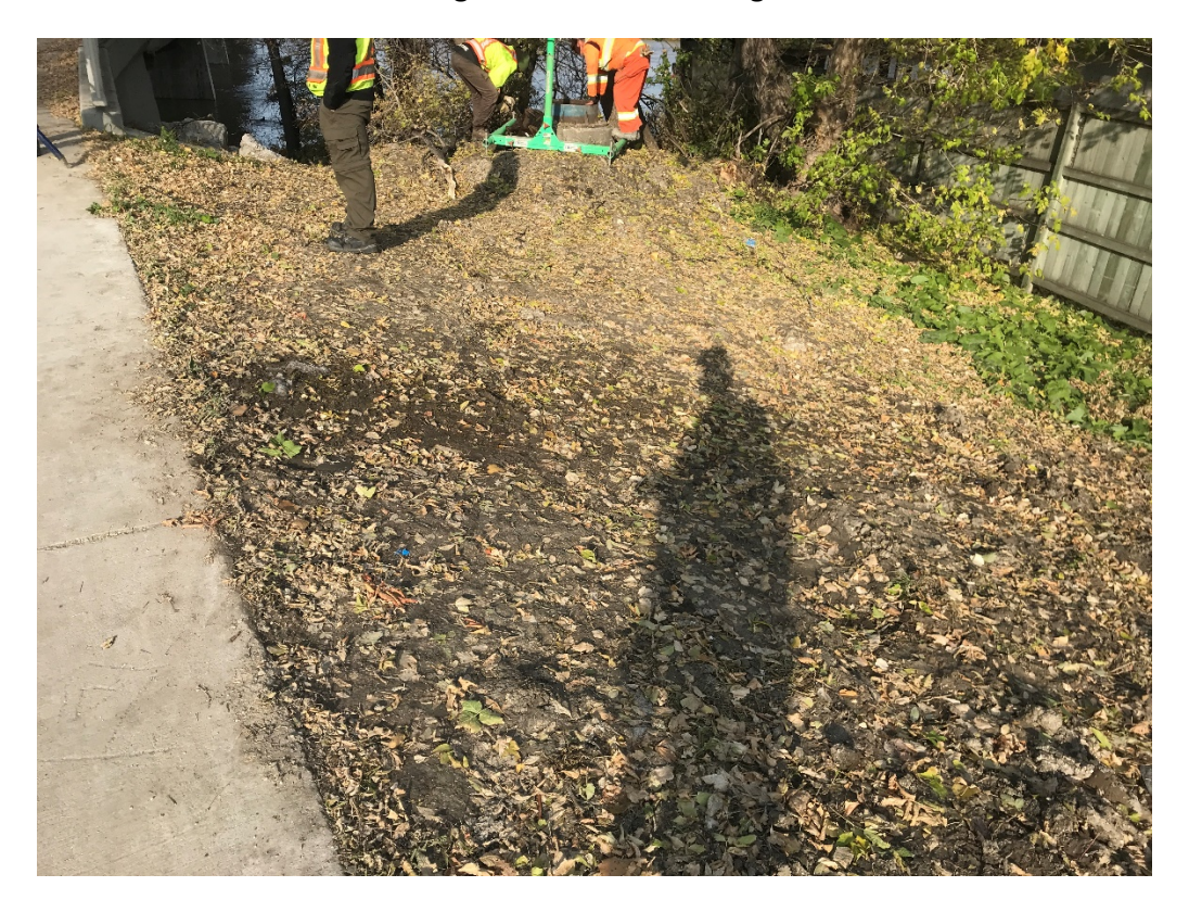
East Side – Existing valve chamber