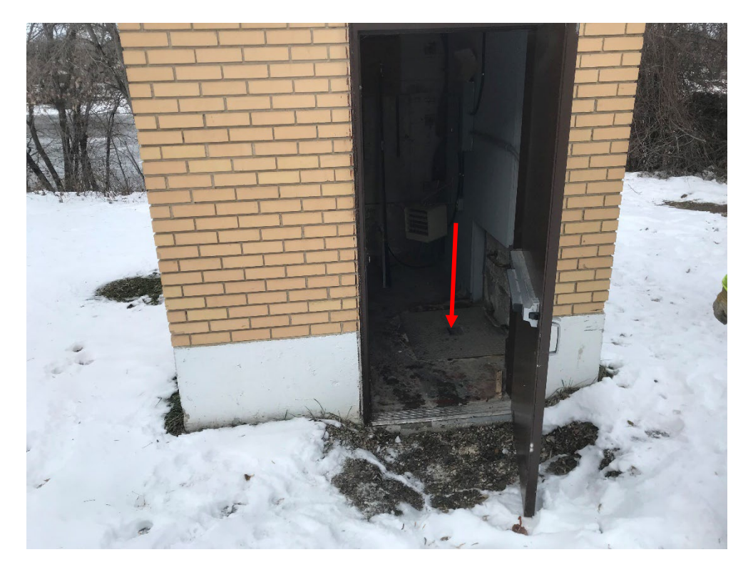
Figure 8 – Access hole to intermediate floor level of upstream siphon chamber.