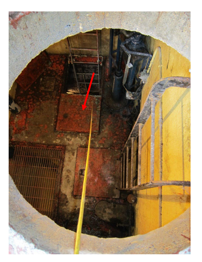
Figure 9 – Access hole in intermediate floor of upstream siphon chamber, looking west from upper level access.