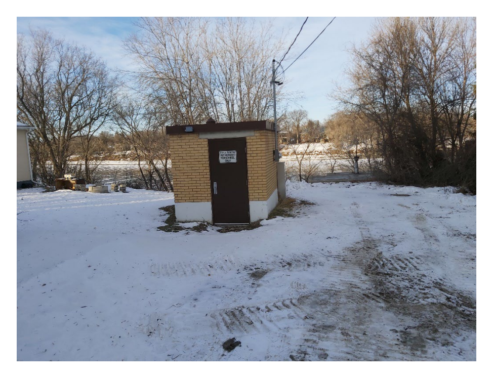
Figure 7 – Upstream siphon chamber and access door, looking west.