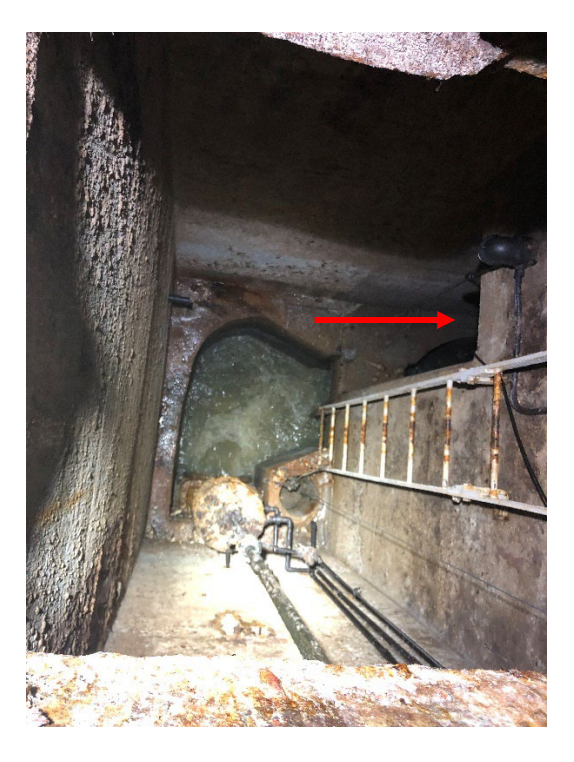
Figure 10 – Lower level access to existing siphons, from intermediate level access hole.

Figure 9 – Access hole in intermediate floor of upstream siphon chamber, looking west from upper level access.