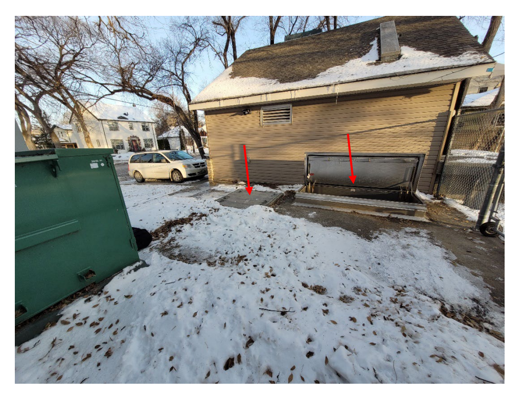
Figure 2 – Downstream siphon chamber access, removeable roof hatch to intermediate floor (left), stair access to intermediate floor (right).