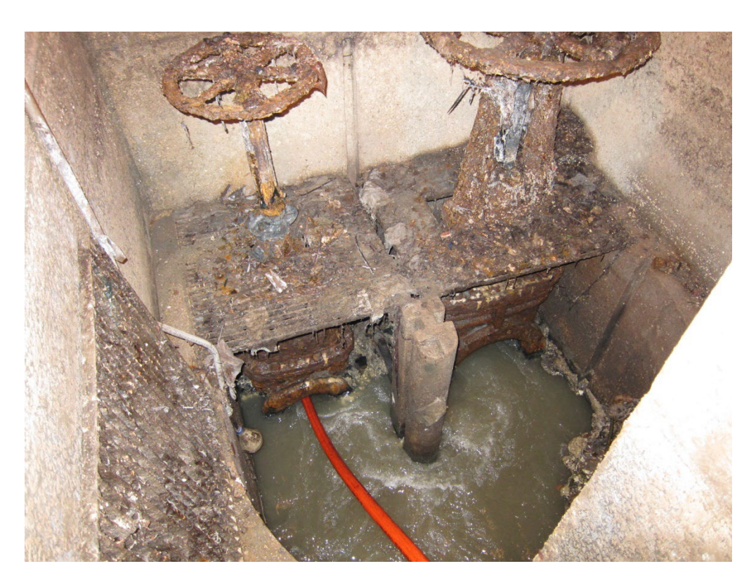
Figure 11 -Upstream siphon inlets, 300 mm siphon on left (to be lined), 450 mm siphon on right.