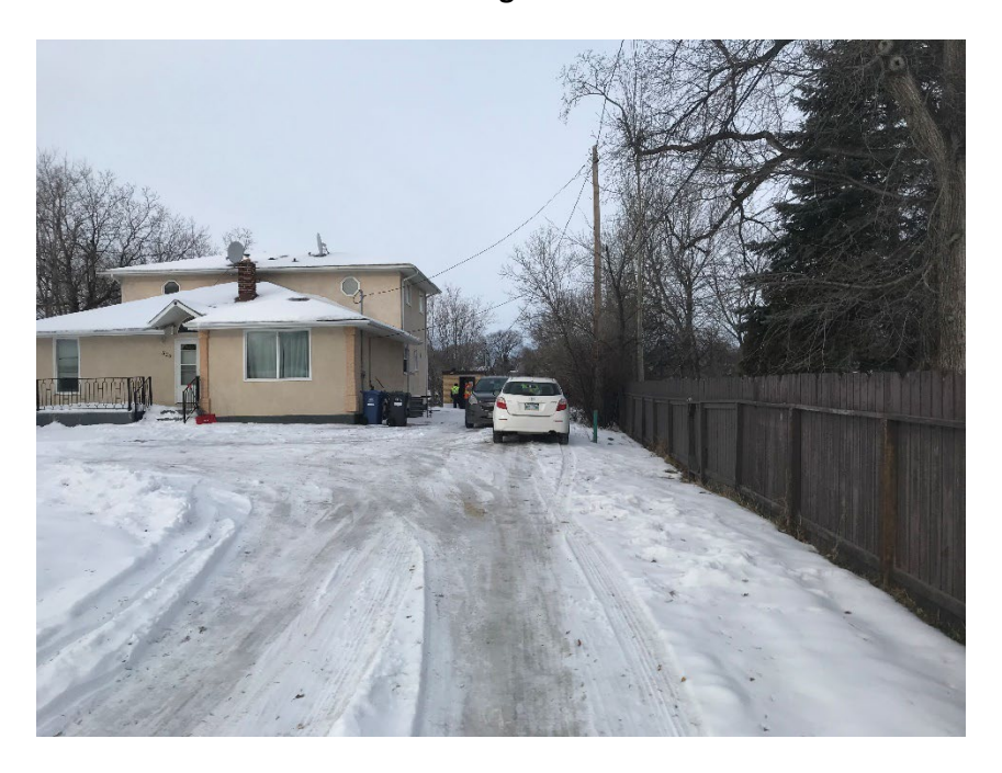
Figure 6 – Shared access approach to upstream siphon chamber, looking west.

Figure 5 – View of lower level and incoming siphon piping from intermediate level floor opening, looking east.