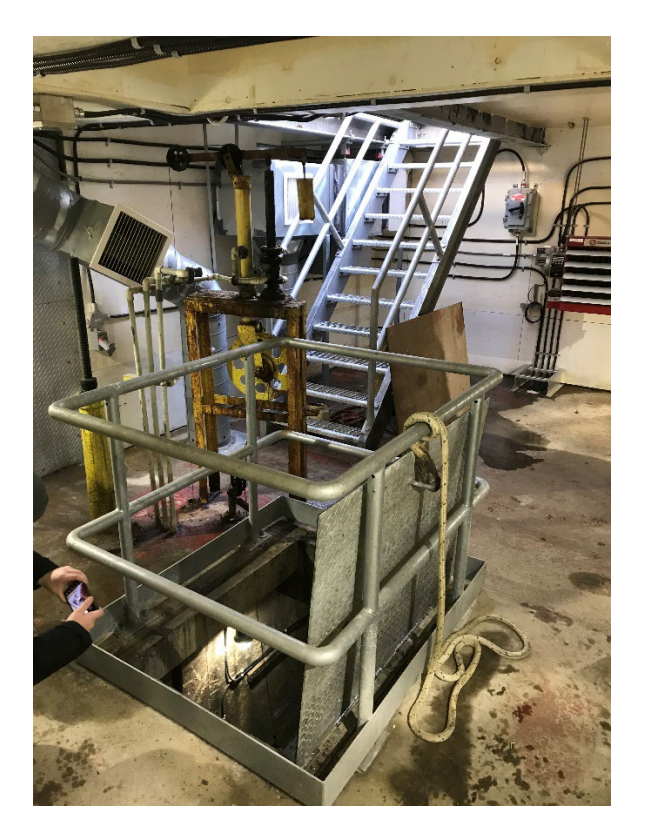
Figure 3 – Downstream siphon chamber at intermediate floor level. Stair access and access hole in intermediate floor.