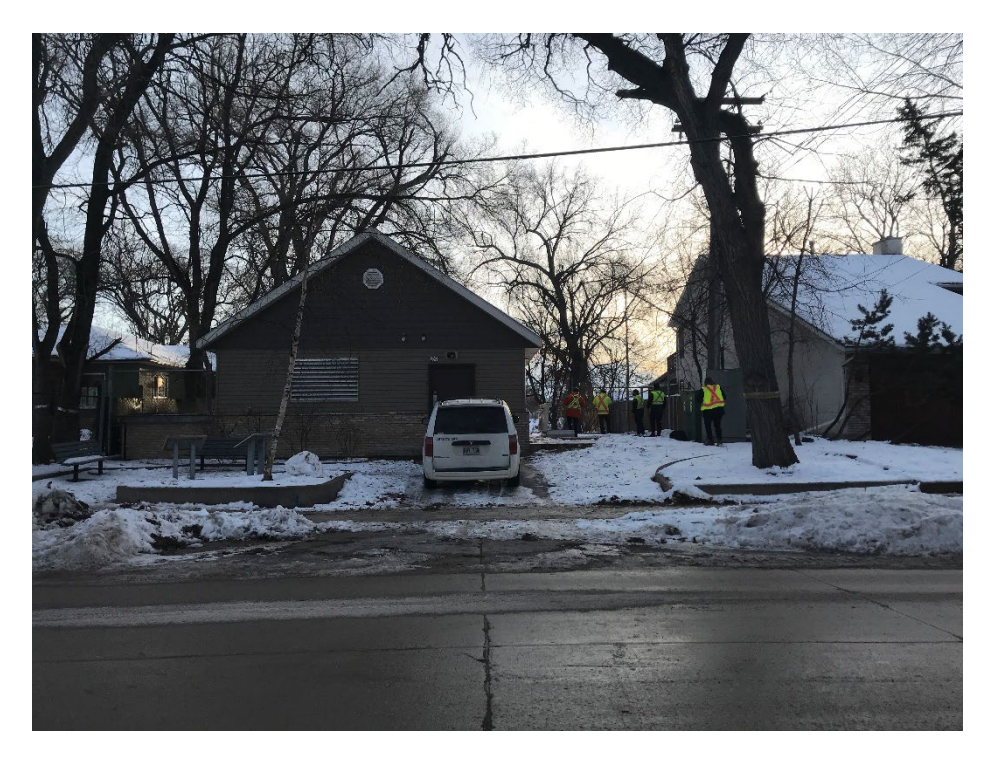
Figure 1 – Polson Flood Pumping Station (FPS) and .Comminutor Station (downstream siphon chamber), looking east.