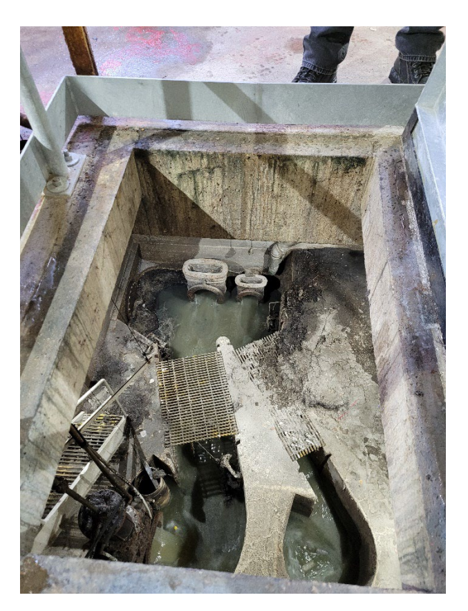
Figure 5 – View of lower level and incoming siphon piping from intermediate level floor opening, looking east.