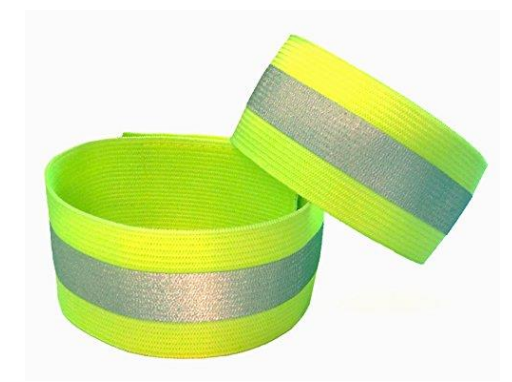
Example of ankle band meeting retroreflective standard