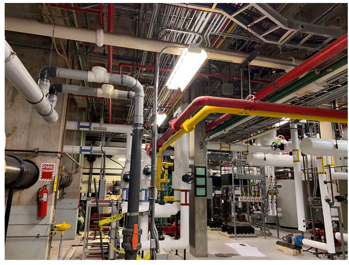
3 BOILER ROOM PHOTO SCALE: NTS

GENERAL NOTES: CONTRACTOR TO SCAN FLOOR SLAB PRIOR TO CUTTING AND CORING. SCAN CONCRETE / WAFFLE SLAB PRIOR TO CORING ANY FLOOR PENETRATIONS TO LOCATE ALL TOP AND BOTTOM REINFORCING STEEL. POSITION OPENING TO AVOID CUTTING OR DAMAGING ANY EXISTING REINFORCING STEEL. CONTRACTOR TO REMOVE AND REINSTALL ANY CONDUIT/PIPING/PLUMBING/HVAC THAT IS IN CONFLICT WITH THE SCOPE OF WORK IN THE BOILER ROOM.