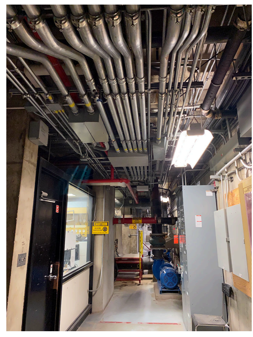
5 BOILER ROOM PHOTO SCALE: NTS

GENERAL NOTES THE BOILER ROOM PLAN, REFLECTED CEILING PLAN, AND PHOTOS ARE SHOWN FOR REFERENCE FOR THE PURPOSE OF COMMUNICATING THE CHALLENGING WORK AREA. ACTUAL MECHANICAL LAYOUTS MAY DIFFER FROM WHAT IS SHOWN ON THESE DRAWINGS. REFER TO MECHANICAL FOR SCOPE OF DEMOLITION AND RENOVATION.