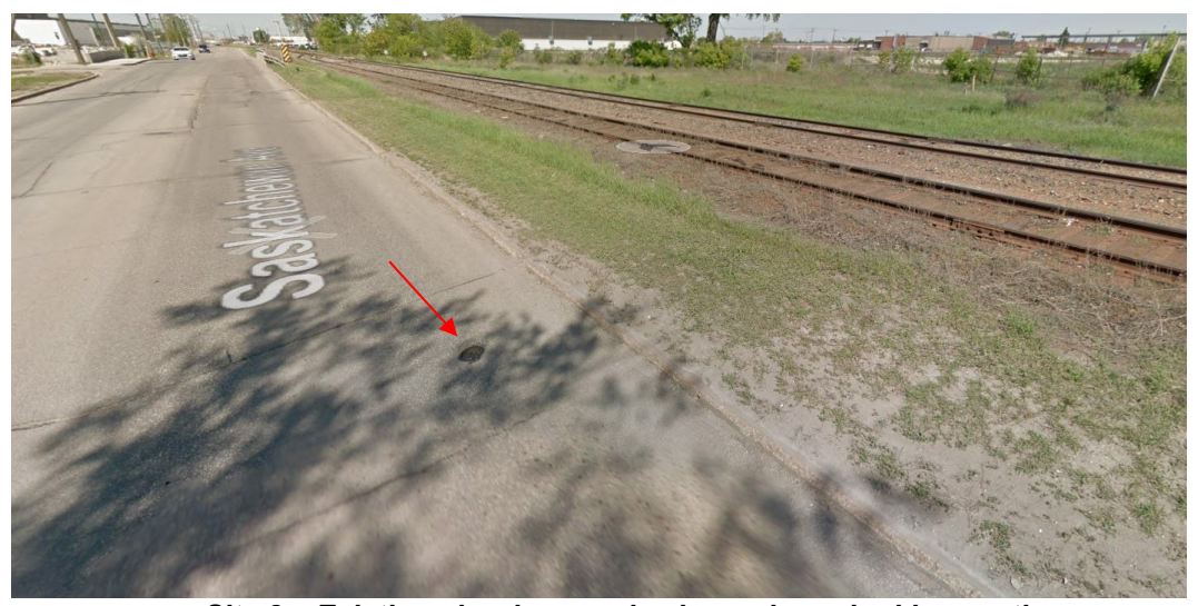
Site 8 - Existing air release valve in roadway, looking north.