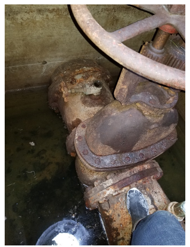
Site 10 – Existing 50 mm air valve in south chamber, looking north.