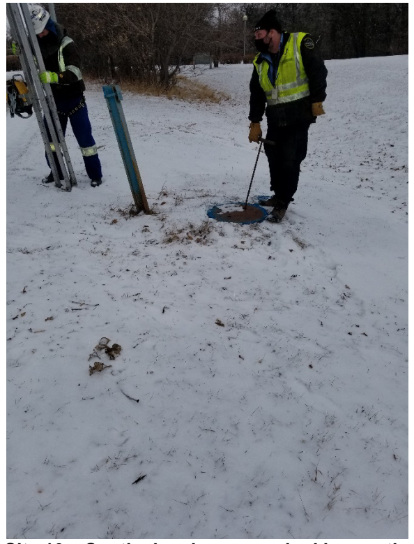
Site 10 – South chamber cover, looking north.