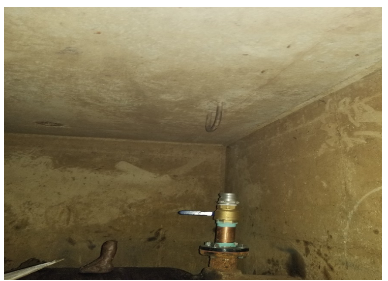
Site 11 – Existing 50 mm air valve and roof slab in chamber located west of McPhillips Street.