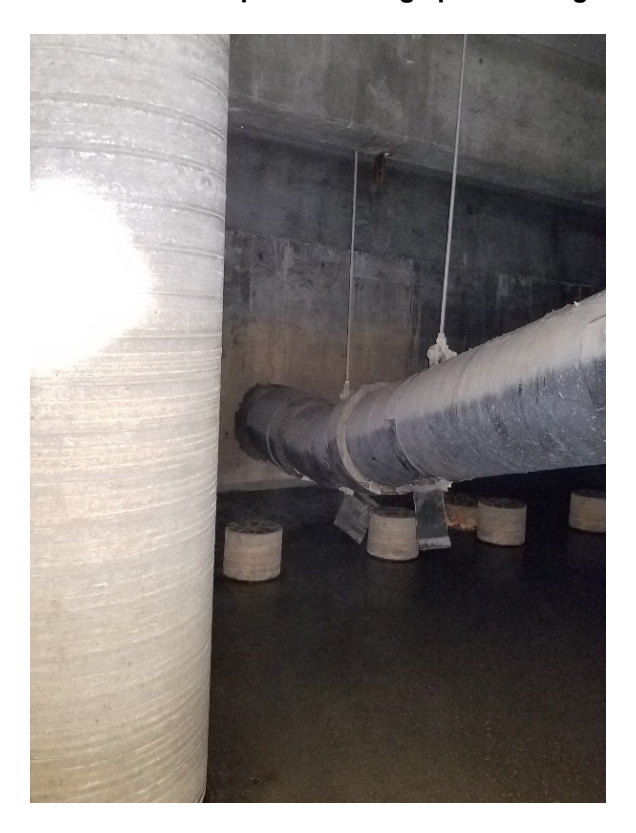
Site 3 – North abutment looking northeast, wall penetration, elbow, couplers, expansion joint, and hanger supports.