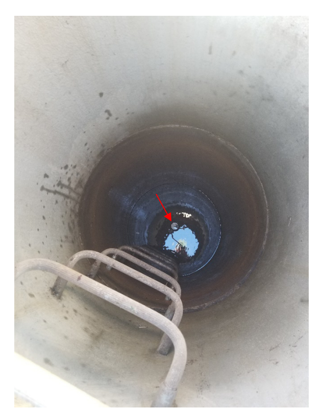
Site 9 - Existing air release valve in existing 750 manhole, looking south.