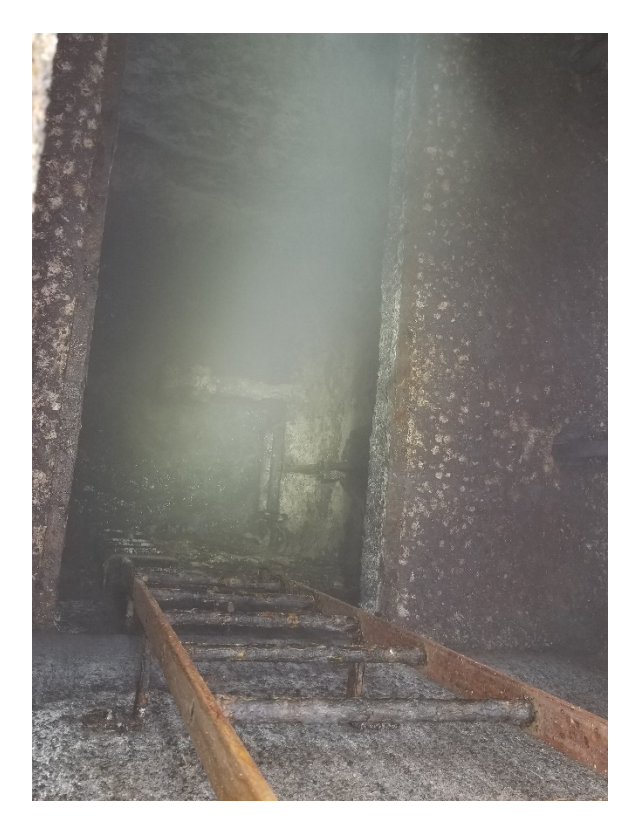
Site 4 – Inlet chamber south access ladder looking north.