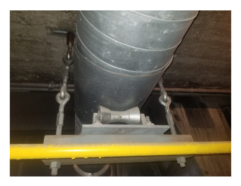
Site 2 – East abutment looking west, pipe roller support.