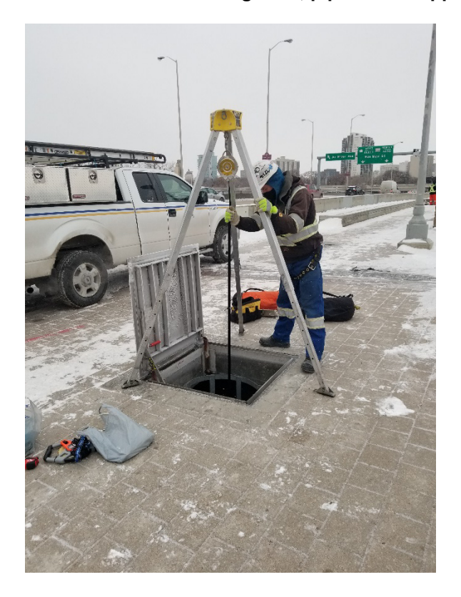
Site 3 – Typical sidewalk access hatch.