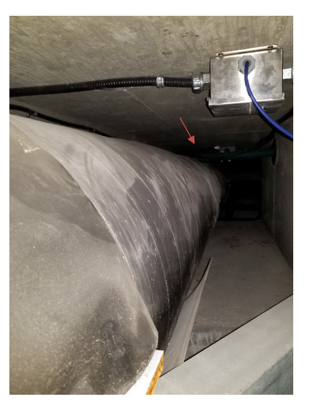
Site 3 – Air release tap within bridge pier looking west.