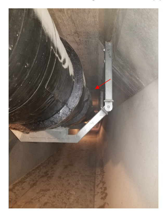
Site 1 – 500 mm FRM, expansion joint in box girder.