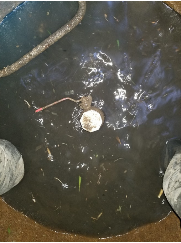
Site 9 – Existing air release valve in existing 750 manhole.