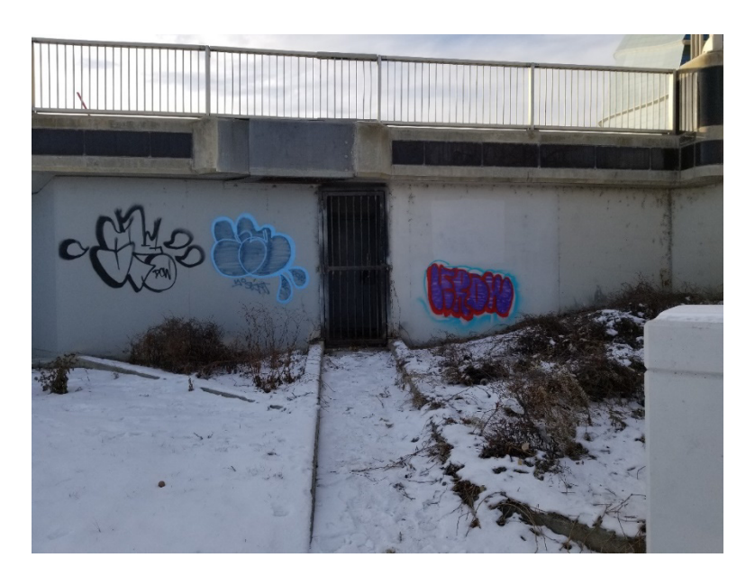
Site 2 – West abutment access door looking south.