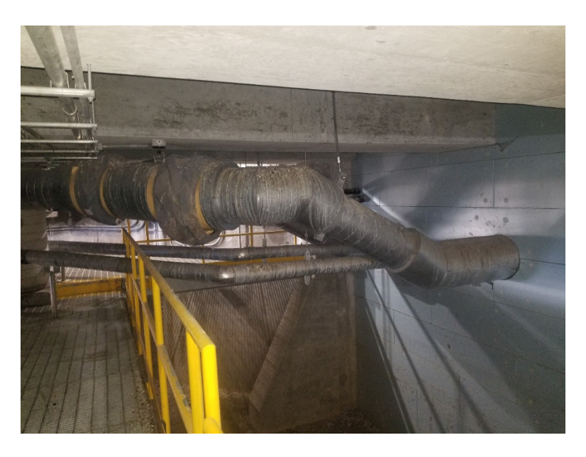
Site 2 – West abutment piping looking south, expansion joints, pipe hanger, and welded joints.