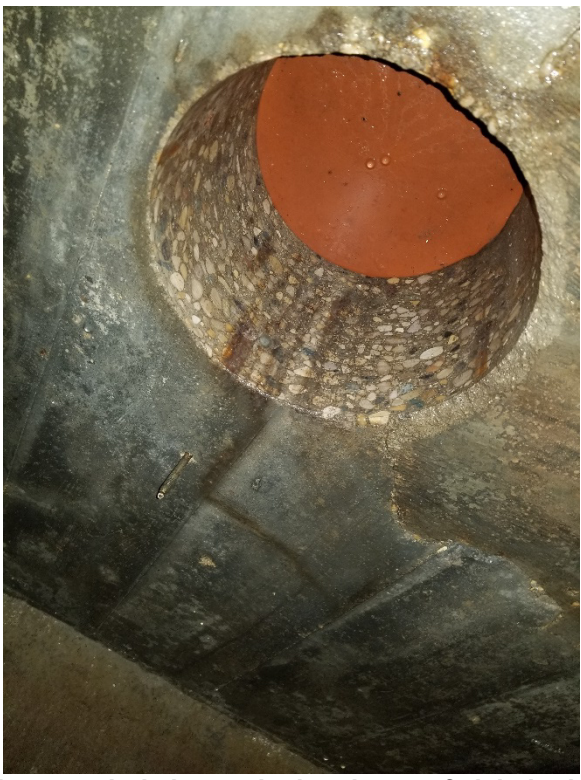
Site 10 - Existing core hole in south chamber roof slab, looking north.