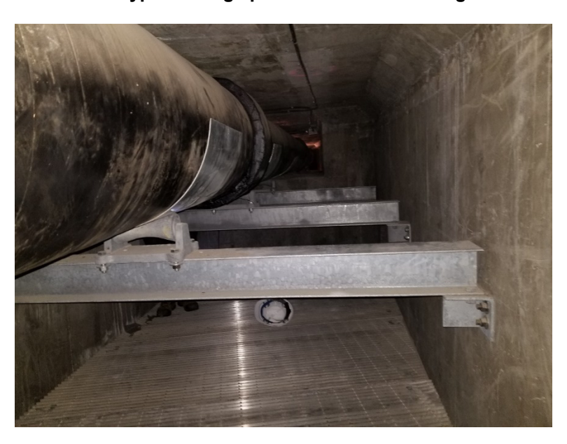
Site 3 – Force main piping and typical inspection platform at bridge piers.