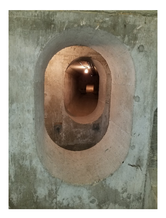
Site 3 – Typical bridge pier access hole looking west.