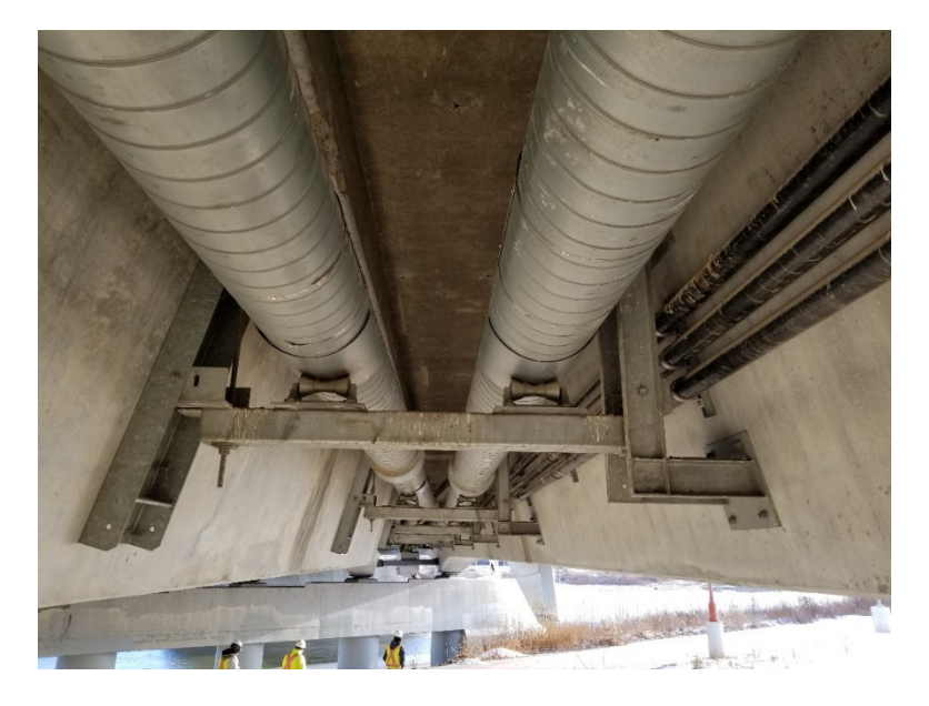
Site 2 – West river bank looking east.