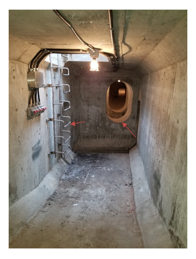
Site 3 – Hatch access girder looking west, pier access hole (west), bridge girder access hole (south).