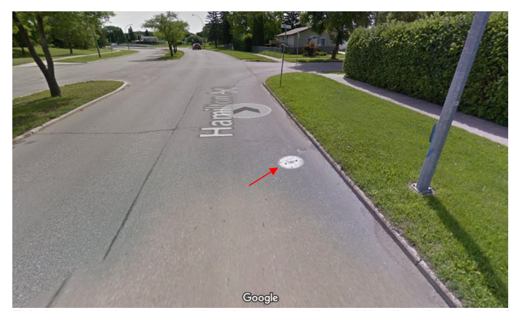
Site 7 – Existing manhole cover to valve chamber, eastbound Hamilton Avenue looking east.