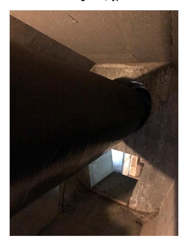
Site 1 – 500 mm FRM at south abutment wall, typical access hole in box girders.