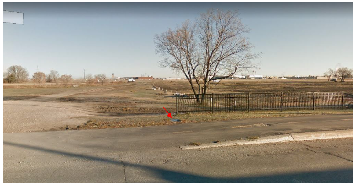
Site 9 – 750 manhole lid to air release valve, looking north from Silver Avenue.