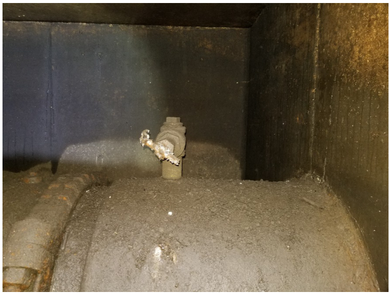
Site 7 – Existing West 50 mm Gate Valve, looking South from bottom of ladder.