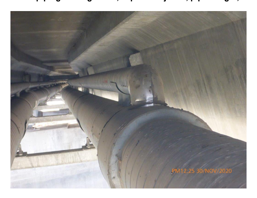
Site 2 – Air release connection at mid span of bridge, looking west.