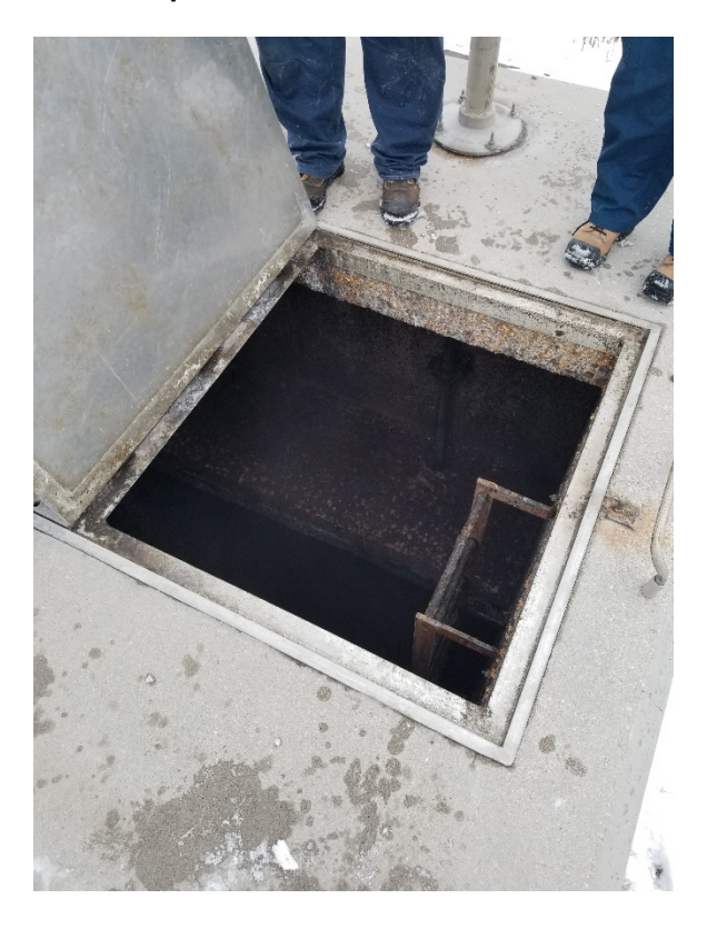
Site 4 – Inlet chamber south access panel looking northeast.