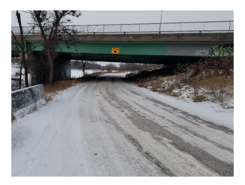
Site 5 – Bridge overpass on Oxbow Bend Rd, looking west.