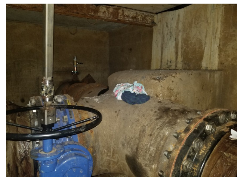
Site 11 – General layout of chamber, looking northwest.