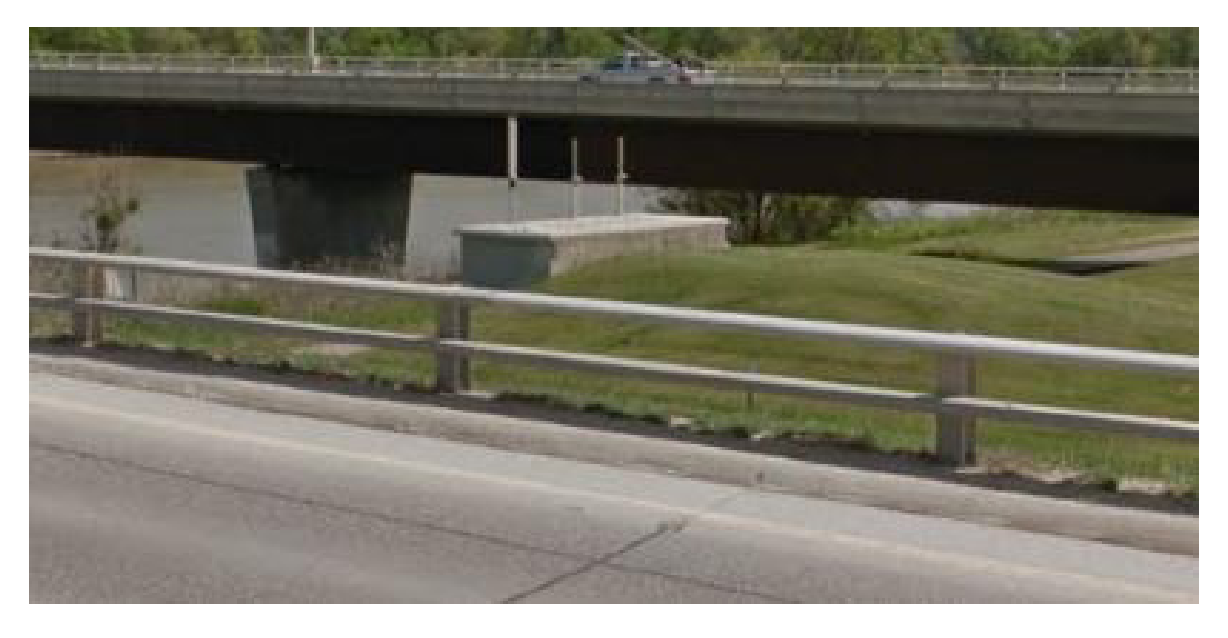
Site 4 – Siphon Inlet and Overflow Structure on West Bank.