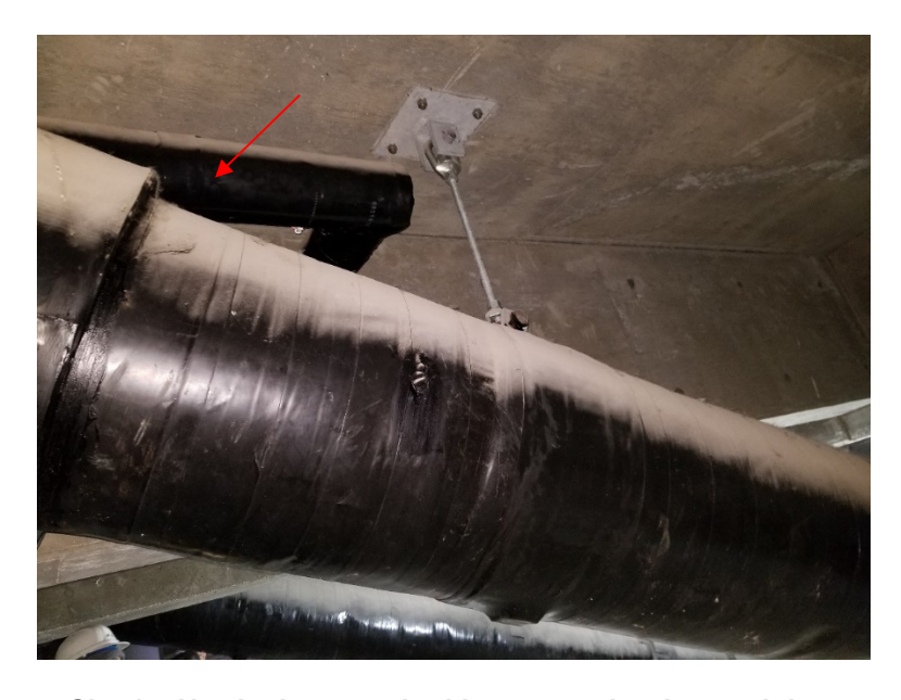
Site 1 – North abutment looking west, air release piping.