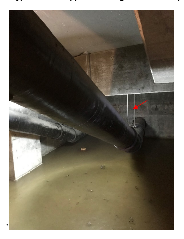
Site 1 – South abutment chamber looking south, wall penetration, hanger supports, elbow and couplers.