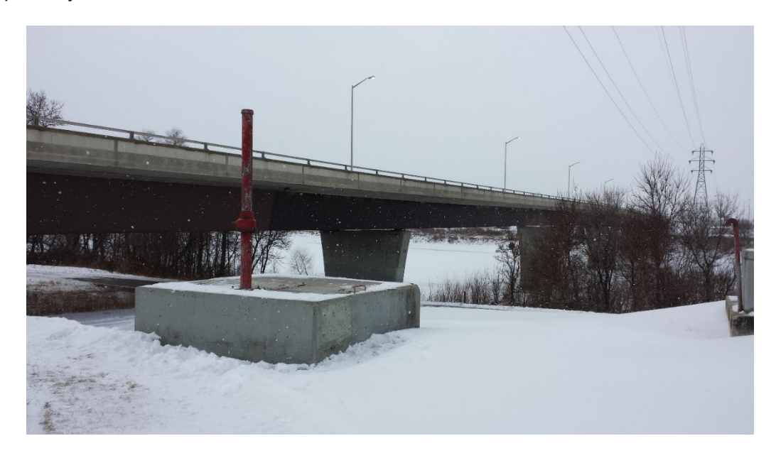
Site 4 – Siphon Outlet Chamber on East Bank.