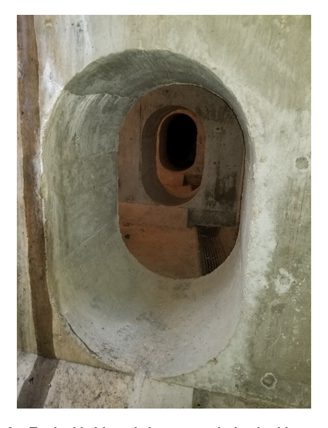
Site 3 – Typical bridge girder access holes looking south.