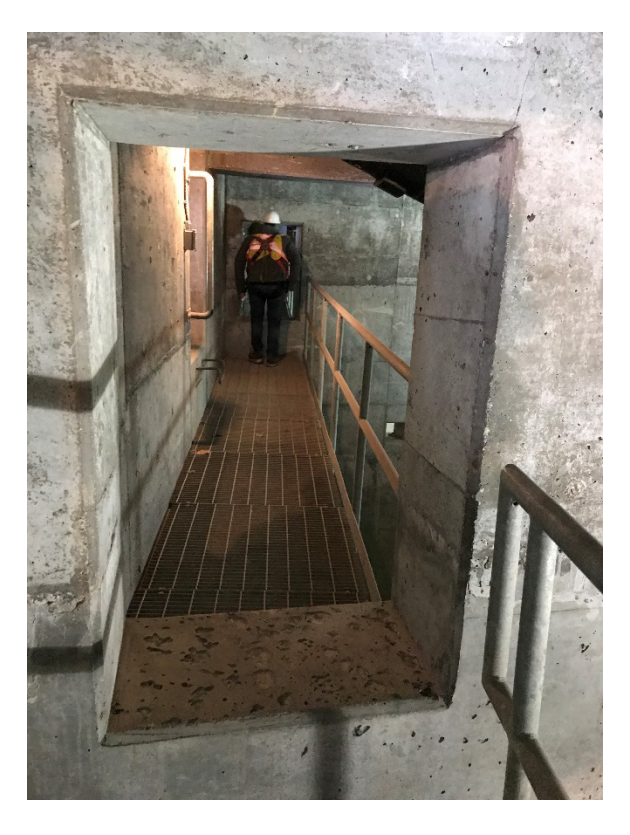
Site 1 – North abutment looking west, typical abutment access hole.