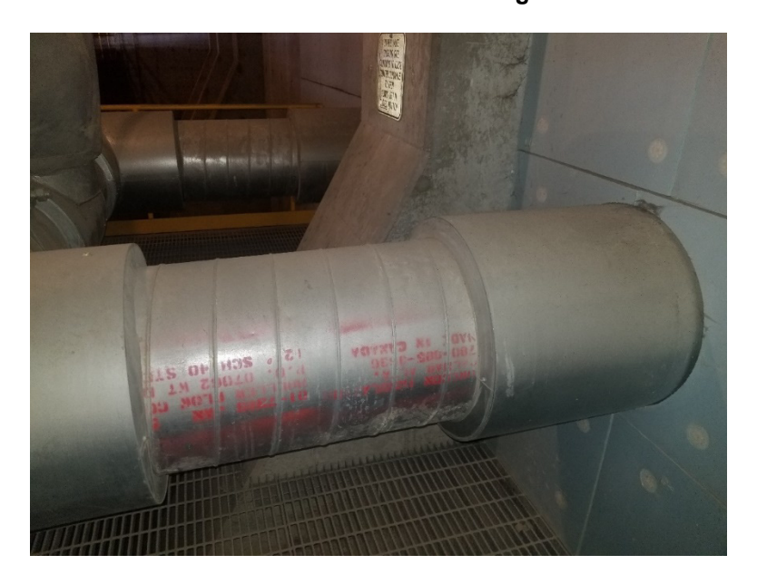
Site 2 – East abutment looking north, pipe wall penetrations.