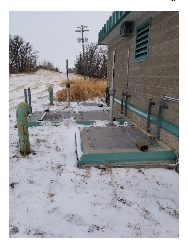
Site 5 – Wet wells at pumping station, looking north.