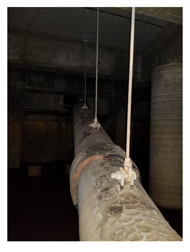
Site 3 – North abutment piping looking east.