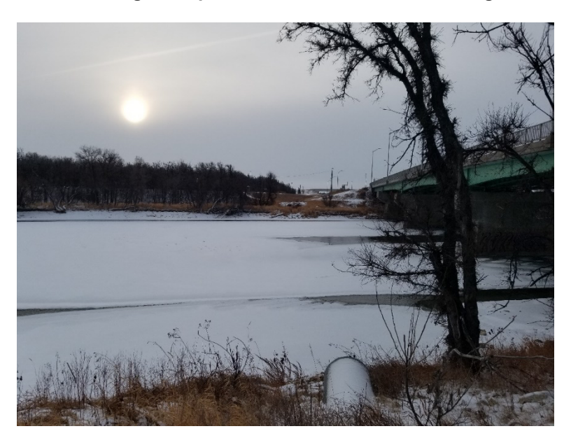
Site 5 - North bank looking south.