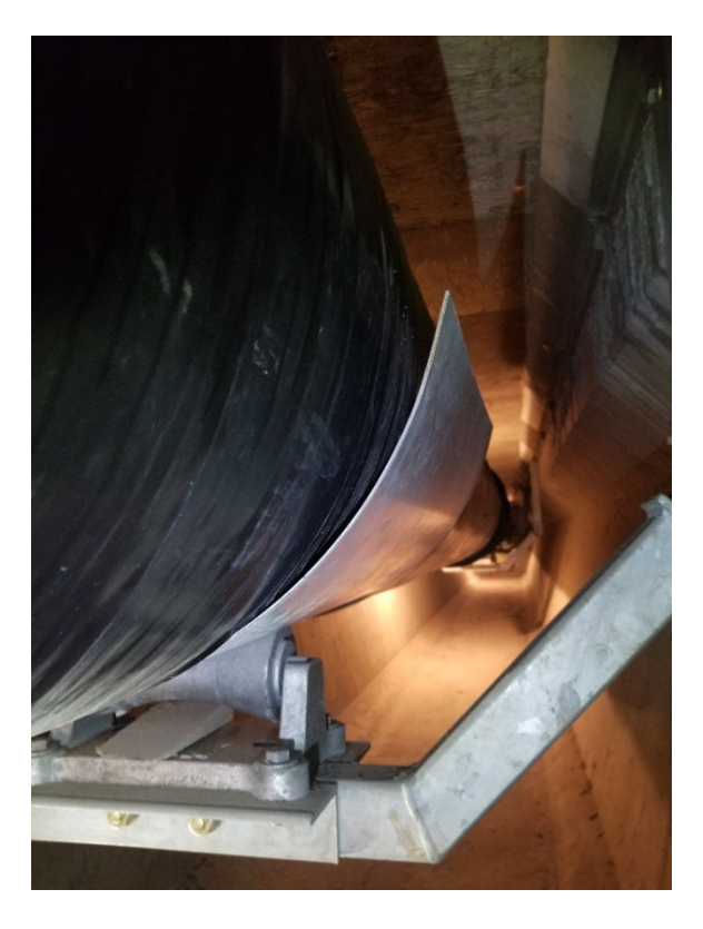
Site 1 – Typical roller support and weight distribution plate.