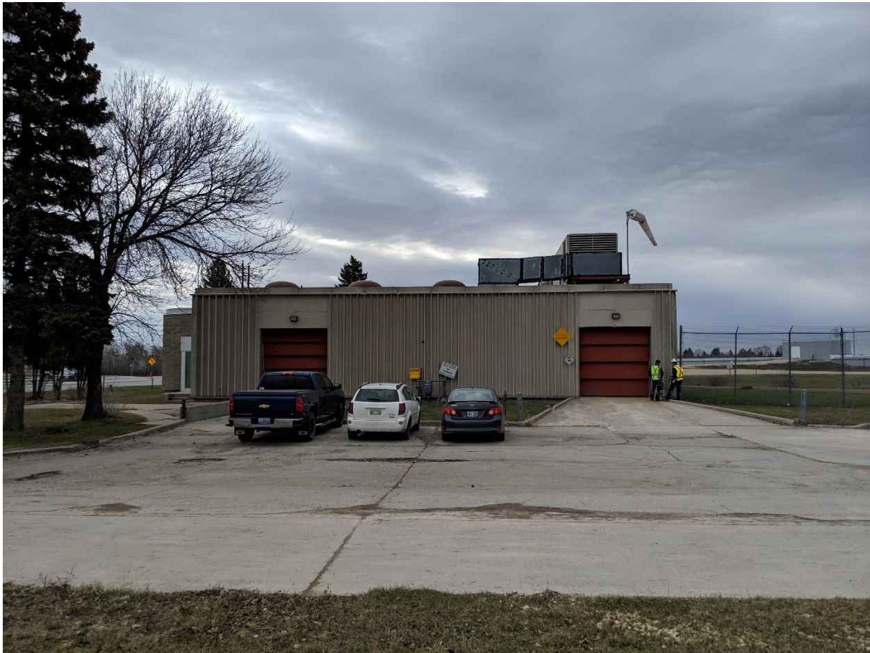
PHOTOGRAPH 2: Facing east showing the Hurst Pumping Station west elevation. The overhead door to the truck loading platform is shown on the left and the overhead door to the Chlorine Storage Area is shown on the right.