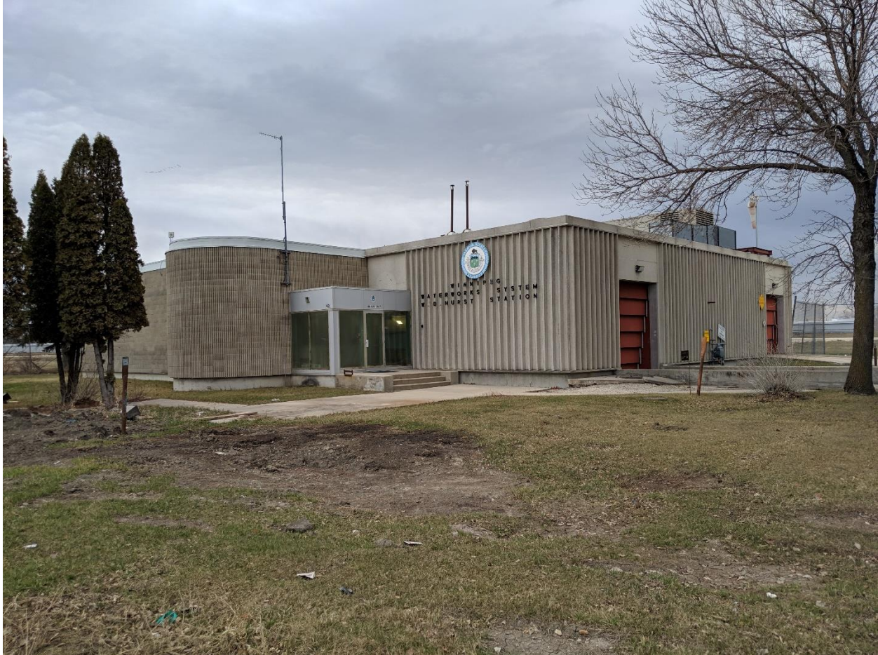
PHOTOGRAPH 1: Facing south-east showing the front entrance of the Hurst Pumping Station.