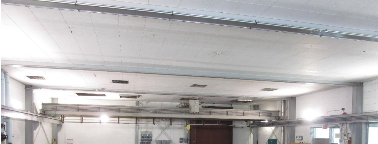
PHOTOGRAPH 9: Facing west showing the existing crane above the pump floor within the Hurst Pumping Station. The existing overhead door for the truck loading platform is shown in the bottom of the photograph.