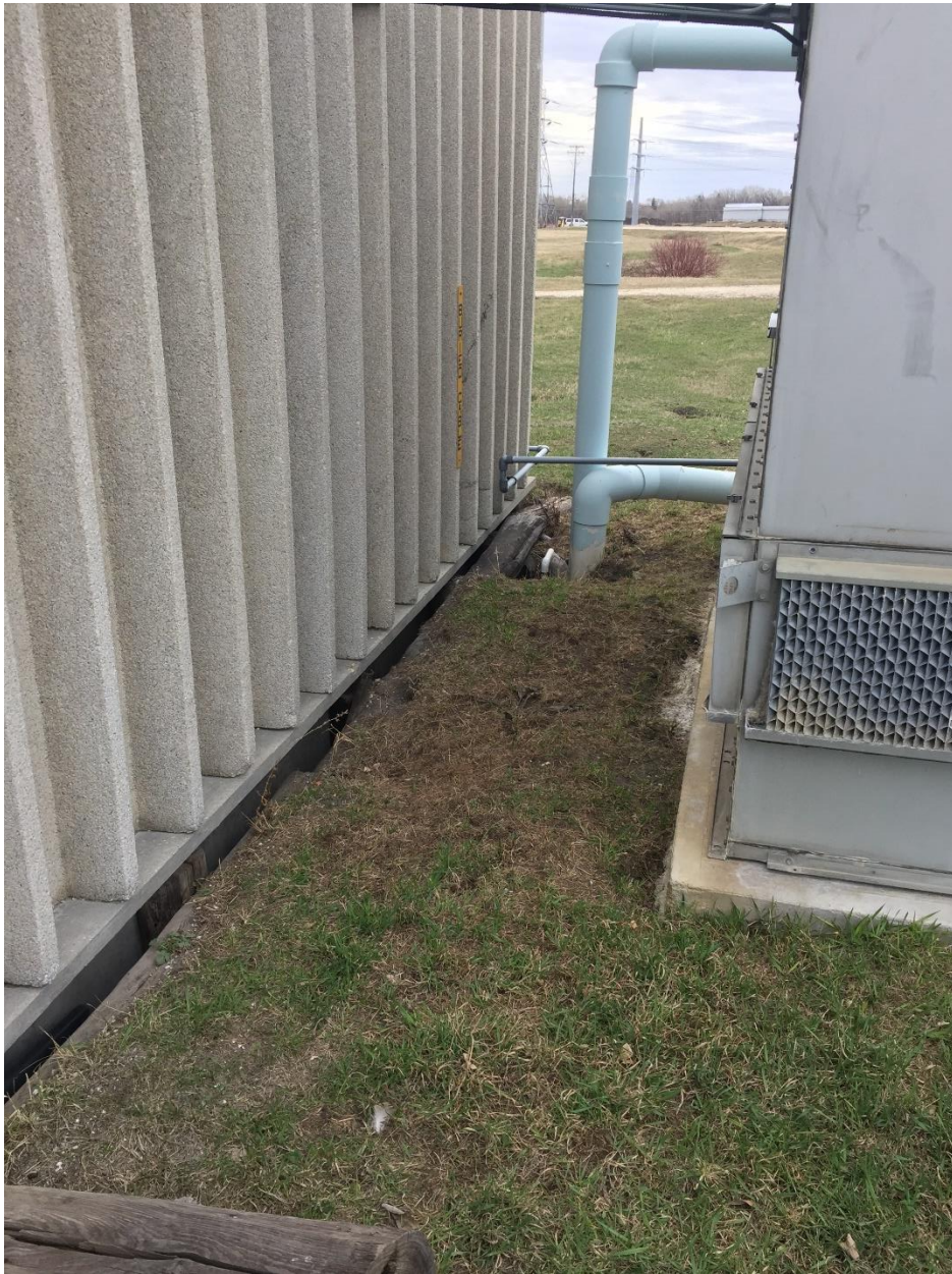
PHOTOGRAPH 21: Facing east showing the exposed, above ground piping associated with the existing cooling tower for the Hurst Pumping Station.