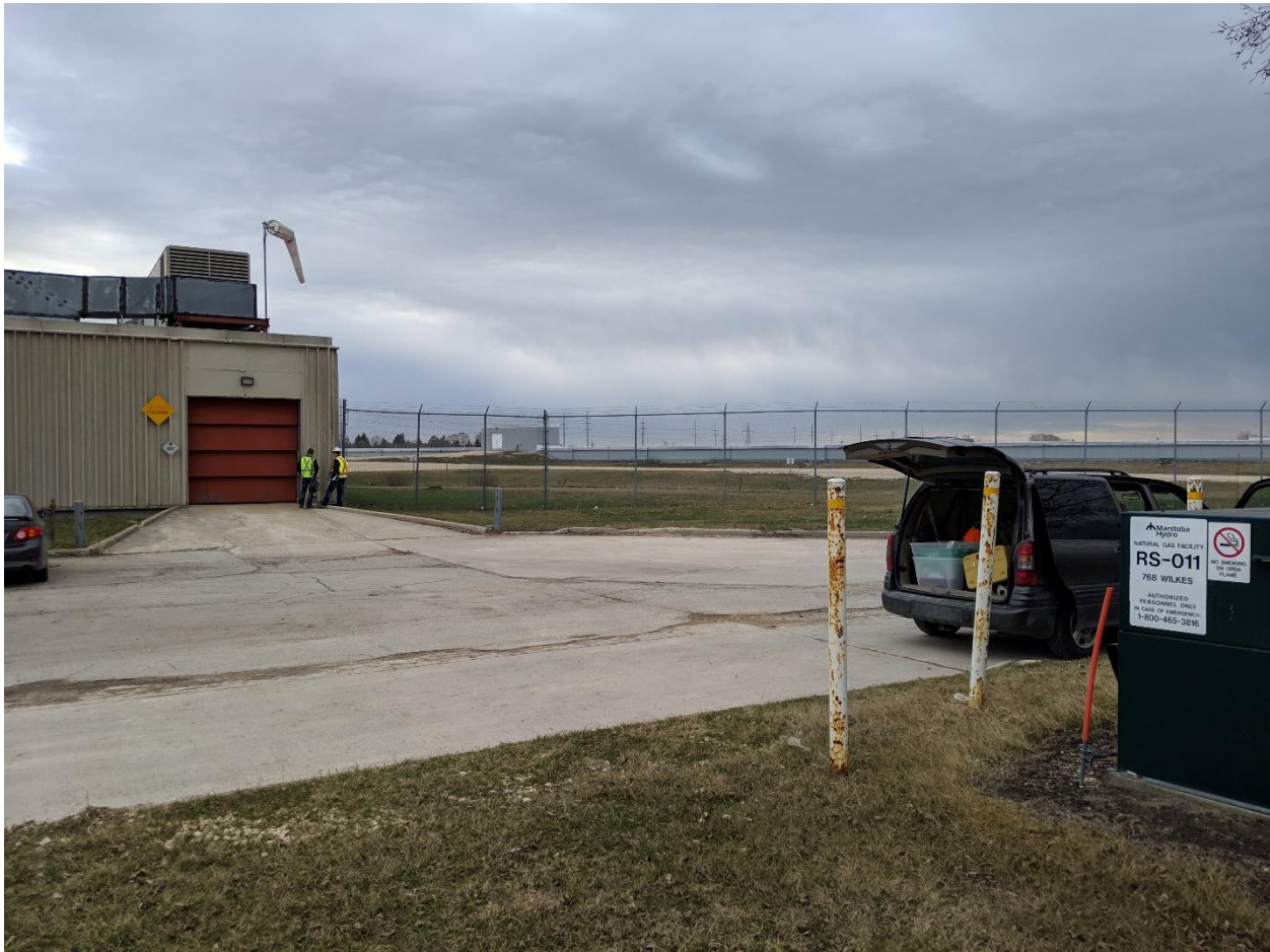
PHOTOGRAPH 3: Facing southeast showing the Hurst Pumping Station southwest elevation and overhead door to the Chlorine Storage Area. The Site security fence is also shown.