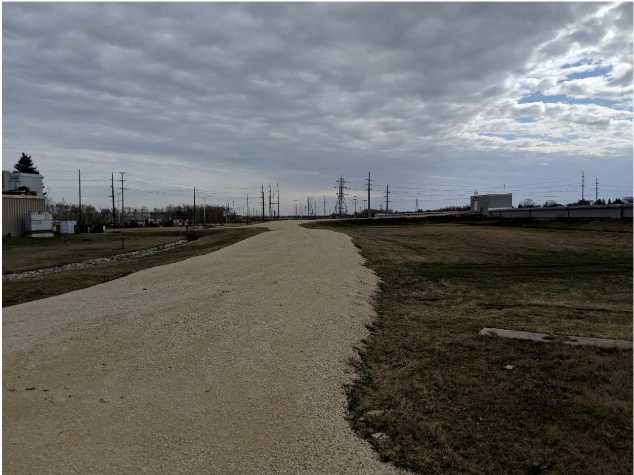
PHOTOGRAPH 5: Facing north-east showing the access road within the fenced Site, south of the Hurst Pumping Station.