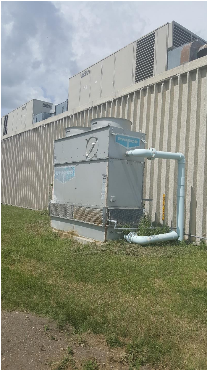
PHOTOGRAPH 20: Facing north-west showing the existing cooling tower located near the southeast corner of the Hurst Pumping Station.