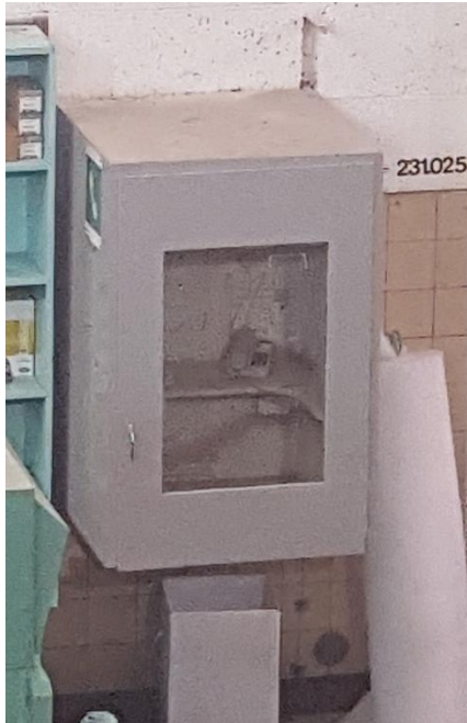
PHOTOGRAPH 13: Facing south showing the phone booth containing asbestos in lower pump floor area of the Hurst Pumping Station.