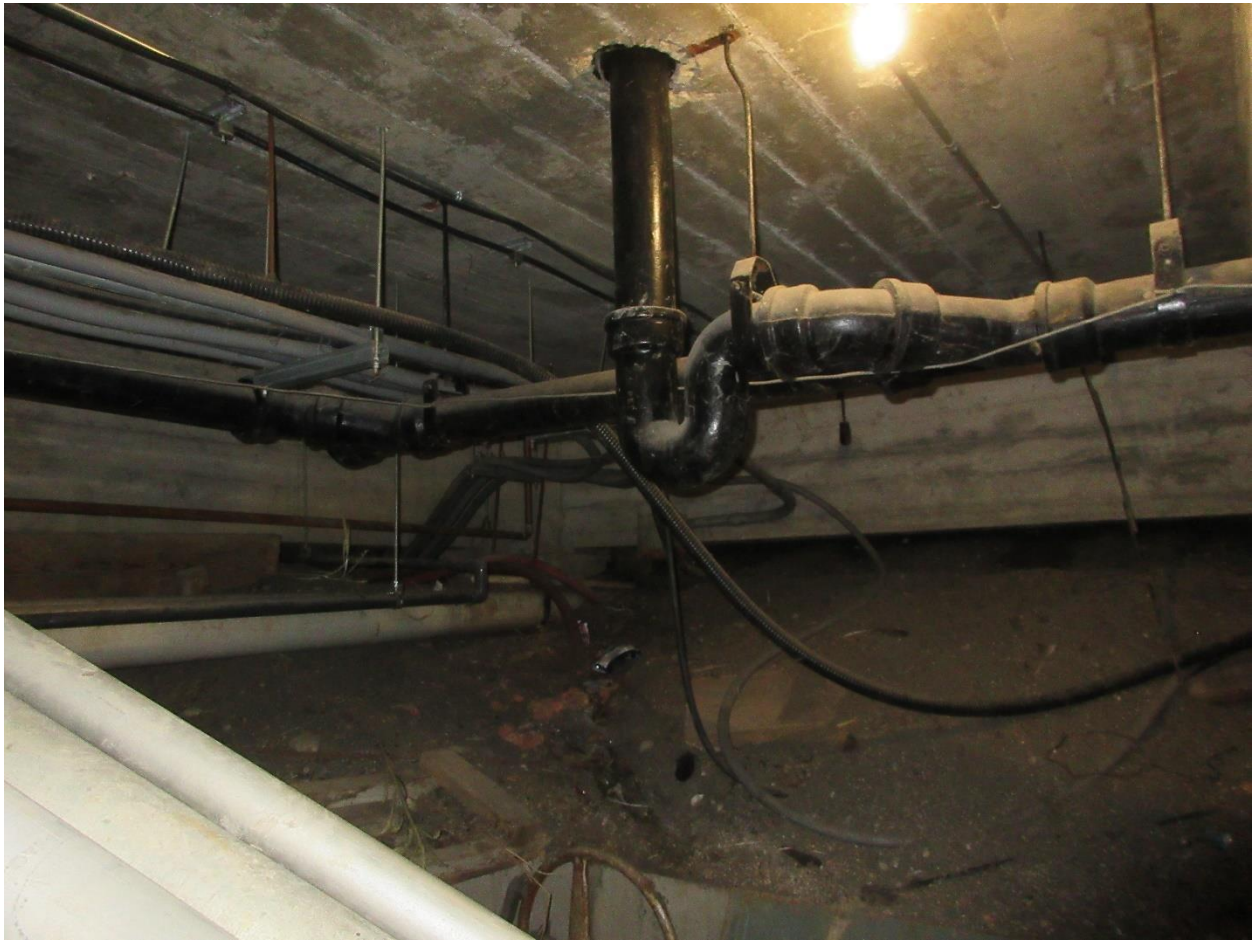
PHOTOGRAPH 17: Facing south-south-east showing piping in the existing crawlspace in the Hurst Pumping Station.