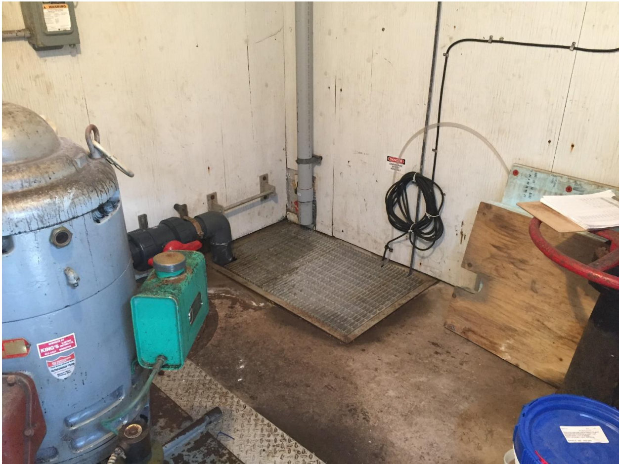
PHOTOGRAPH 23: Facing north-west in the Drainage Lift Station showing the grating above the discharge chamber and Lift Pump #2 (P-Y2) on the left side of the photograph.