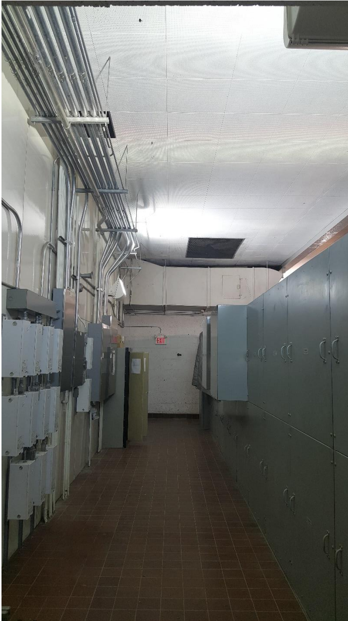
PHOTOGRAPH 12: Facing south showing the back view of the existing control equipment panels in the mezzanine of the Hurst Pumping Station.