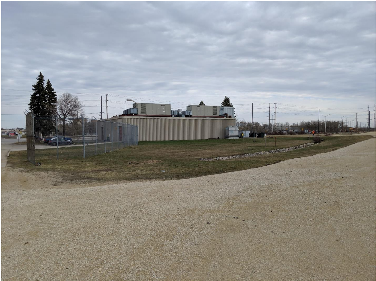
PHOTOGRAPH 4: Facing north-north-east showing the Hurst Pumping Station south elevation from within the fenced Site.