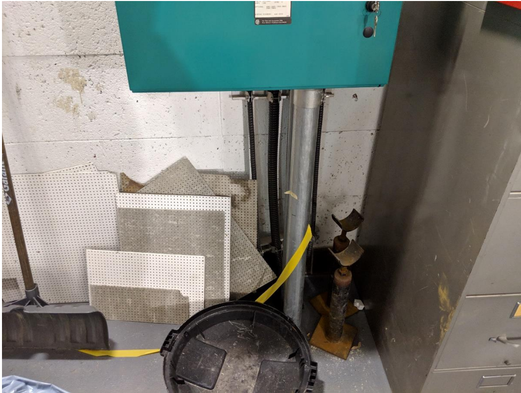
PHOTOGRAPH 14: Showing existing damaged ceiling tiles containing asbestos stored near the truck loading platform to be removed as part of abatement Work.