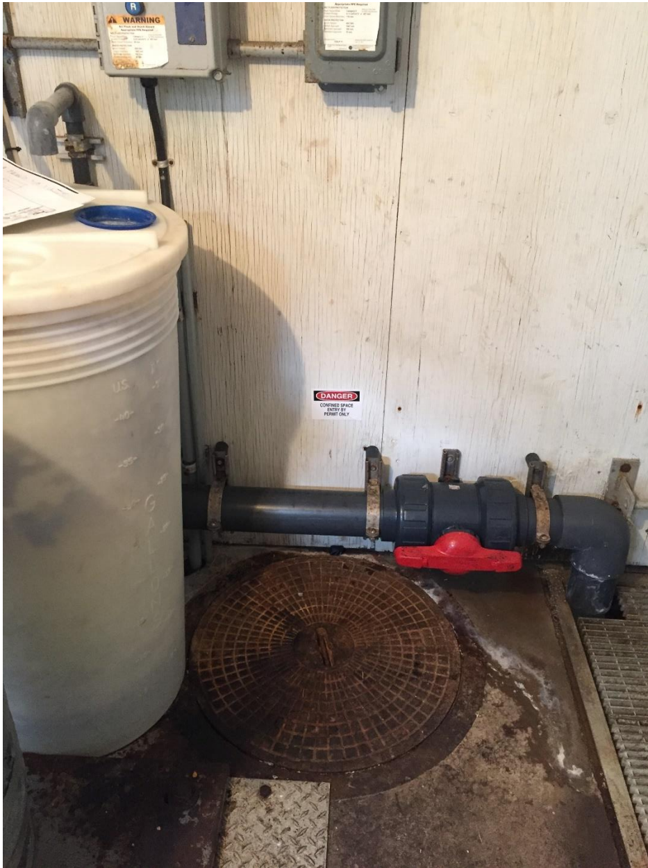
PHOTOGRAPH 26: Facing west in the Drainage Lift Station showing existing chemical batching tank (TK-Y100) on the left side of the photograph, manhole, and discharge piping for existing Lift Pump #1 (P-Y1).