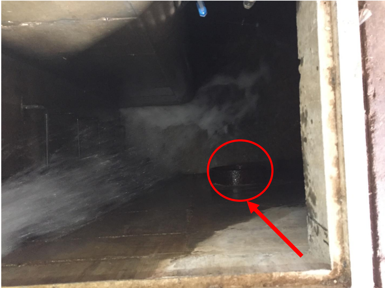
PHOTOGRAPH 18: Looking down into the discharge chamber of the Drainage Lift Station showing (circled in red) the existing 350mm discharge pipe where a new flap gate will be installed. Discharge from existing Lift Pump #1 (P-Y1) is shown in the bottom left hand corner of the photograph.