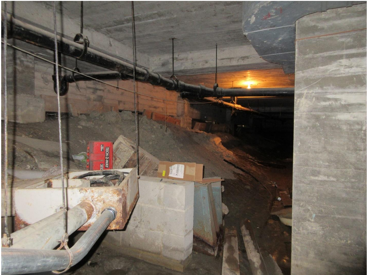
PHOTOGRAPH 15: Facing southwest showing pipe runs inside the existing crawlspace of the Hurst Pumping Station.