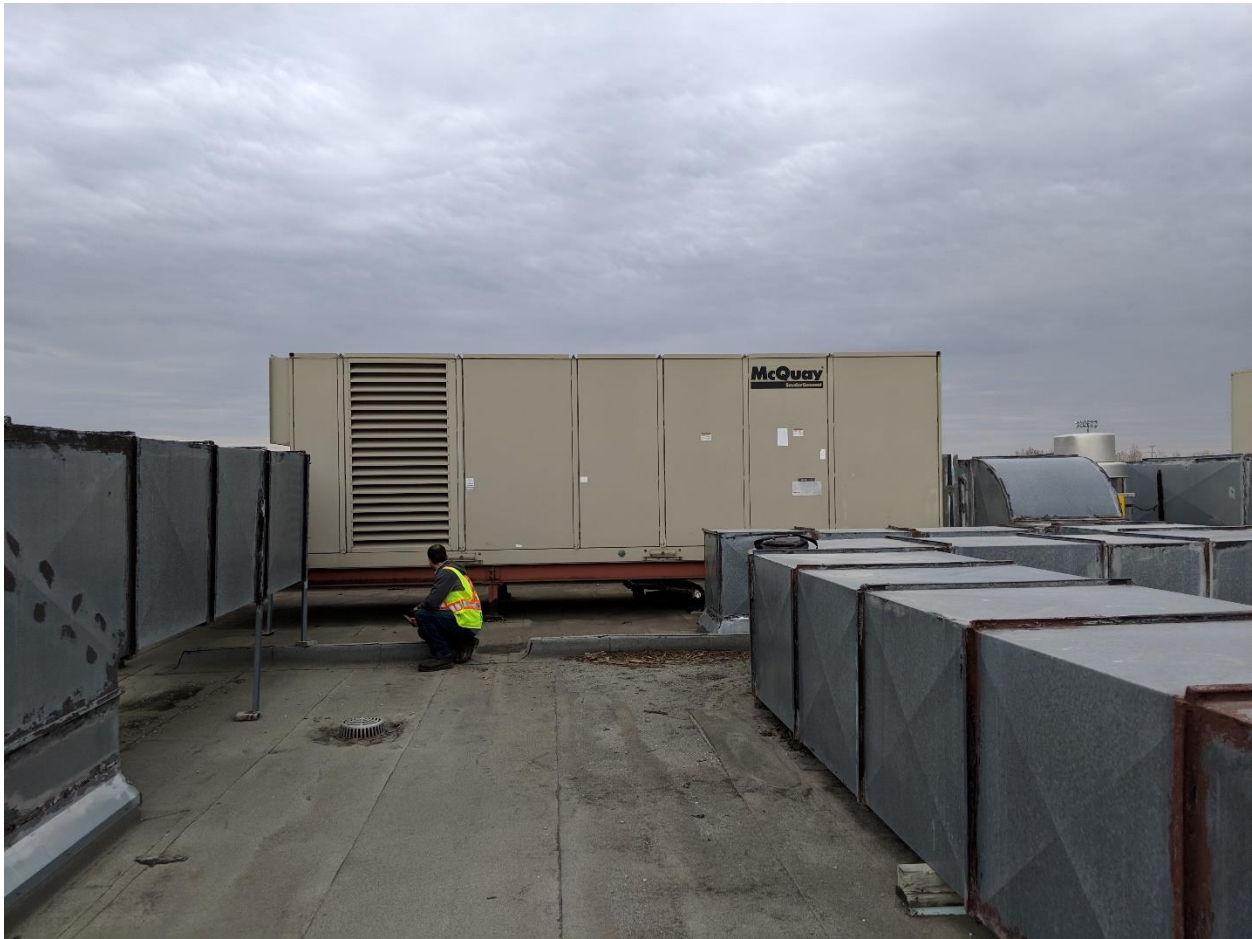
PHOTOGRAPH 7: Facing south showing the existing air handling unit AHU-1 installed on the southeast corner of the roof of the Hurst Pumping Station. The existing roof drain is shown between the supply and return ductwork.