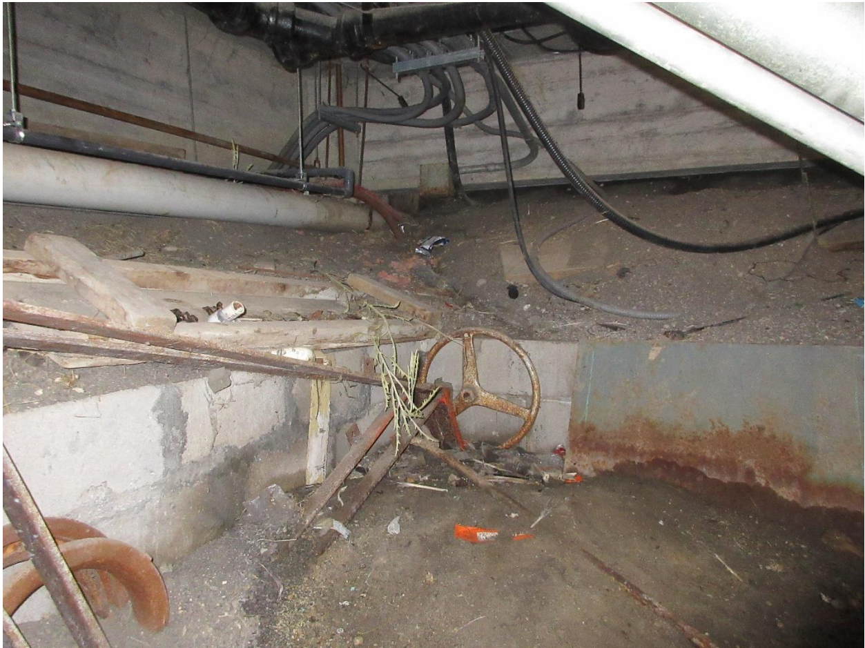
PHOTOGRAPH 16: Facing south-south-east showing piping inside the existing crawlspace in the Hurst Pumping Station.