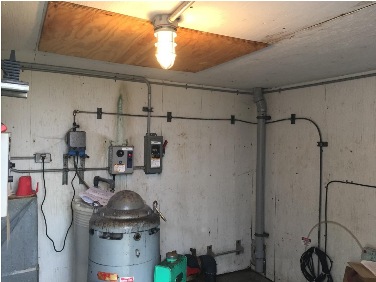
PHOTOGRAPH 22: Facing north-west in the Drainage Lift Station showing the Lift Pump #2 (P-Y2) in the foreground.