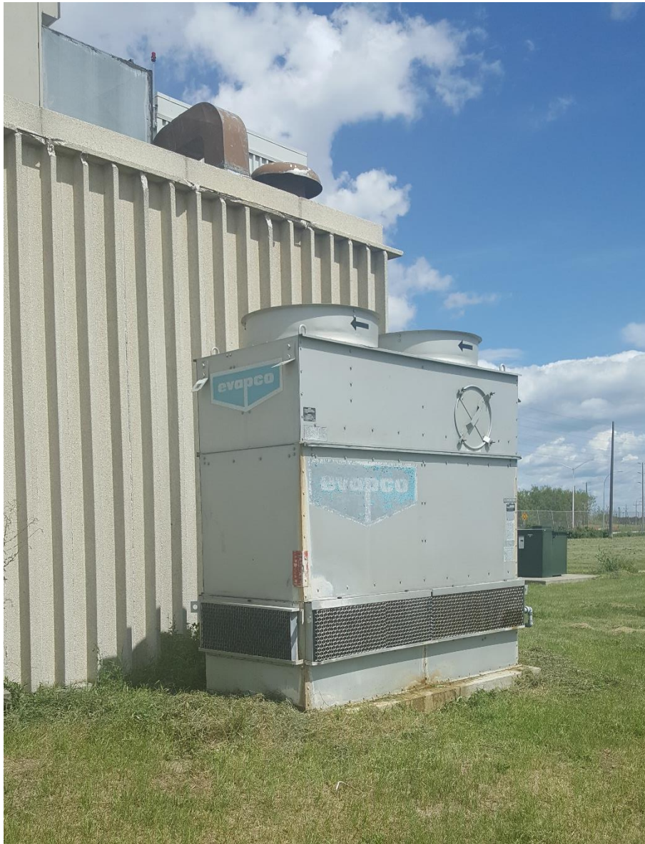
PHOTOGRAPH 19: Facing north-east showing the existing cooling tower located near the southeast corner of the Hurst Pumping Station.