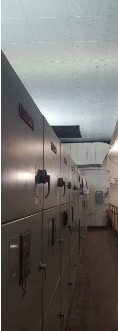
PHOTOGRAPH 11: Facing south showing the front view of the existing control equipment panels in the mezzanine of the Hurst Pumping Station.