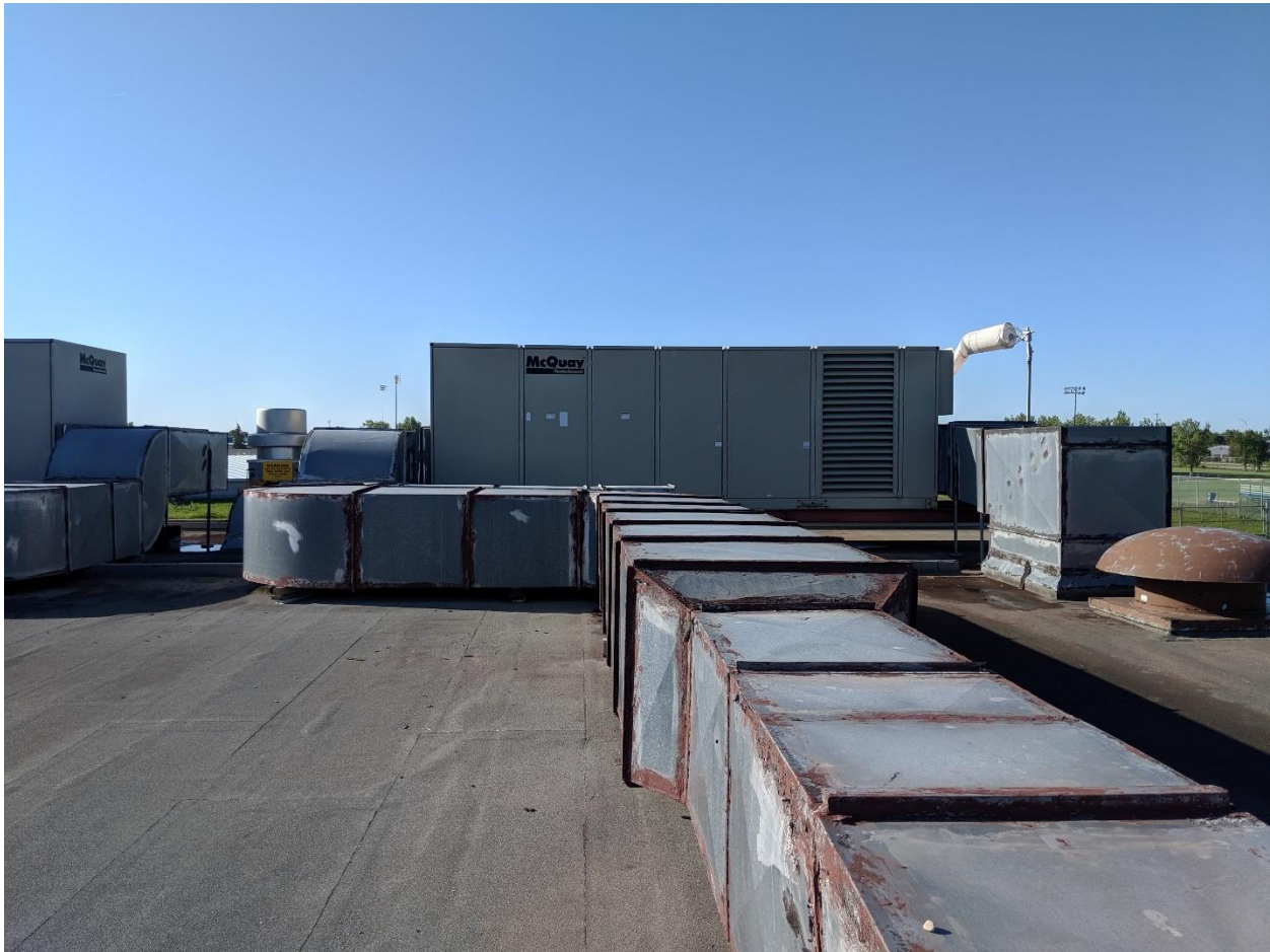
PHOTOGRAPH 8: Facing south showing the existing air handling unit AHU-2 installed on the southwest corner of the roof of the Hurst Pumping Station.