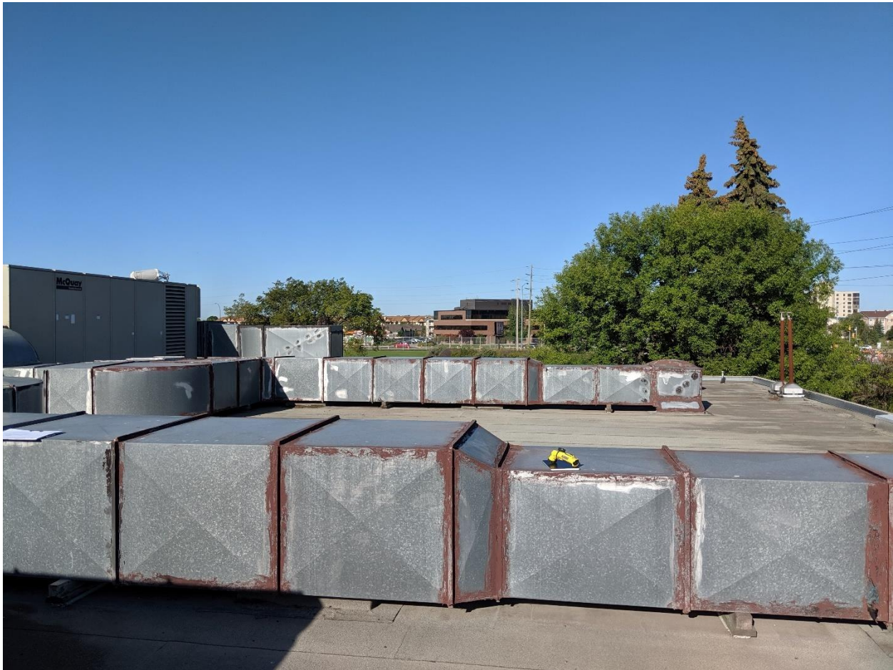
PHOTOGRAPH 6: Facing west showing the roof of the Hurst Pumping Station. The existing air handling unit AHU-2 is shown on the left. The existing ductwork for the existing air handling unit AUH-1 is shown in the foreground and the existing ductwork for the existing air handling unit AHU-2 is shown in the background. The two existing vent stacks for the generator exhausts are shown on the right in the background.