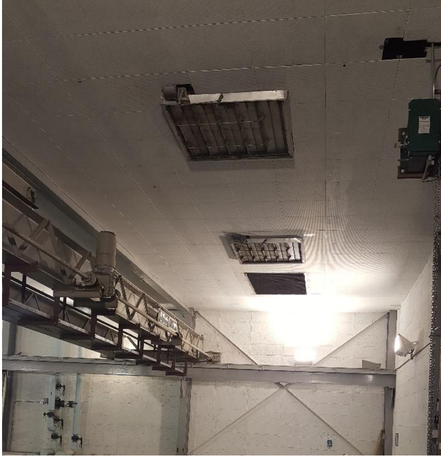
PHOTOGRAPH 10: Facing south showing the existing crane above the pump floor in the Hurst Pumping Station.