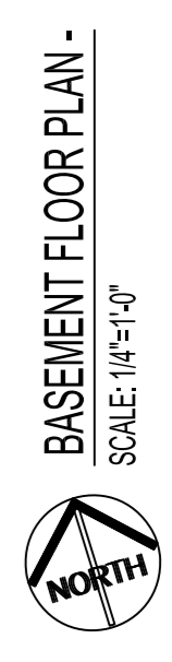
BASEMENT FLOOR PLAN - SCALE: 1/4"=1'-0"